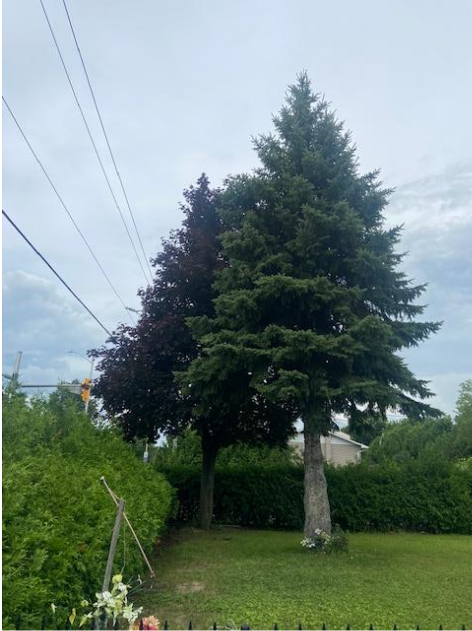
Trees #1 and #2, white spruce and crimson Norway Maple