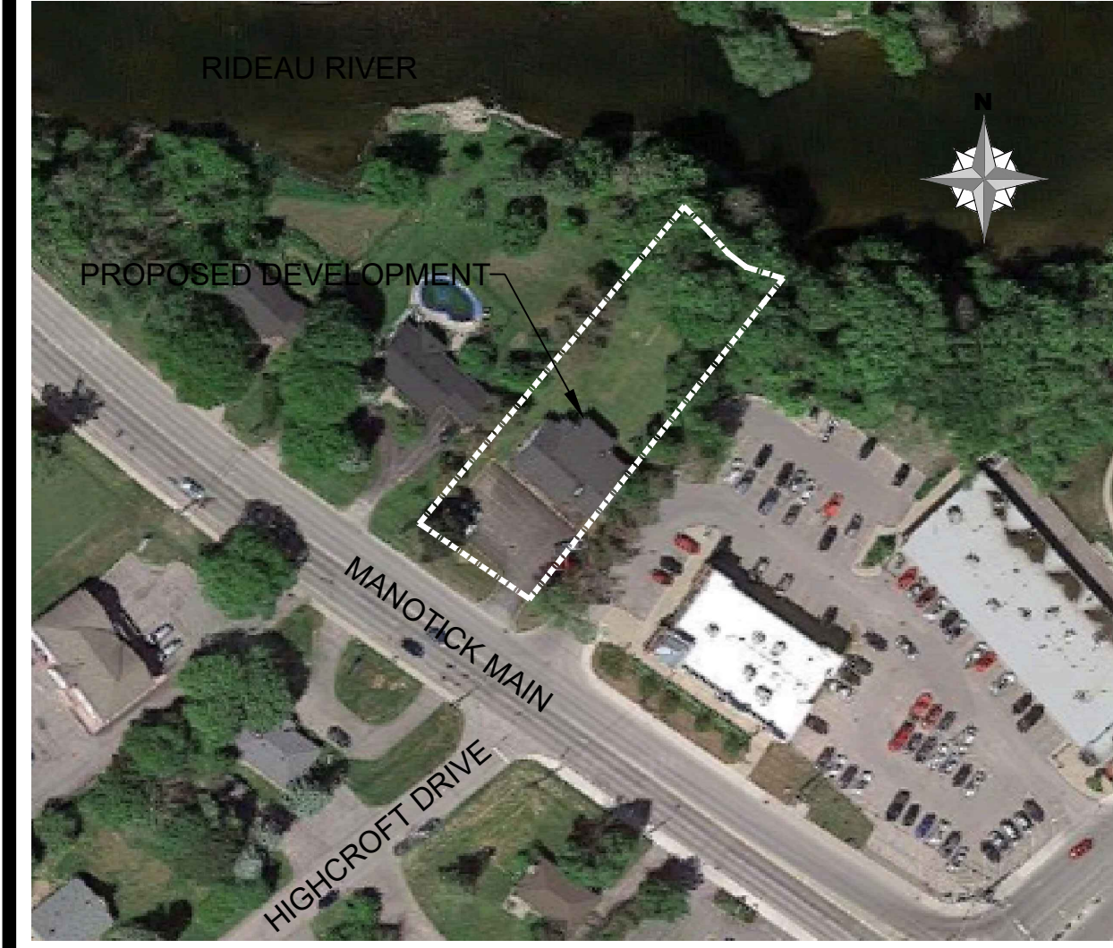
2 LOCATION PLAN SP-01 N.T.S.