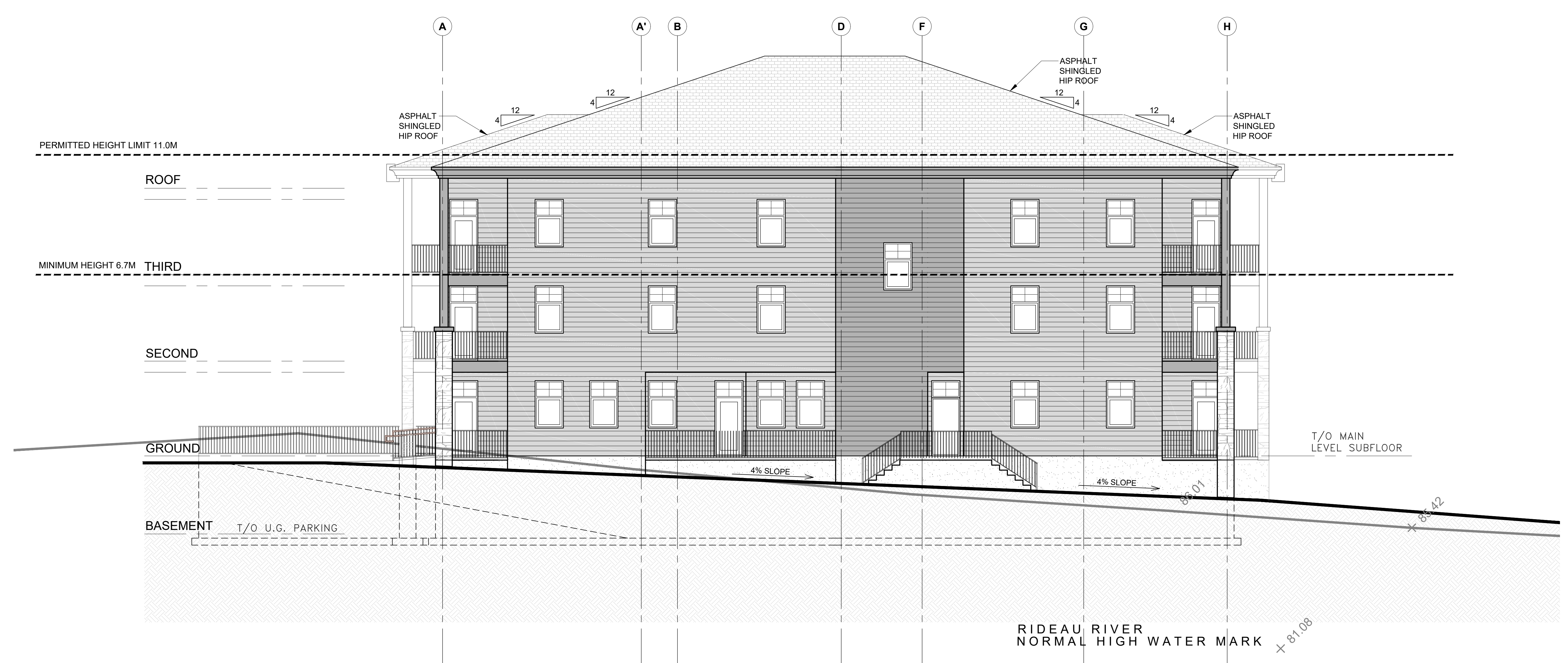
1 EAST ELEVATION A-02.1 SCALE = 1:75