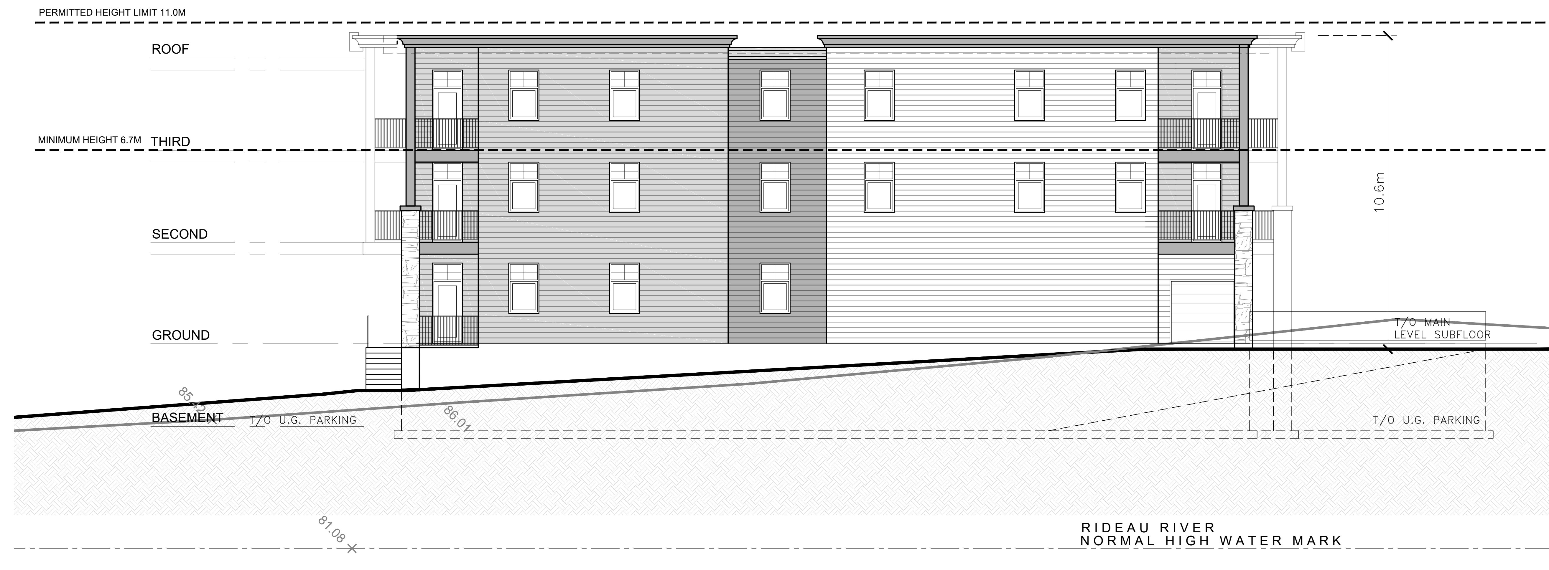
2 LEFT SIDE ELEVATION A-3 SCALE = 1:75