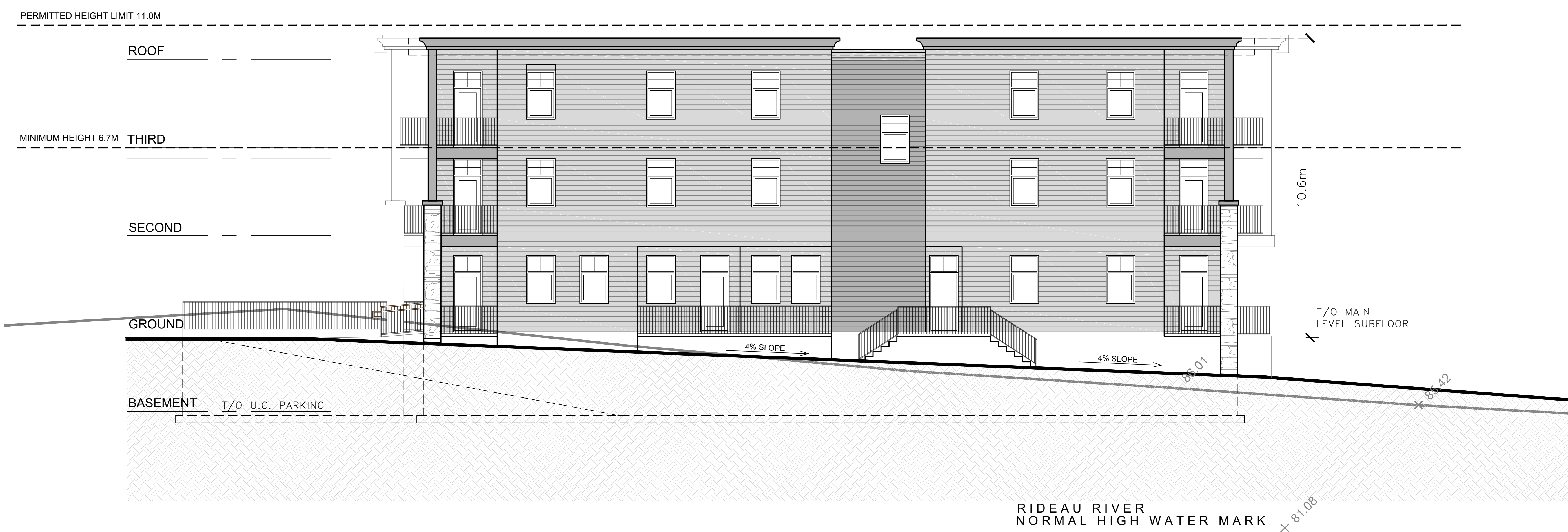
2 A-2 RIGHT SIDE ELEVATION SCALE = 1:75