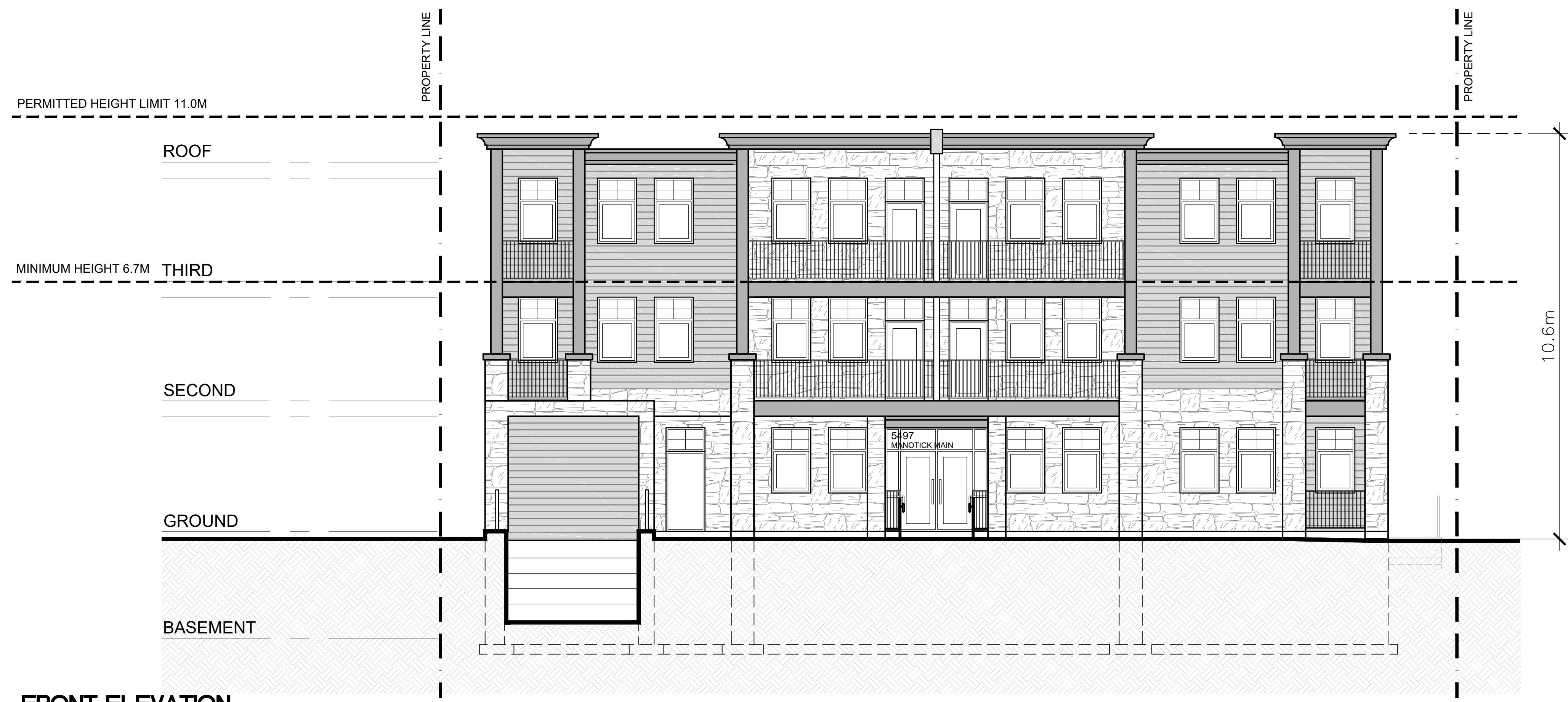
1 FRONT ELEVATION A-2 SCALE = 1:75

141 Catherine Street, Unit 102 Ottawa, Ontario K2P 1C3