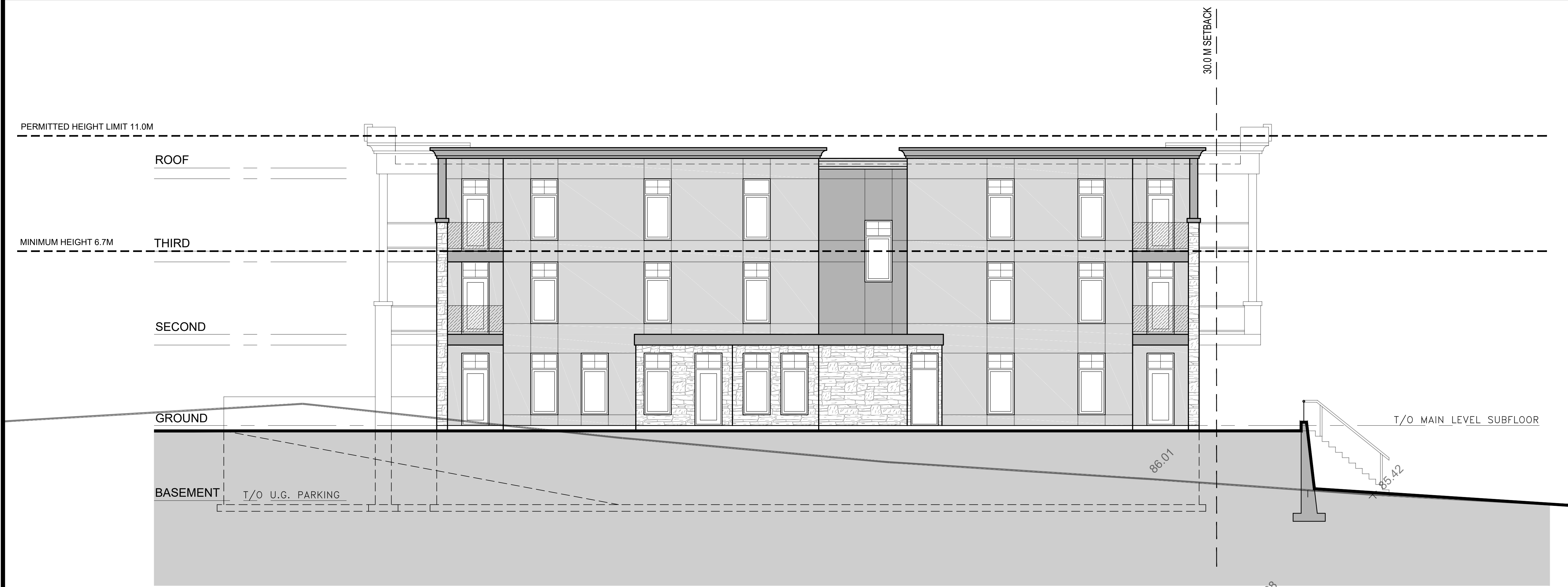
2 RIGHT SIDE ELEVATION SCALE = 1:75