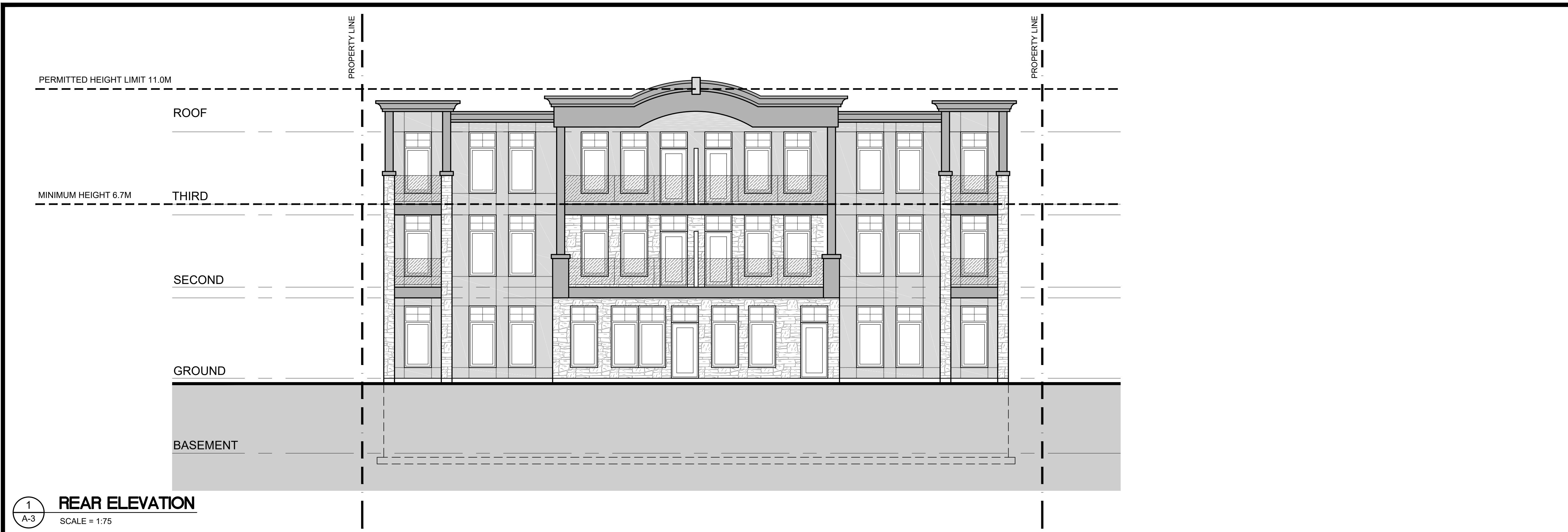
1 A-3 REAR ELEVATION SCALE = 1:75