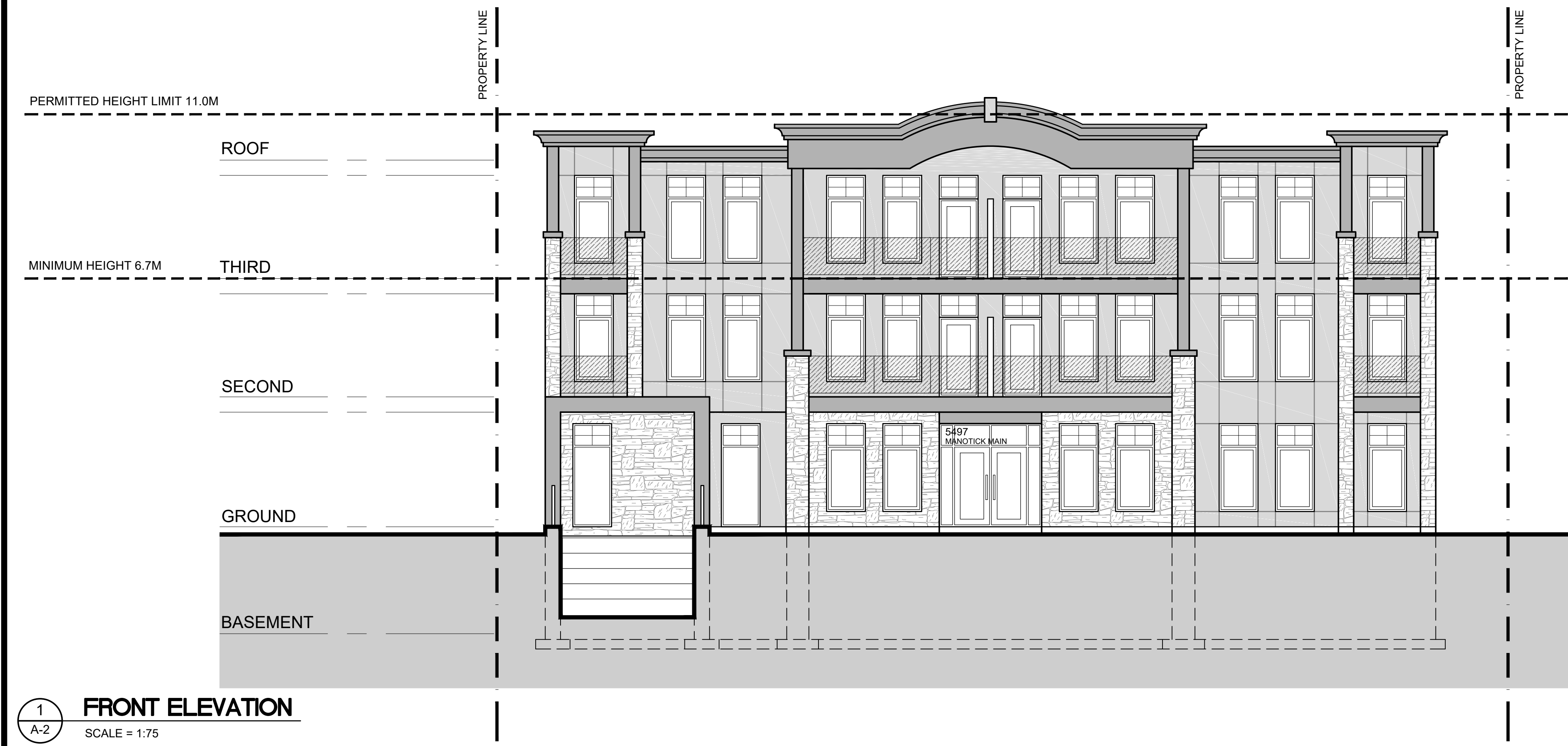
1 FRONT ELEVATION SCALE = 1:75