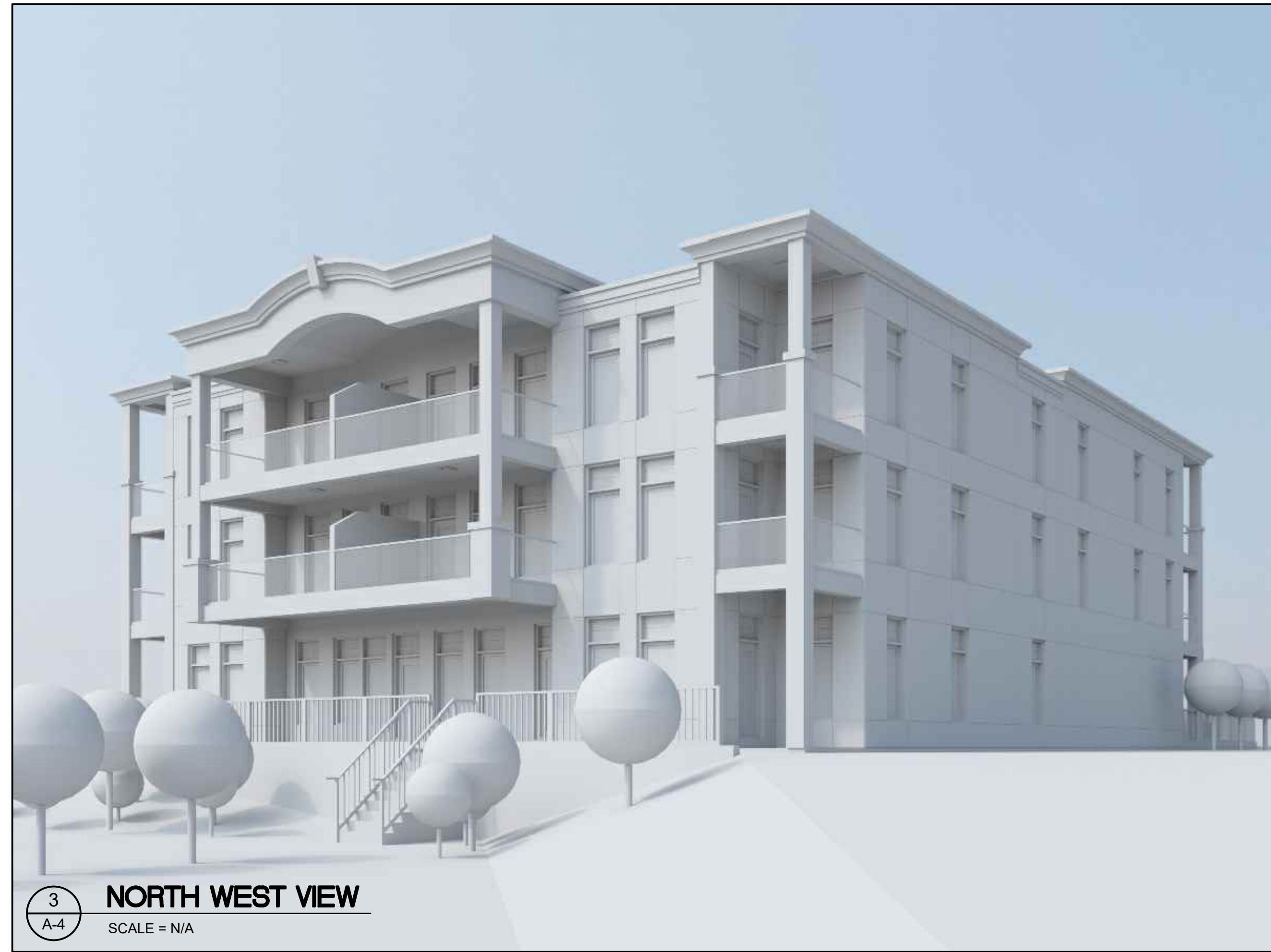
3 NORTH WEST VIEW A-4 SCALE = N/A