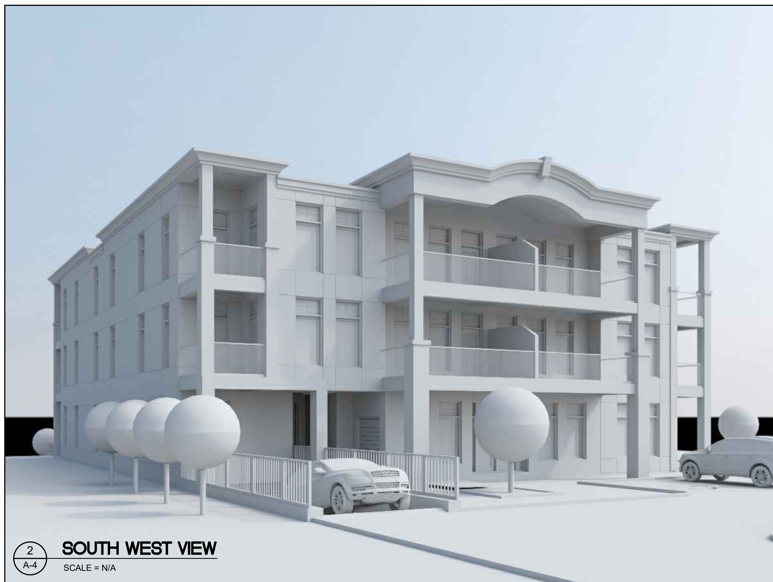
2 SOUTH WEST VIEW A-4 SCALE = N/A