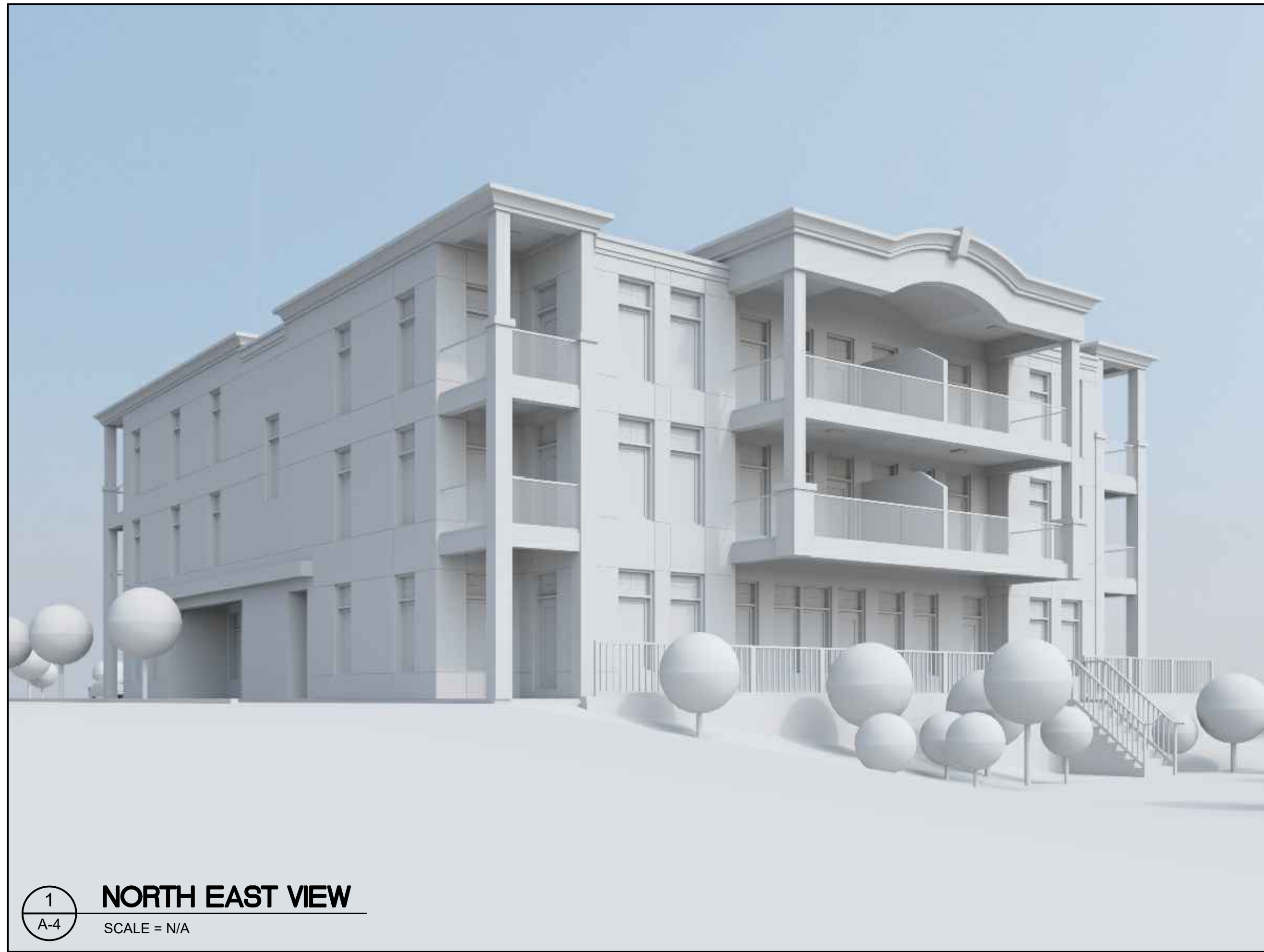
1 NORTH EAST VIEW A-4 SCALE = N/A