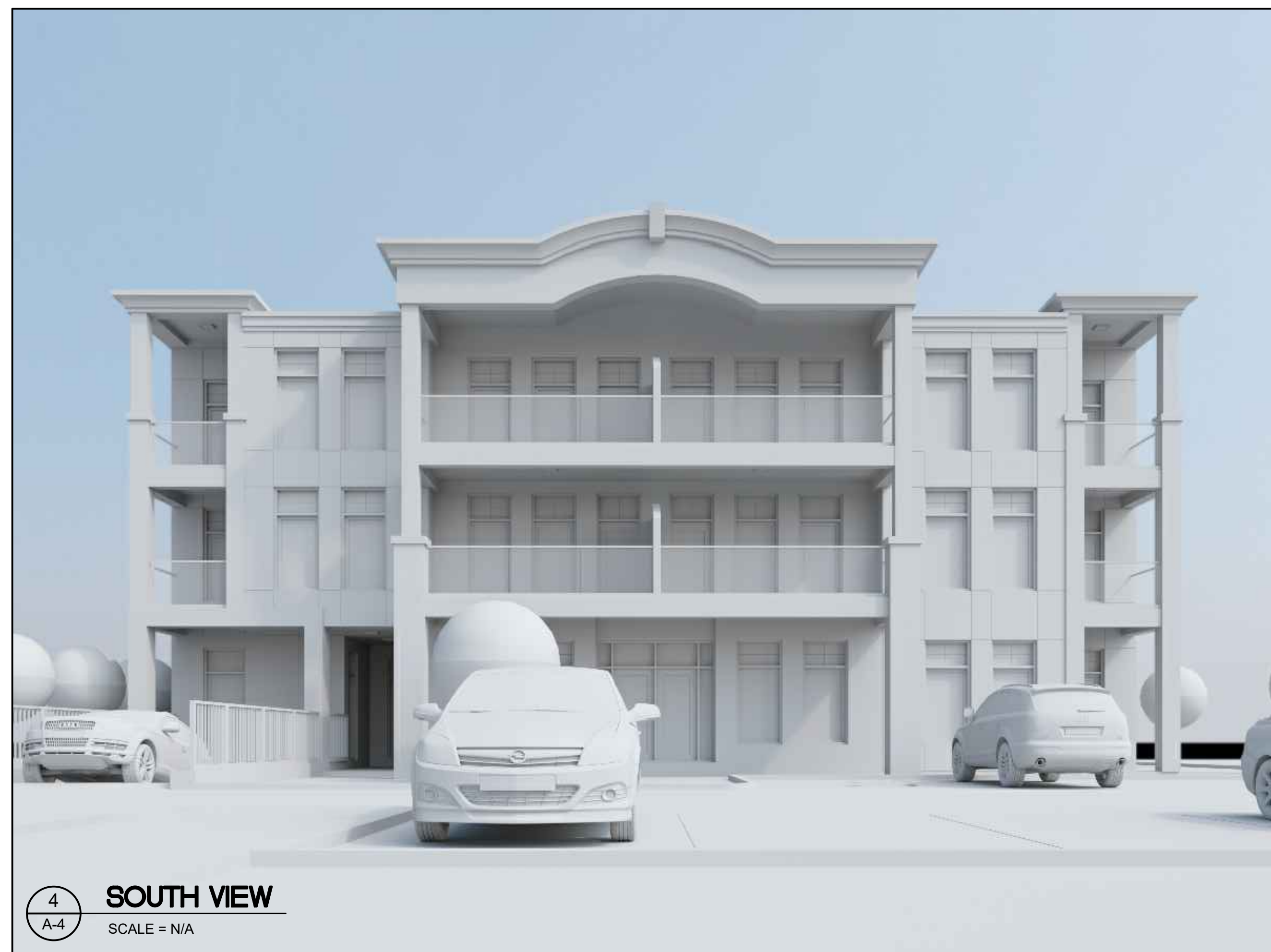
4 SOUTH VIEW A-4 SCALE = N/A