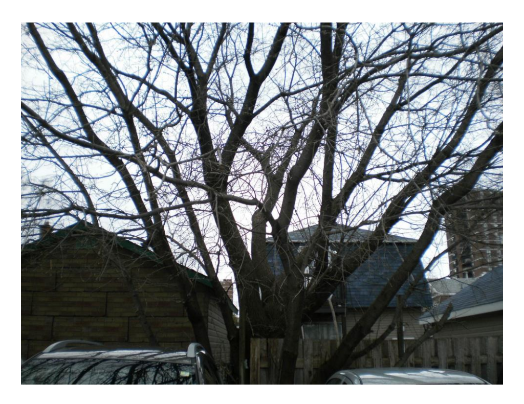
Photo 1 – Typical Manitoba maple in the southeast corner of the site

butternuts were observed on or adjacent to the site and the chimneys on the existing buildings on and adjacent to the site were either vented or screened.