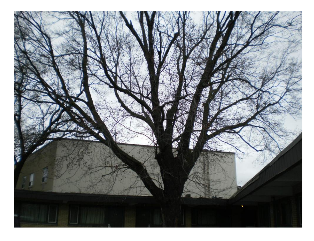
Photo 3 – Mature red maple in the northwest corner of the site in front of the existing motel units