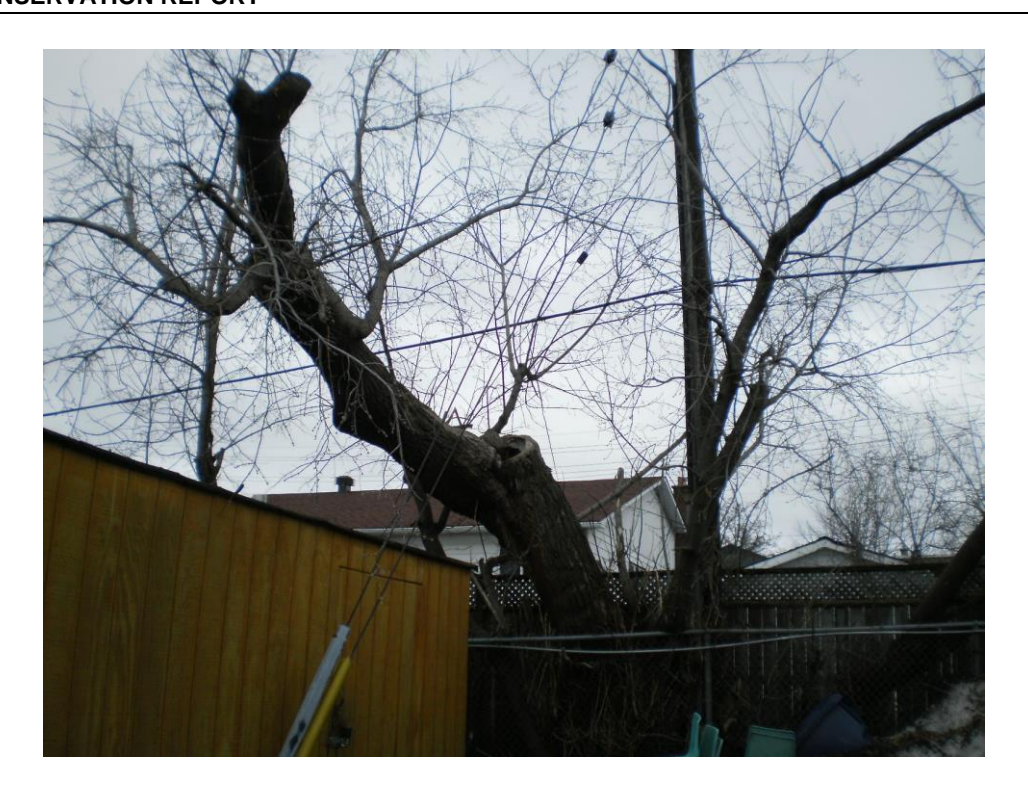
Photo 2 – Heavily pruned Manitoba maple just to the north of the north-central portion of the site. View looking north from the north-central edge of the site