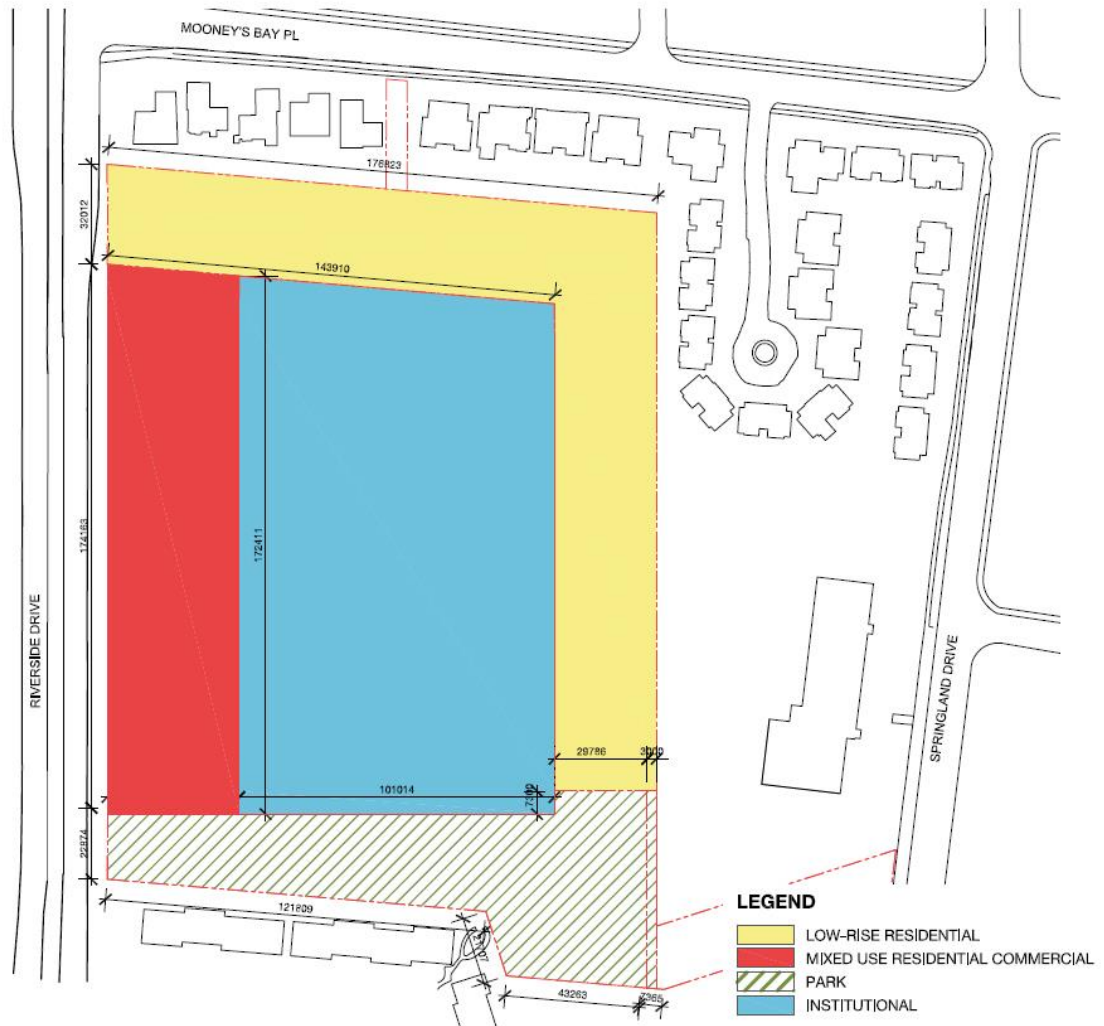
Figure 1: Proposed Secondary Plan Designations

As described in the original Planning Rationale, an amendment to the Riverside Park Secondary Plan is required as the site is designated Institutional – Elementary School. The proposed amendment has been further refined per Figure 1 below in order to amend the current institutional land use designation to the land uses specified.