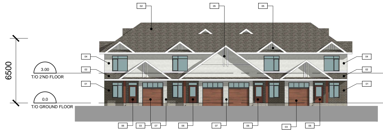
BUILDING TYPE 'A-3' FRONT ELEVATION