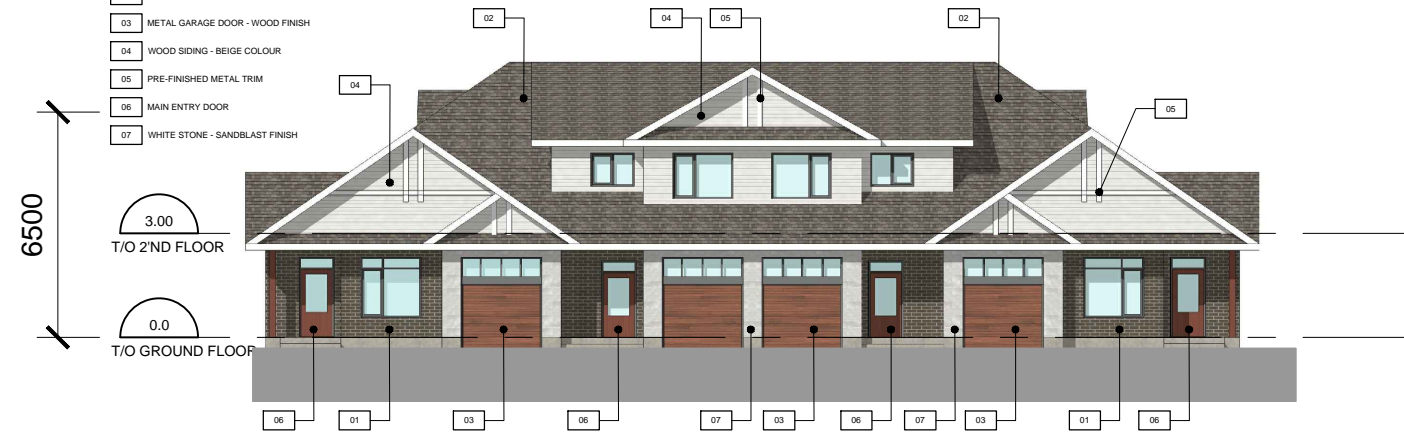
BUILDING TYPE 'A-1 & A-2' FRONT ELEVATION