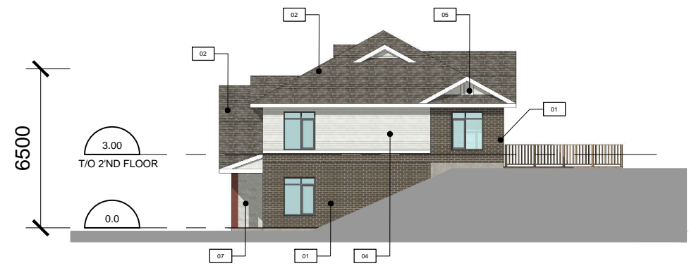
BUILDING TYPE 'A-3' SIDE ELEVATION