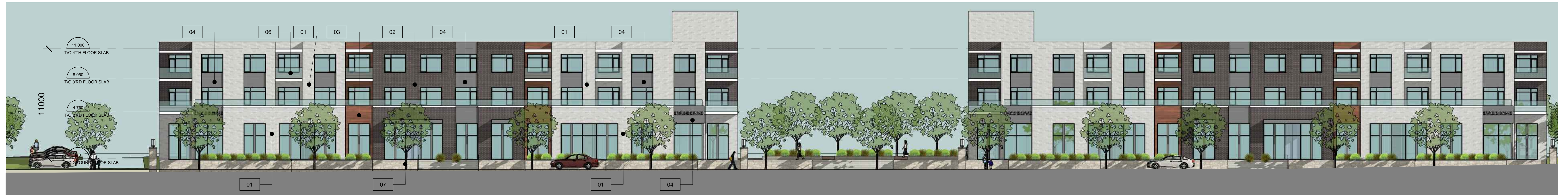
WEST ELEVATION (RIVERSIDE DRIVE)