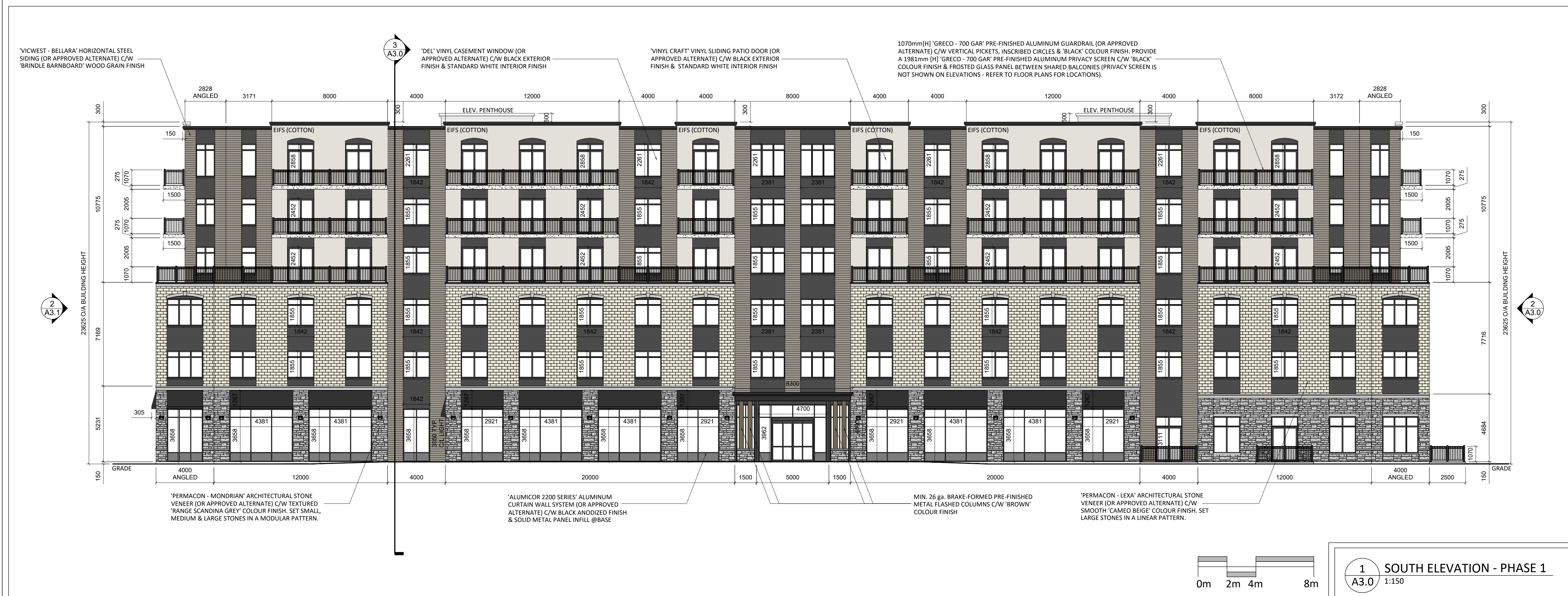
1 SOUTH ELEVATION - PHASE 1 A3.0 1:150