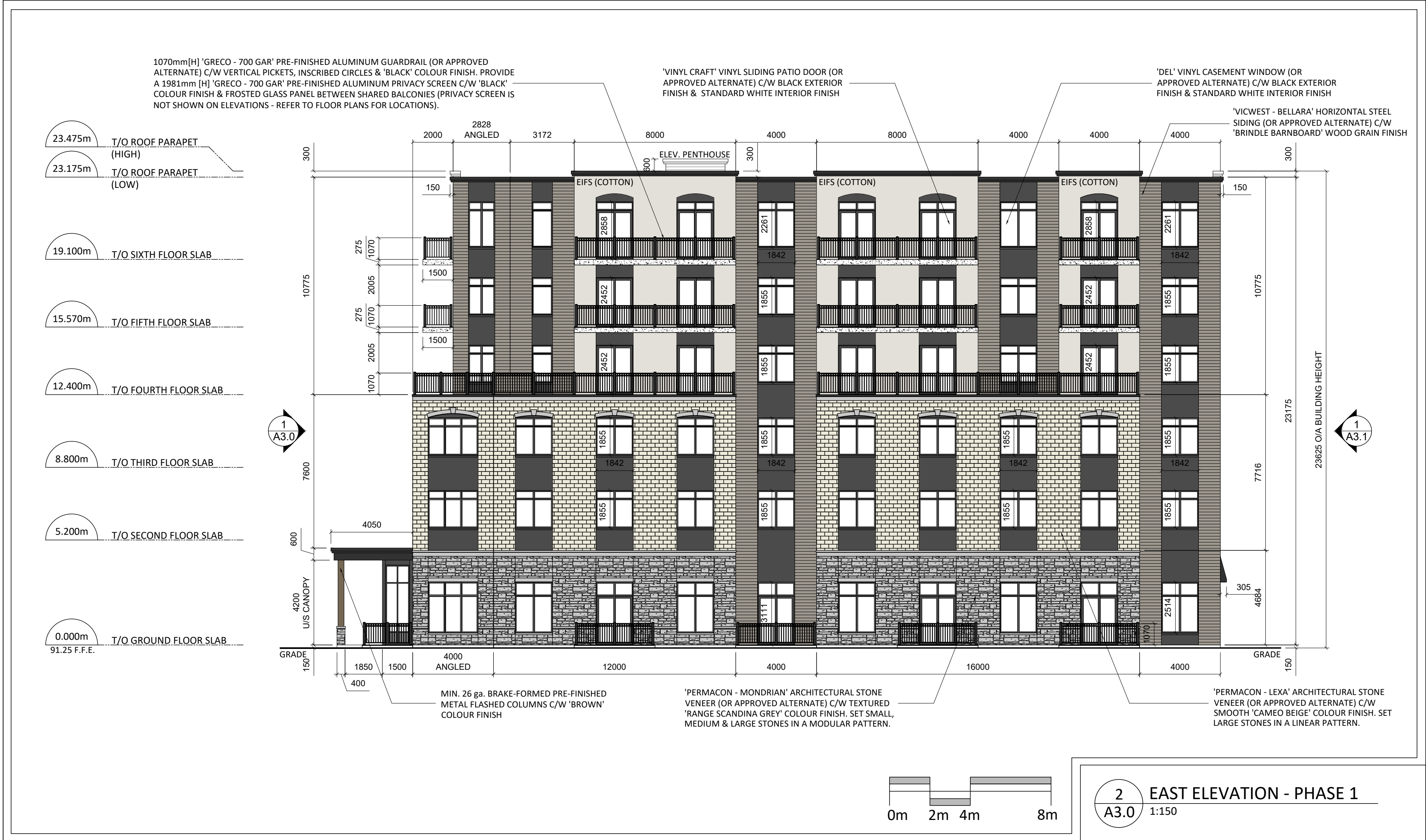
2 EAST ELEVATION - PHASE 1 A3.0 1:150