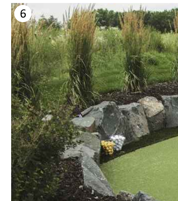
6 BERMED/ RAISED PLANTING (OVER PARKING GARAGE)