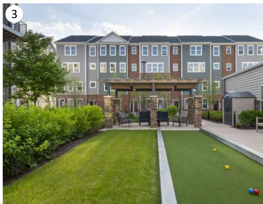
3 BOCCIE COURT (ARTIFICIAL TURF)