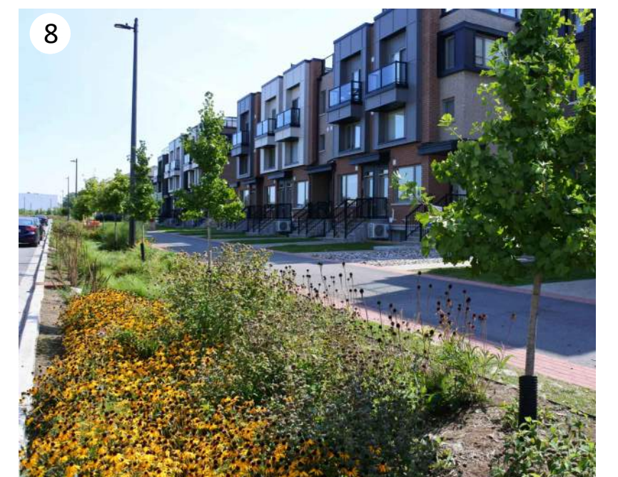
8 LID PLANTING - BIORETENTION AREAS