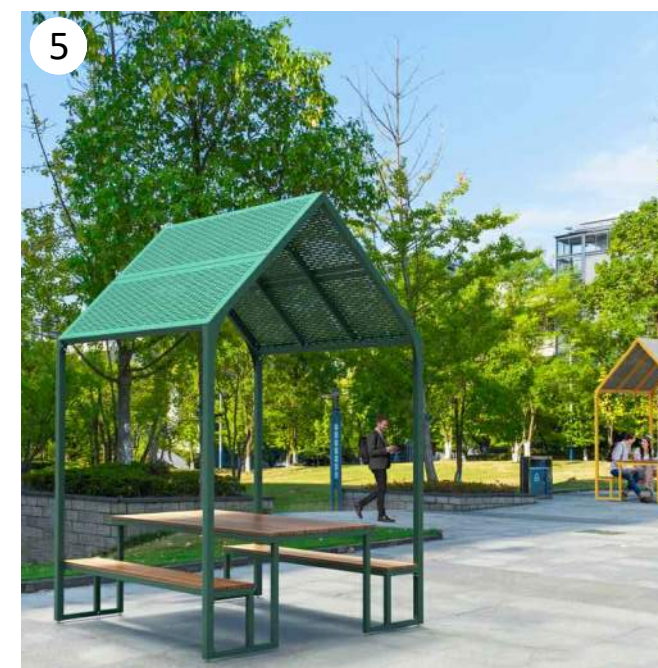
5 STAFF AMENITY AREA