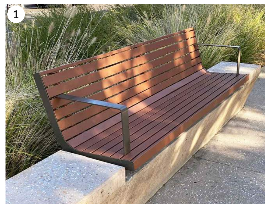
1 PRECAST CONCRETE PLANTERS WITH SEATING