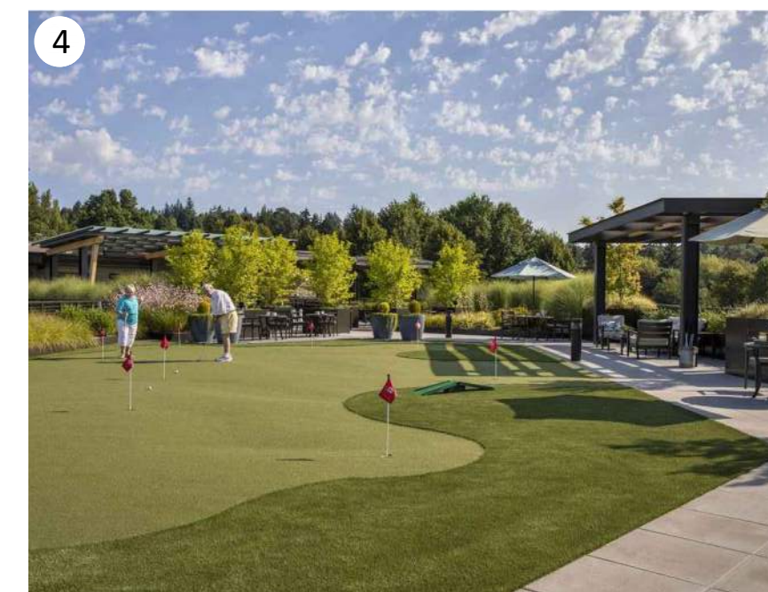
4 PUTTING GREEN (ARTIFICIAL TURF)