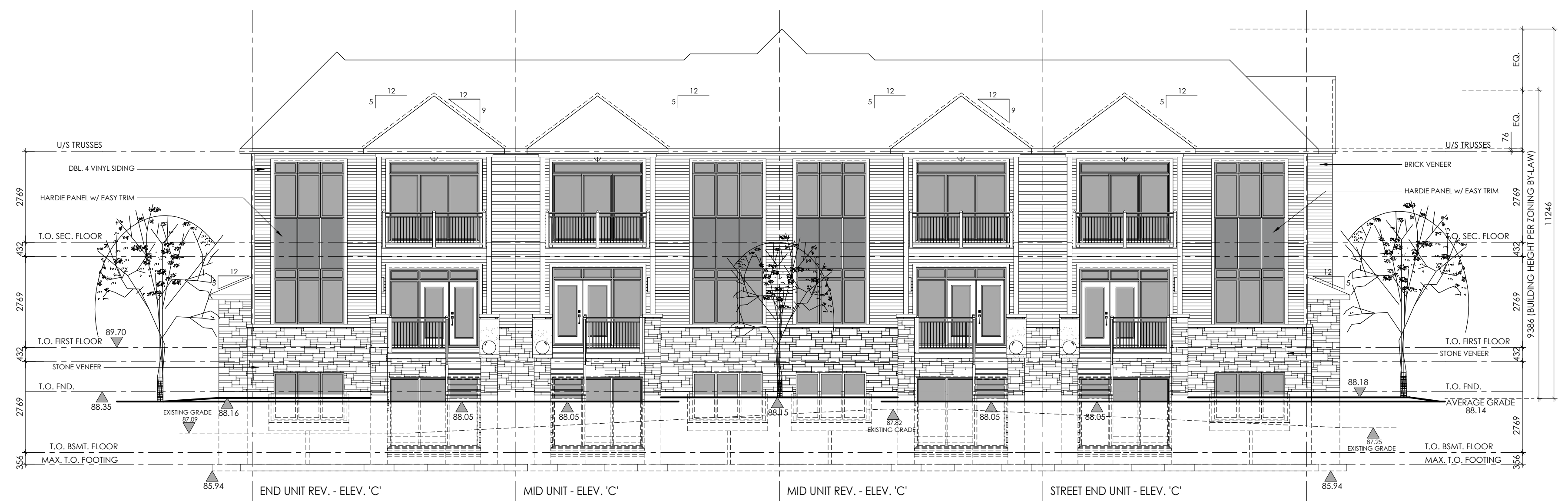
TYPICAL BLOCK - PUBLIC STREET ELEVATION (BLOCK 5 SHOWN, GRADES SHOWN ARE TAKEN FROM STANTEC GRADING PLAN)

M. David Blakely Architect Inc. 2200 Prince of Wales Dr. - Suite 101 Ottawa, Ontario K2E 6Z9 Phone (613) 226-8811 Fax (613) 226-7942