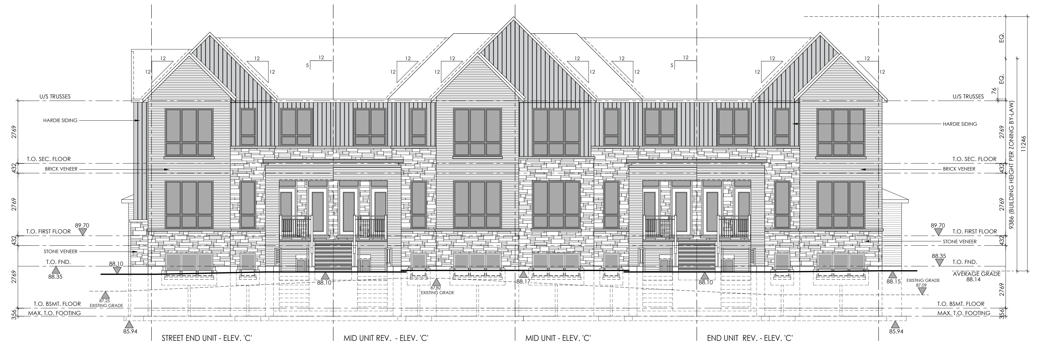
TYPICAL BLOCK - PRIVATE STREET ELEVATION (BLOCK 5 SHOWN, GRADES SHOWN ARE TAKEN FROM STANTEC GRADING PLAN)