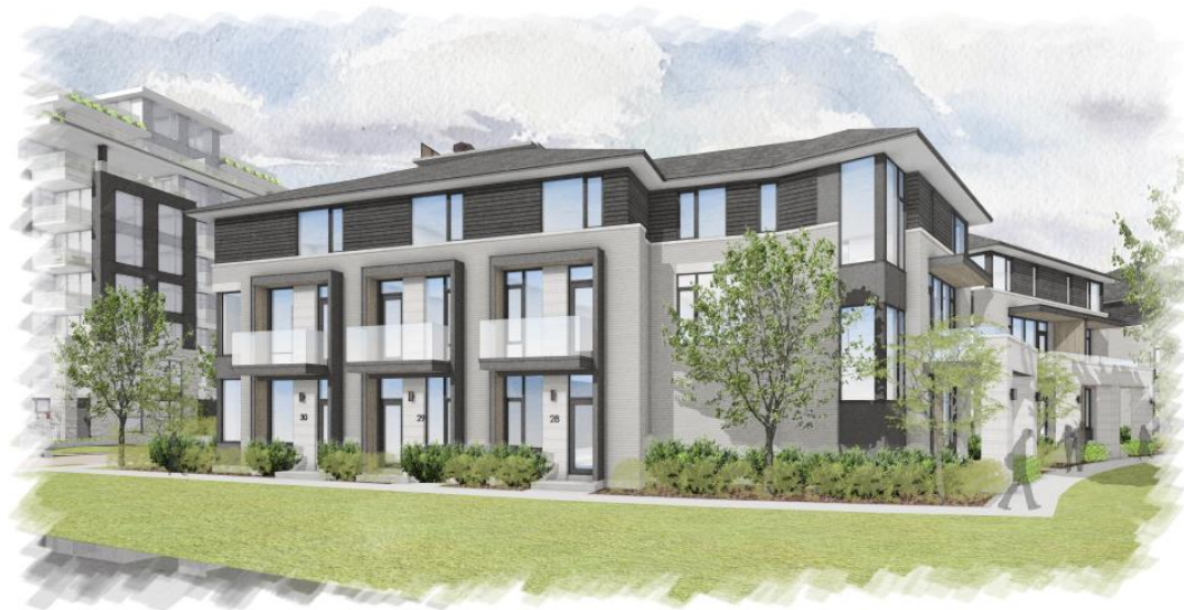
Figure 12: View from Oblates Avenue to Units C.