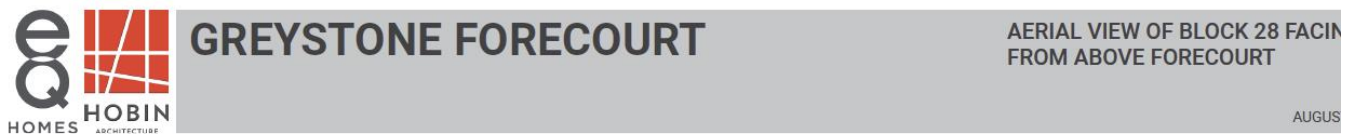
Figures 6: View illustrating the positioning of the townhomes and the introduction of widened terraces, which reinforce the crescent form of the forecourt Hobin August 2024.