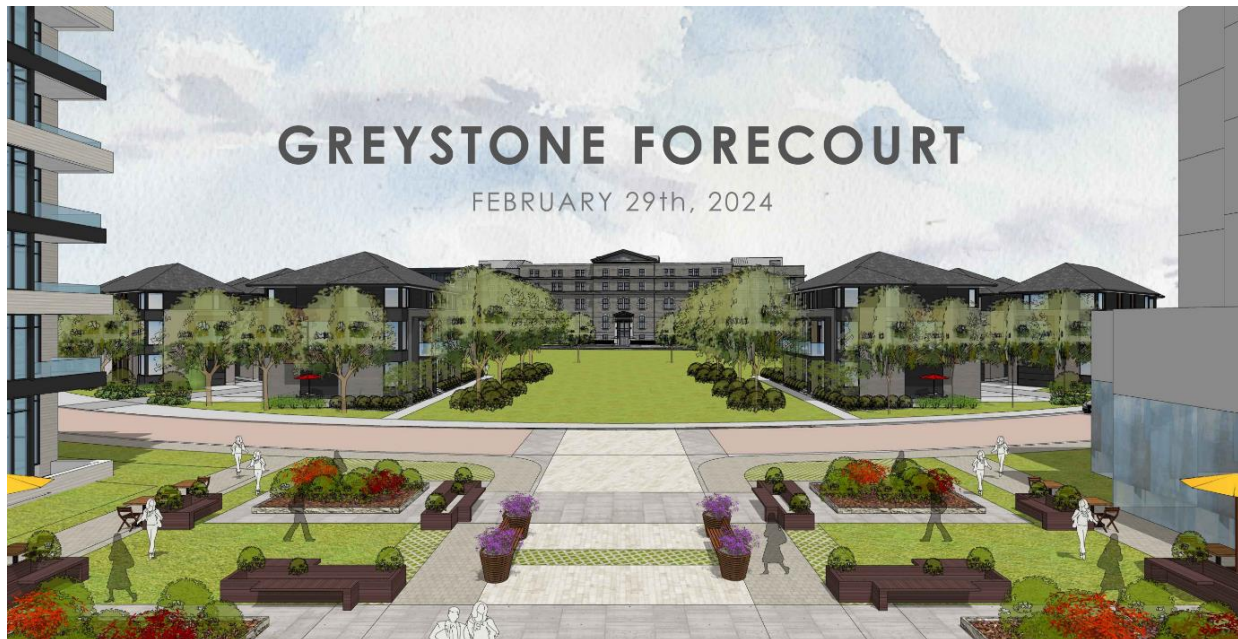
Figure 7: Axial view to the Deschâtelet Building from the Grand Allée.