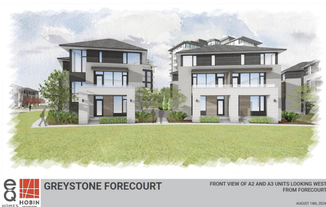
Figure 10: Views from Forecourt Park to Units A2 and A3. Hobin April 2024