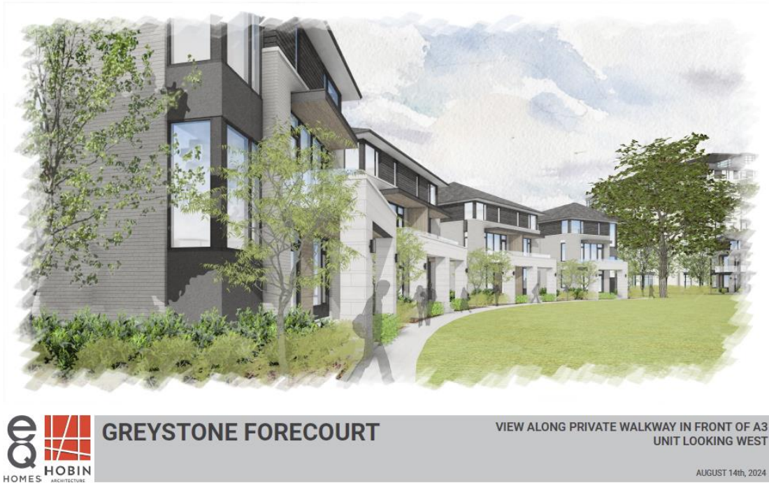
Figure 8: A view from within the forecourt, emphasizing the crescent form. Hobin August 2025.