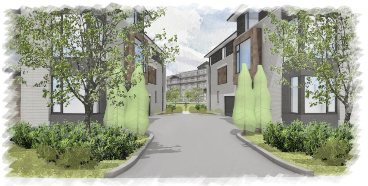
Figure 14 & 15: Views from Oblates Avenue to Units C and the car court.