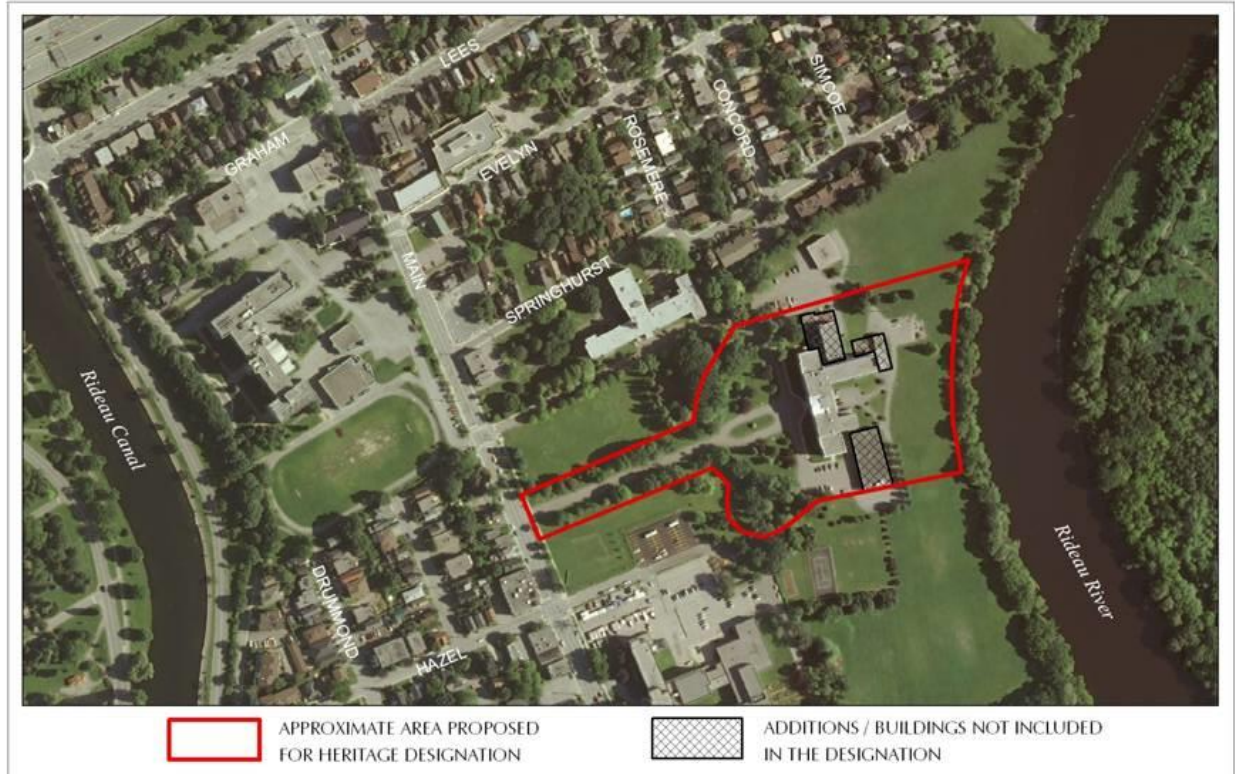
Figure 1: Overview of the site prior to construction, with the area designated portion outlined in red. Note the elongated shape of the walkway in front of the Deschâtelet Building, City of Ottawa, 2016.

The gymnasium, archives to the south of the building, the one-storey addition to the north and east of the Chapel, the structure to the north of the Chapel, and the small structure to the north and east of the Deschâtelet Building itself are not included in this designation. The interior of the building is not included in the designation.