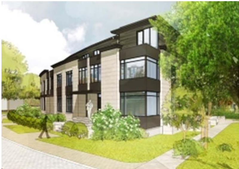
Figures 2 and 3: 2015 Plan view of an earlier version of the back-to-back townhomes/rowhouses forming the edge of the semicircular Forecourt to the Deschâtelet Building. Perspective view of the proposed townhomes. Credit: Regional Group Inc. 2015.

The development Blocks 28 and 29 are located on the western edge of the designated landscape associated with the Deschâtelet Building. The development blocks 28 and 29 are bisected into two approximately equal parts by the Grand Allée and bordered by the semicircular forecourt to the east and Deschâtelet Avenue to the west.