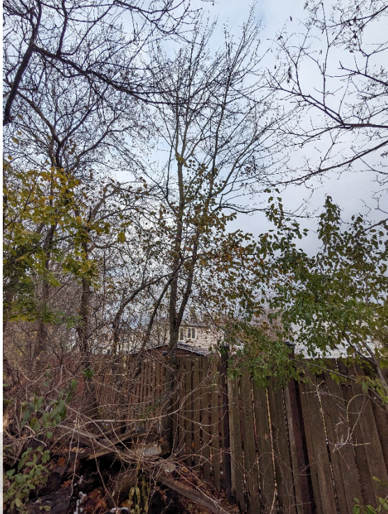
Left: Tree 22 – private maple to be removed.