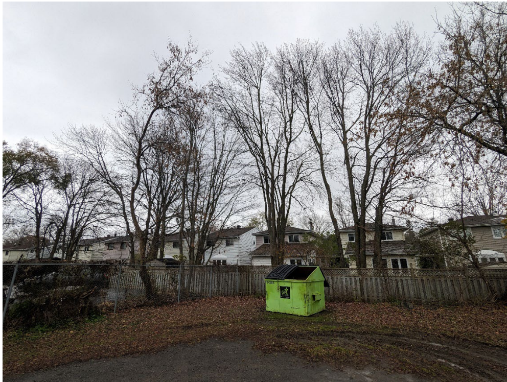
Below: East corner of the property, including Trees 2-6