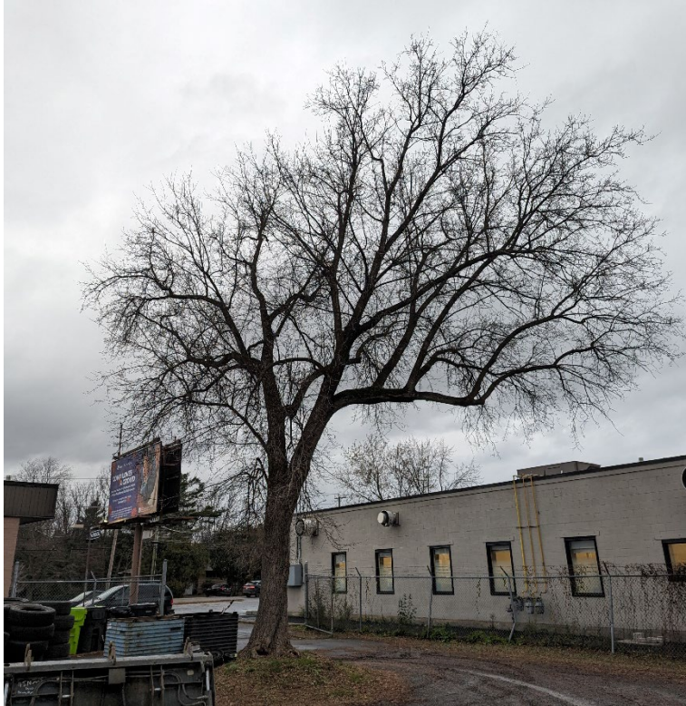
Above: Tree 1 - private manitoba maple to be removed.