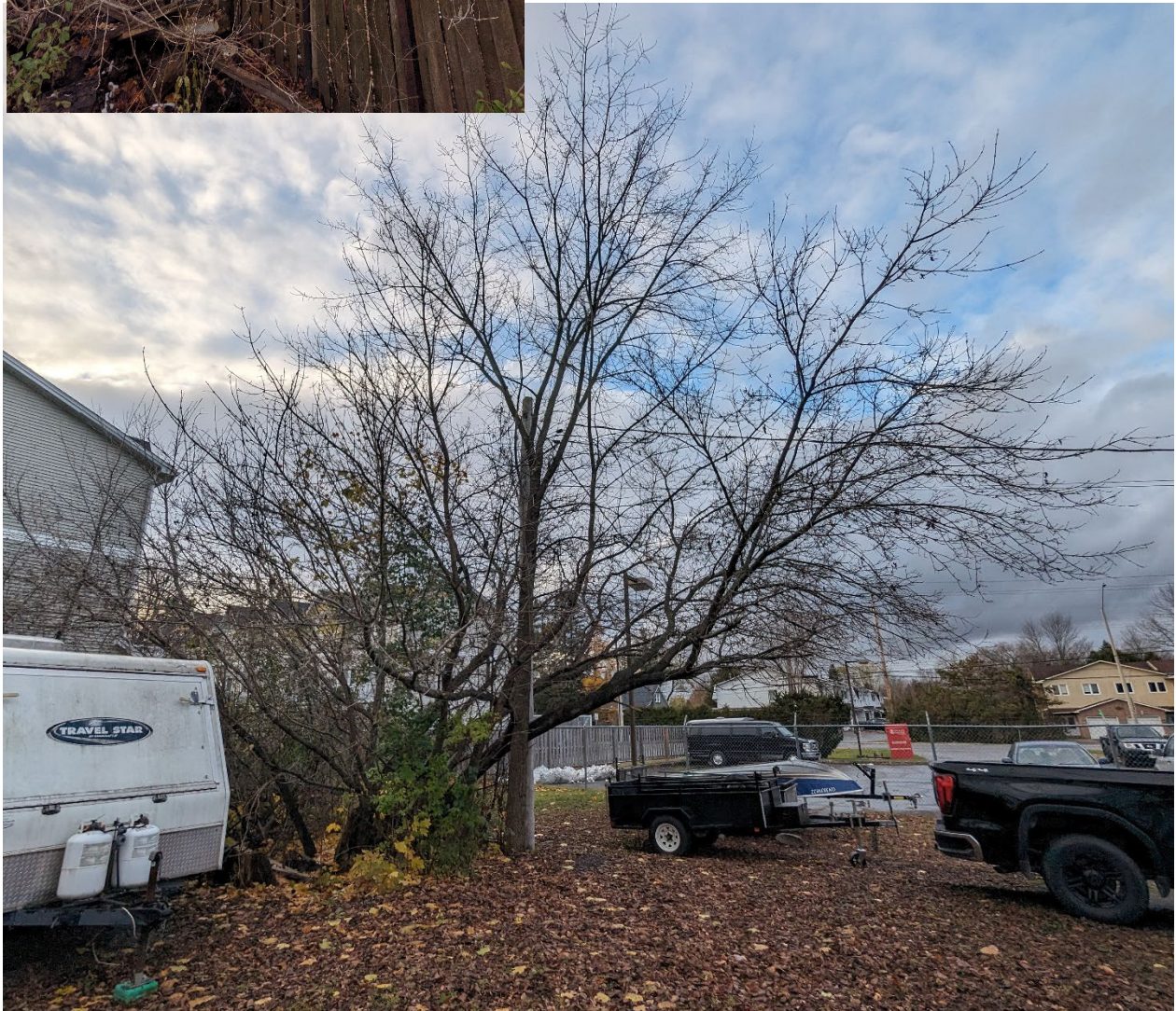
Below: Trees 34-36 - to be removed