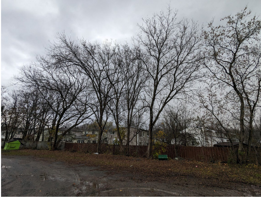
Above: Trees 4-21 along the south property line.