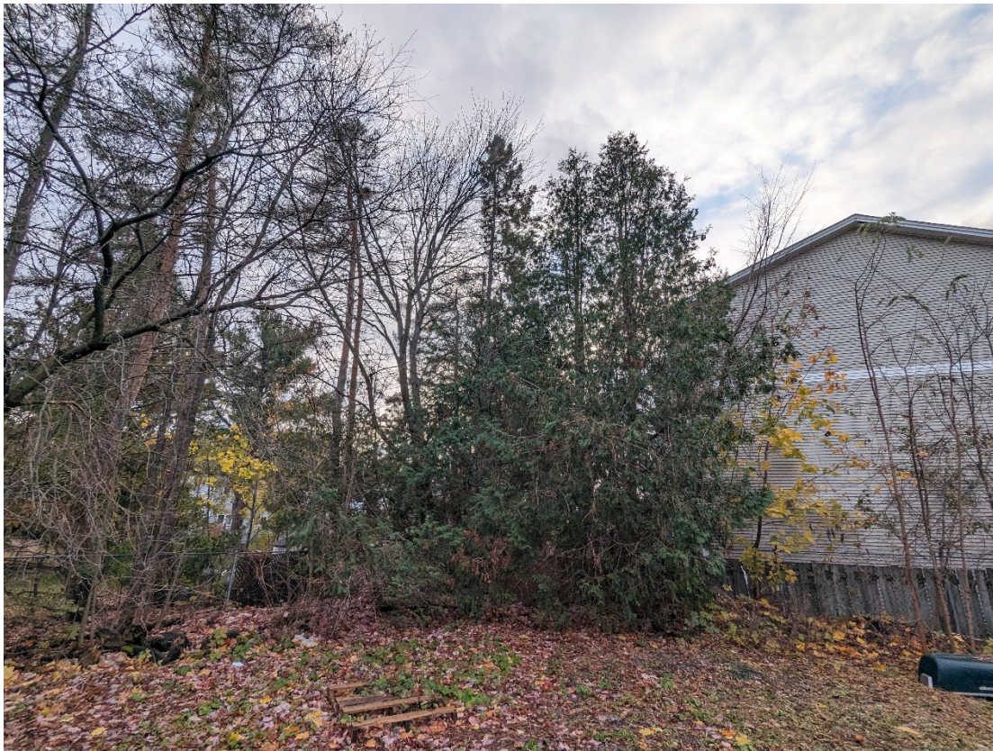
Below: southwest corner of the property, including Trees 23-33