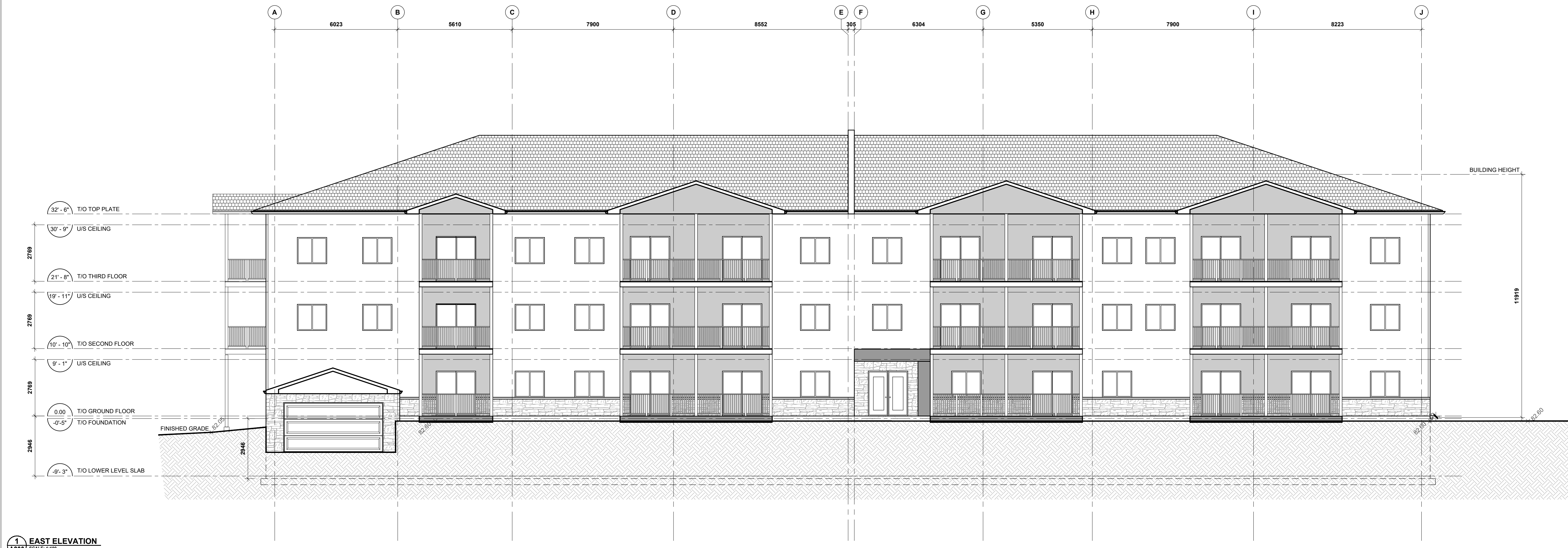
1 EAST ELEVATION SCALE: 1/160