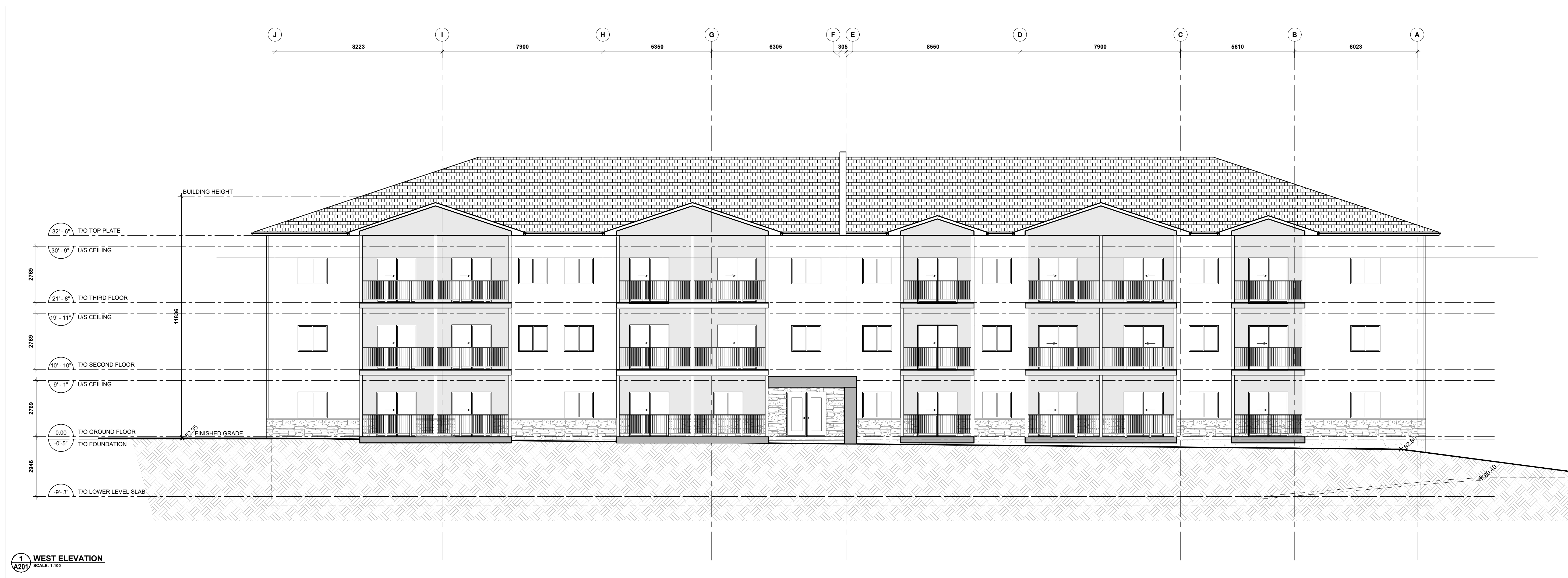
1 WEST ELEVATION SCALE: 1/8\"/>