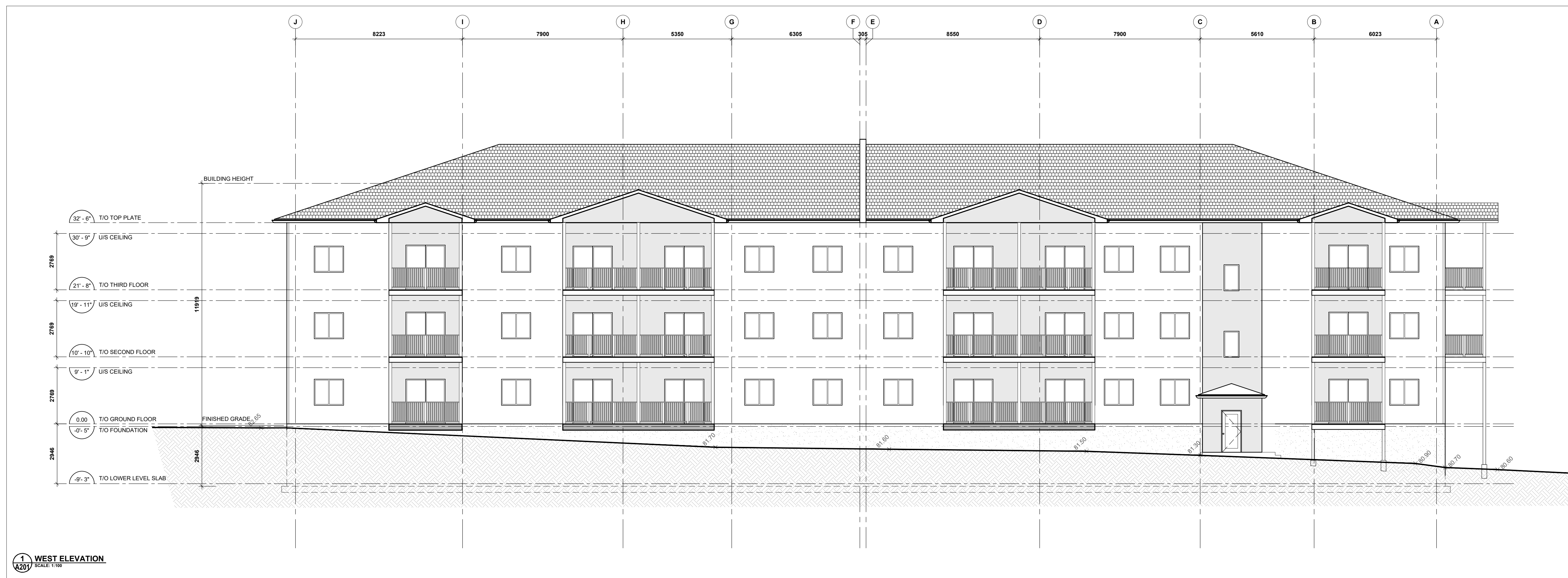
1 WEST ELEVATION SCALE: 1/160