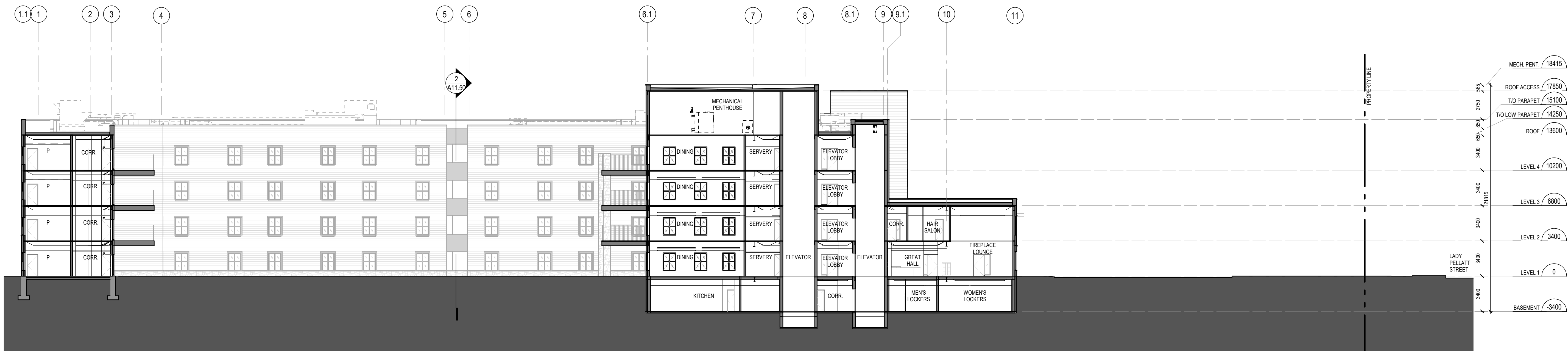
1 BUILDING SECTION EAST/WEST (SPA) A11.50 1:200

2 02.17.23 ISSUED FOR SITE PLAN APPROVAL MSA # date: revision: by: revisions