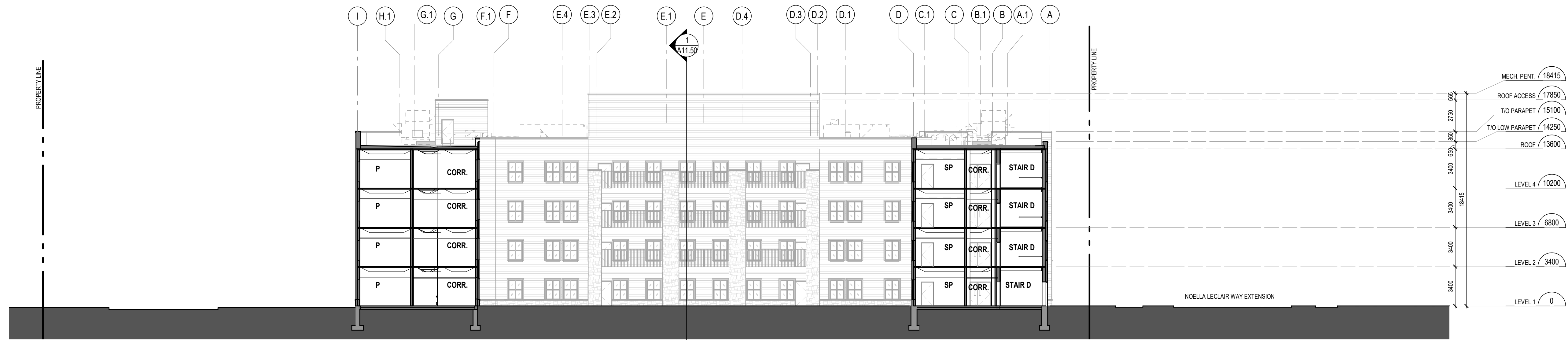
2 BUILDING SECTION NORTH/SOUTH COURTYARD (SPA) A11.50 1:200