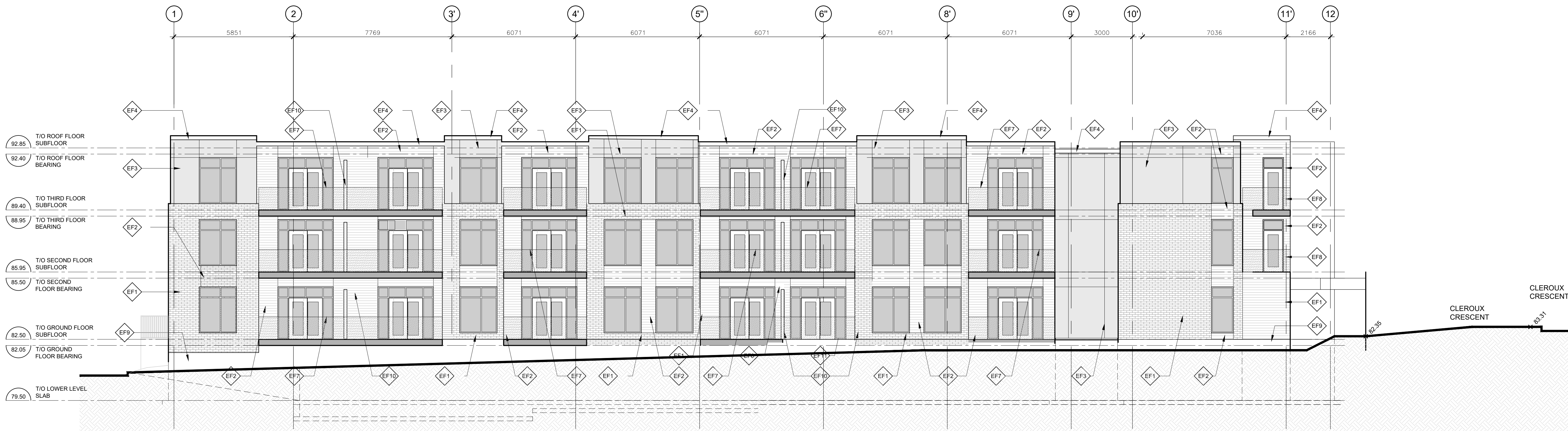
2 BLOCK B EAST ELEVATION ALONG ORIENT PARK DR. SCALE = 1 : 100