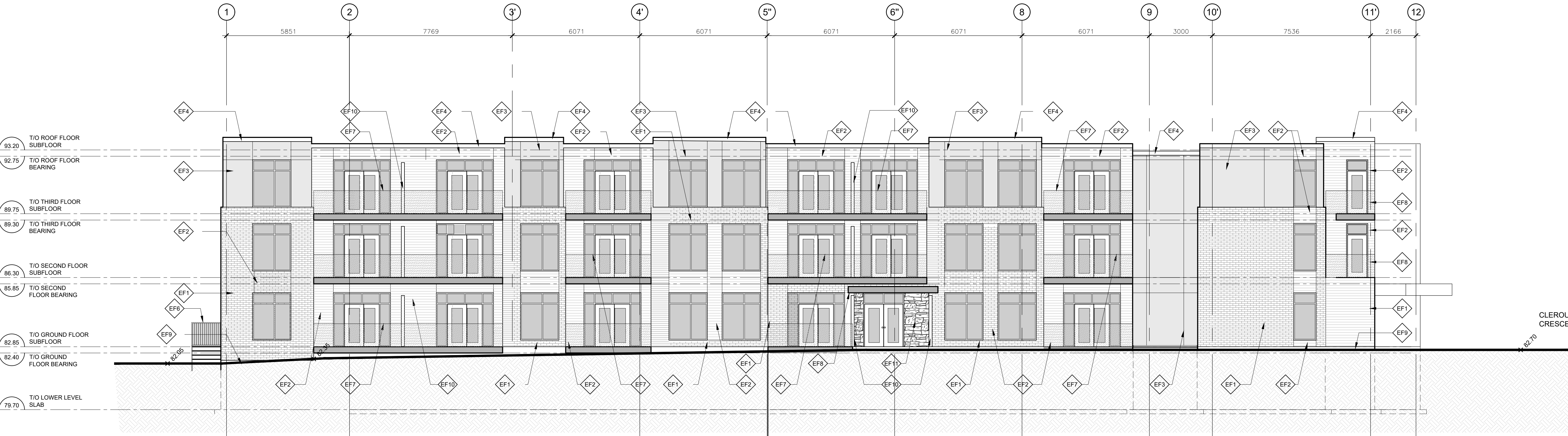
1 BLOCK_A EAST ELEVATION SCALE = 1:100