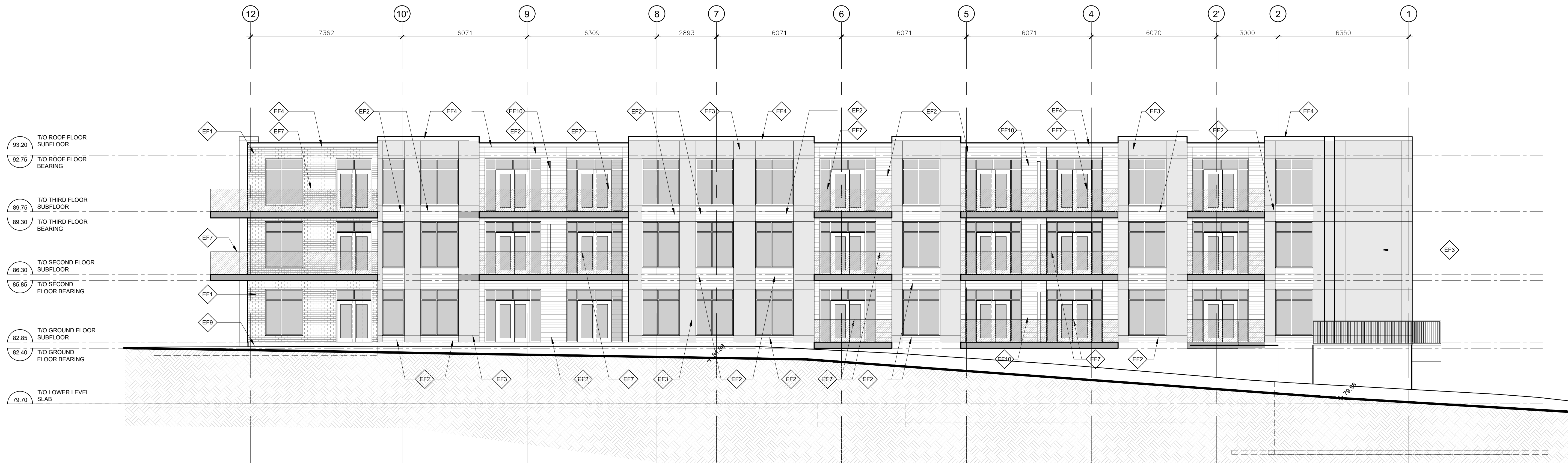
2 BLOCK A WEST ELEVATION SCALE = 1:100