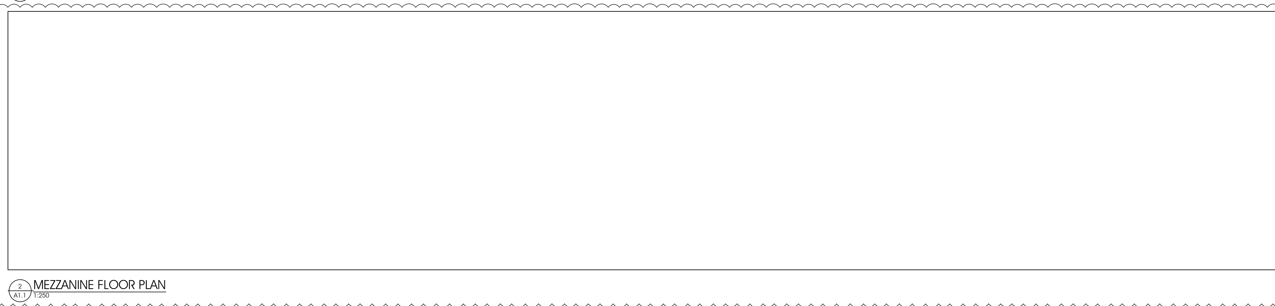
2 MEZZANINE FLOOR PLAN A1.1 1:250