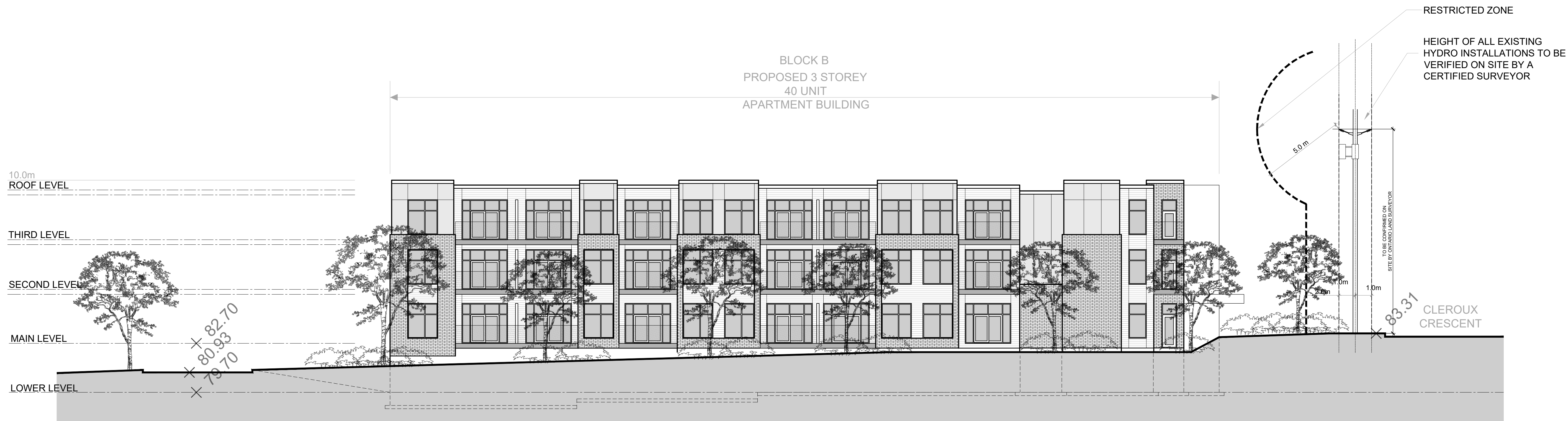
BLOCK B EAST ELEVATION ALONG ORIENT PARK DR.