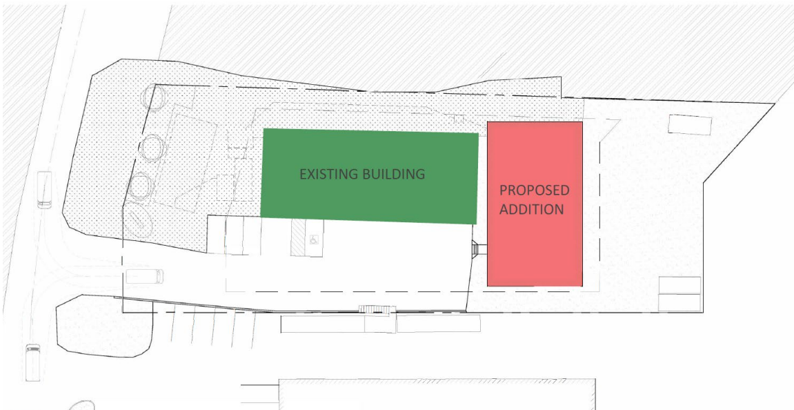
Figure 4: Sketch of the proposed addition.

The proposed addition will not compromise the surrounding area and it aligns with the existing community structure and current density.