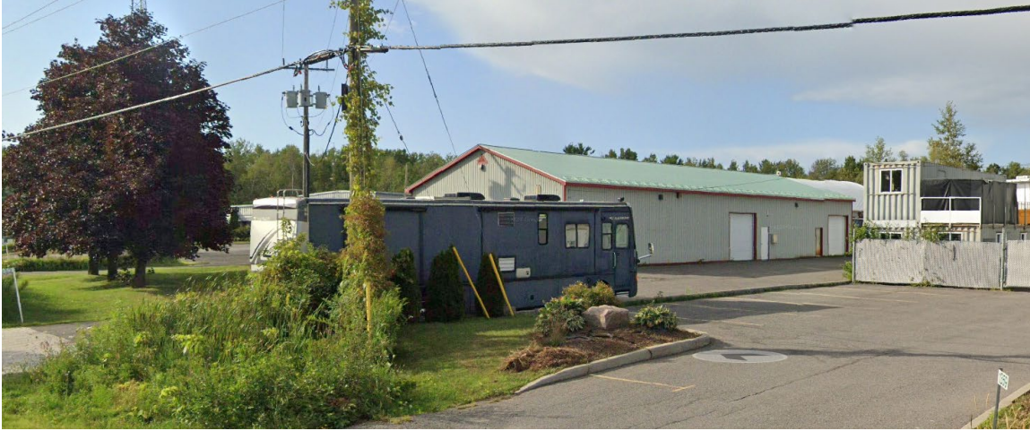
Figure 3: street view of east side of the property.