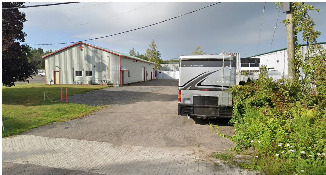
Figure 2: street view of the south side of the property.