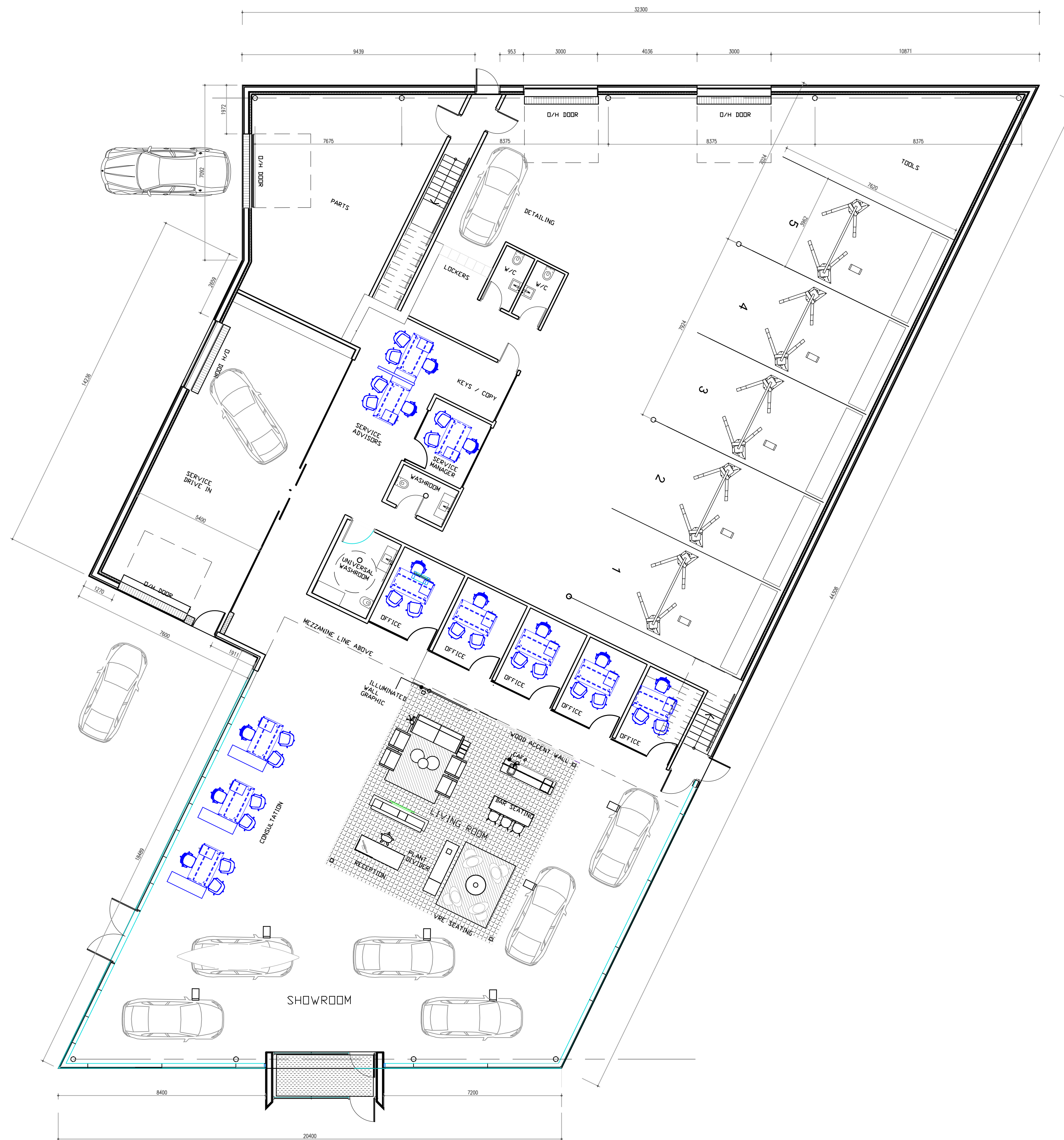
1 GROUND FLOOR PLAN A003 SCALE: 1:100