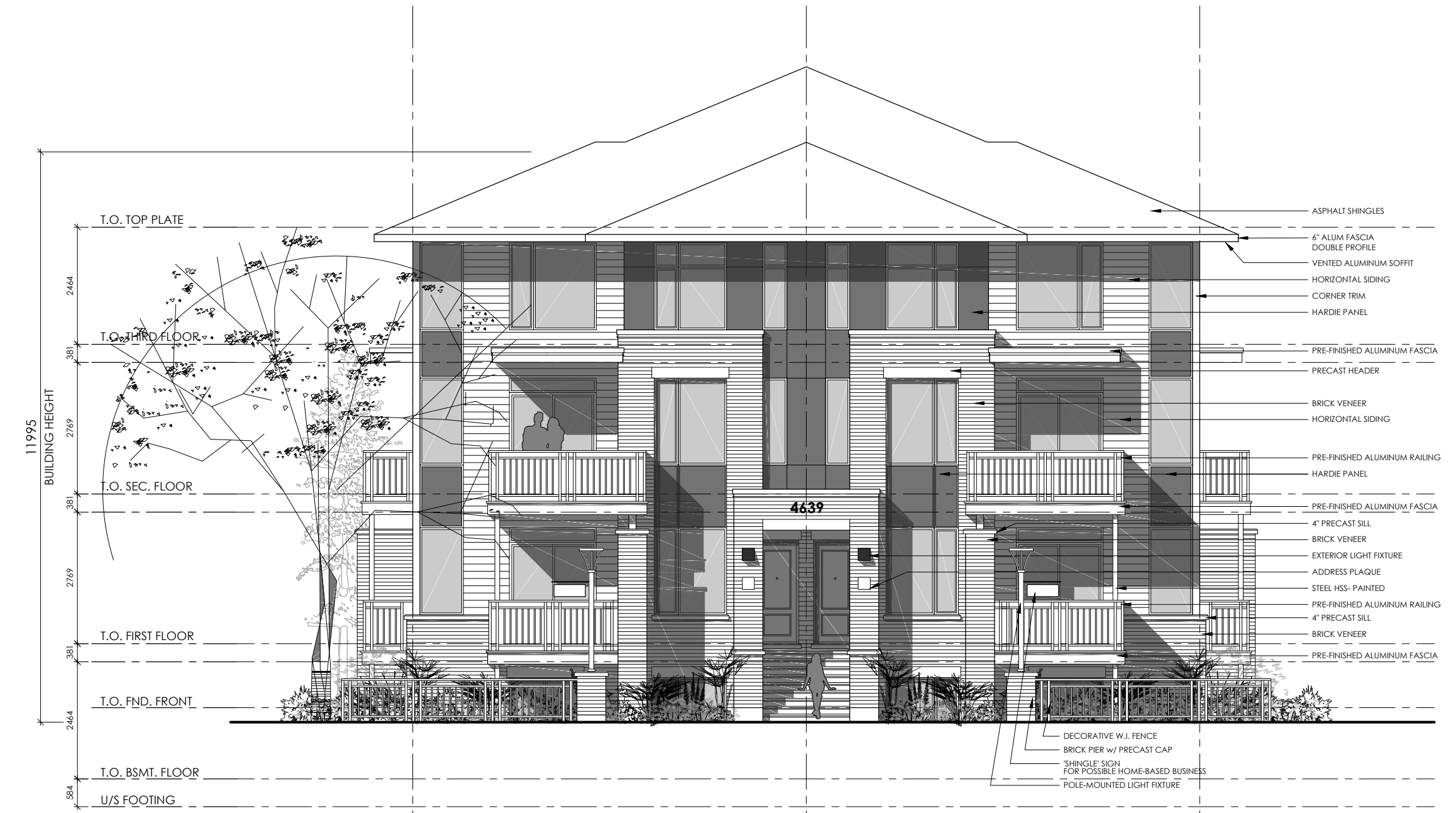
2 END ELEVATION - BANK STREET (WEST) A1 SCALE: 1:100