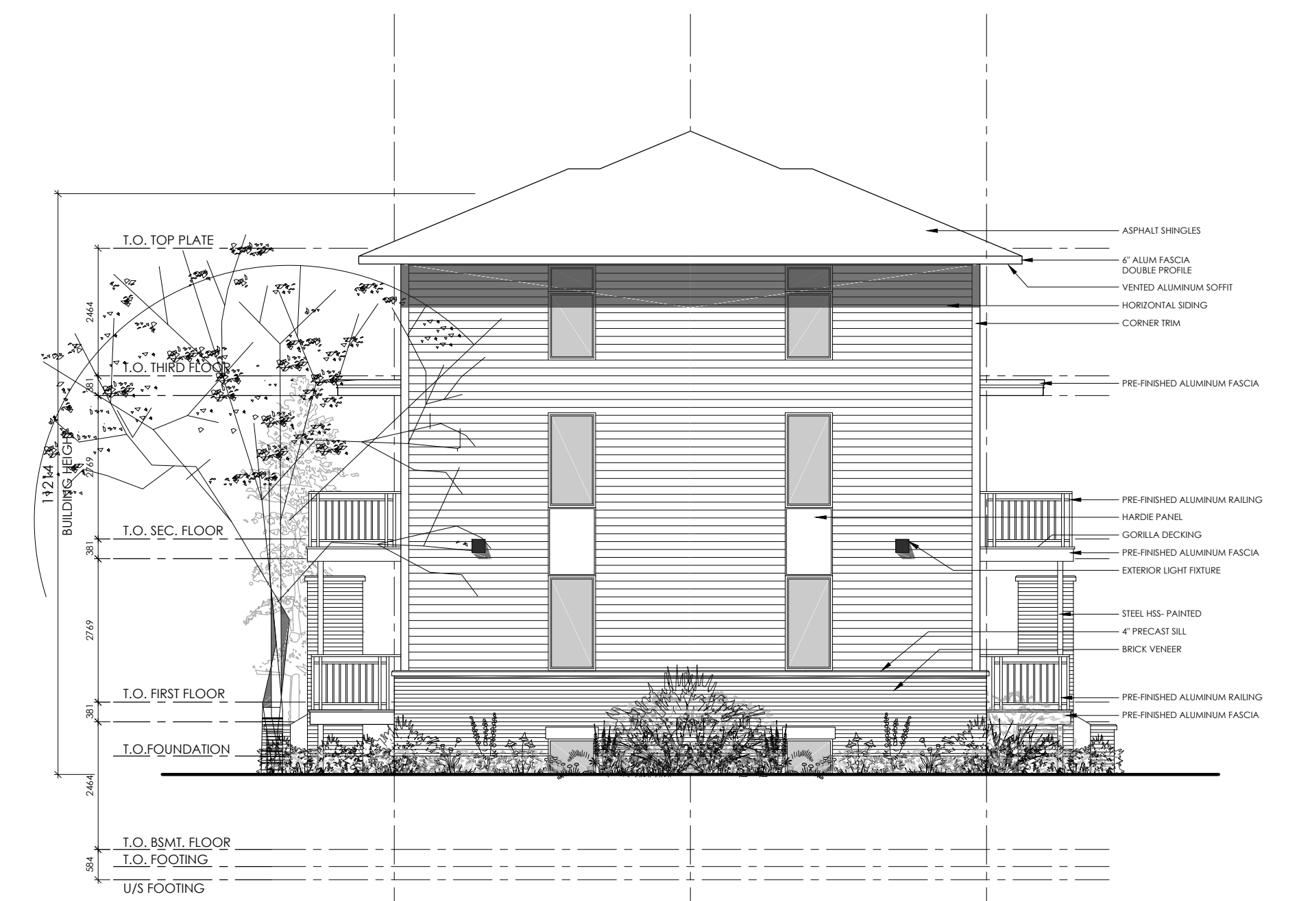
2 END ELEVATIONS (NORTH & SOUTH) A3 SCALE: 1:100