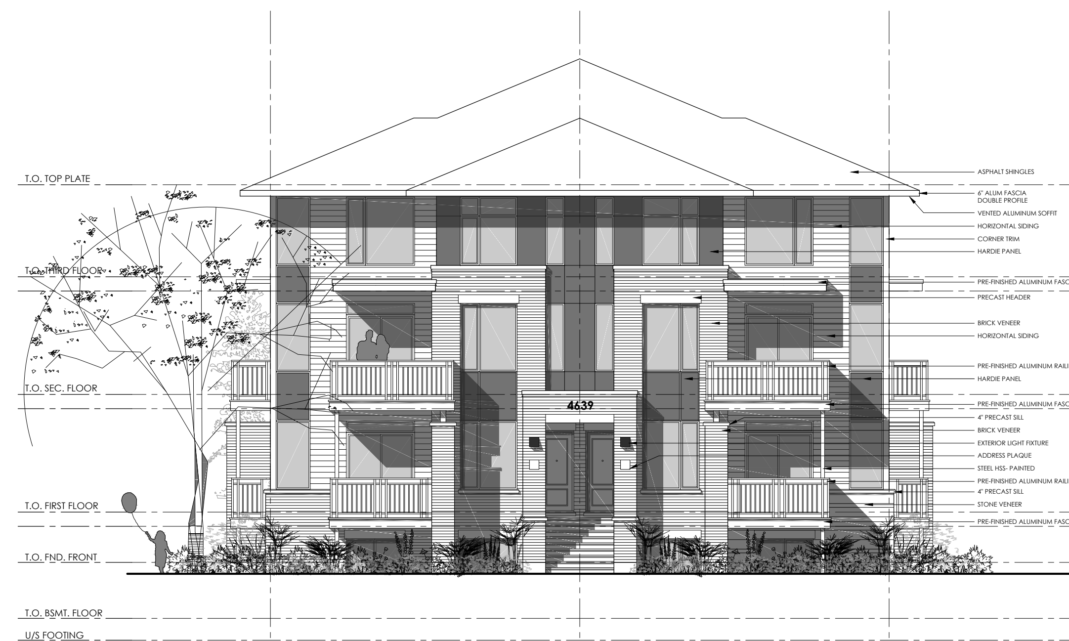
4 EXTERNAL END ELEVATIONS (NORTH & SOUTH) A2 SCALE: 1:100