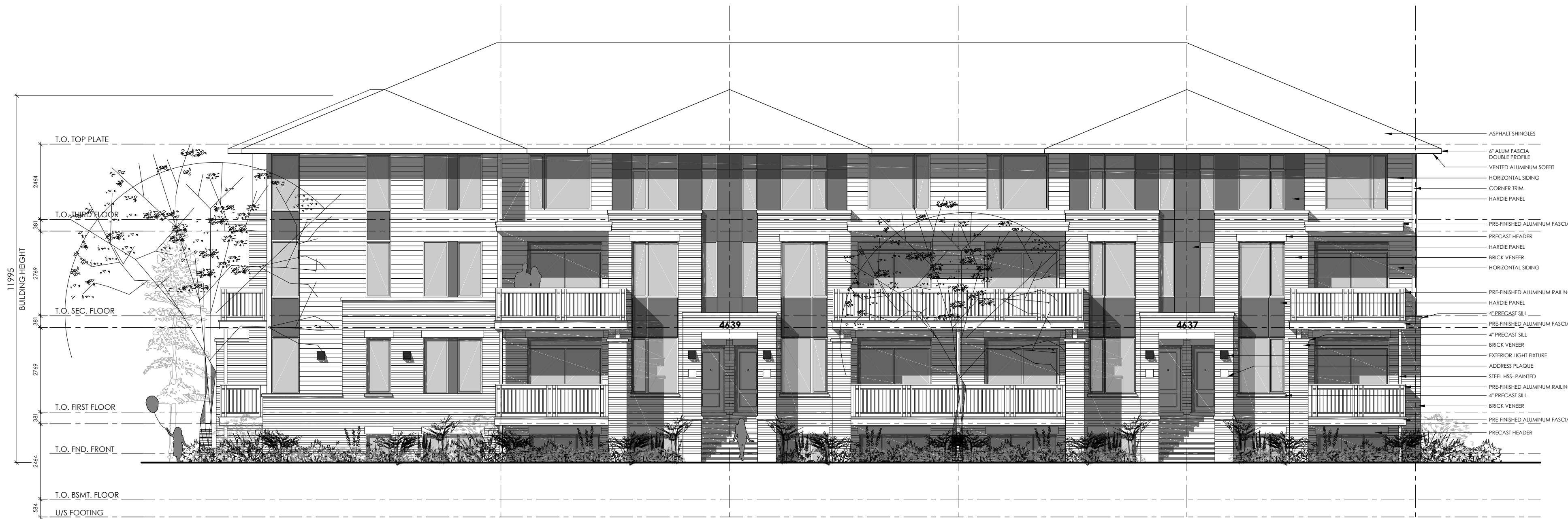
2 FRONT ELEVATIONS (EAST) A2 SCALE: 1:100