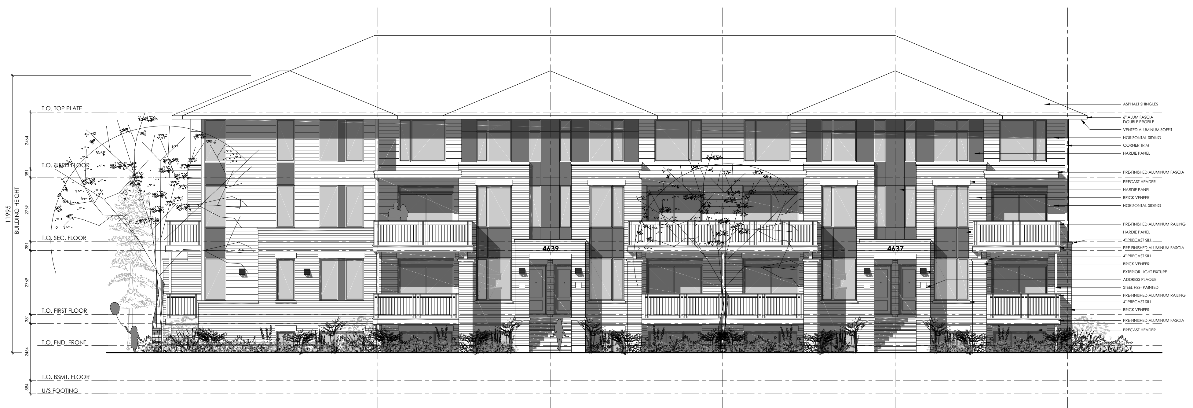
1 FRONT ELEVATIONS (NORTH & SOUTH) A1 SCALE: 1:100

APPROVED By Sean Moore at 9:19 am, Oct 20, 2021