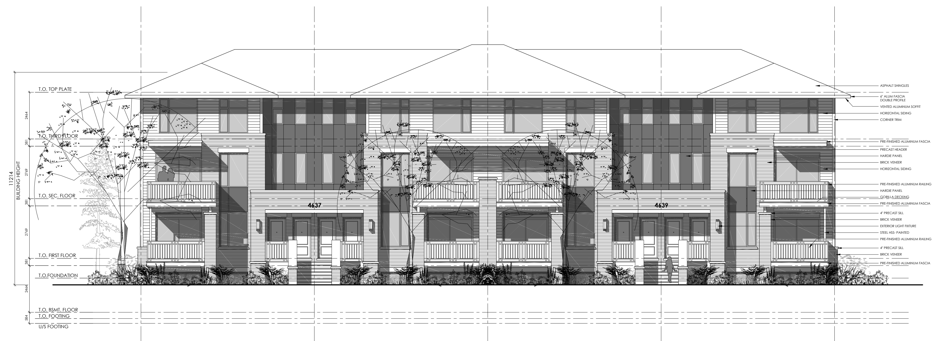
1 FRONT ELEVATIONS (EAST & WEST) A3 SCALE: 1:100

APPROVED By Sean Moore at 9:20 am, Oct 20, 2021