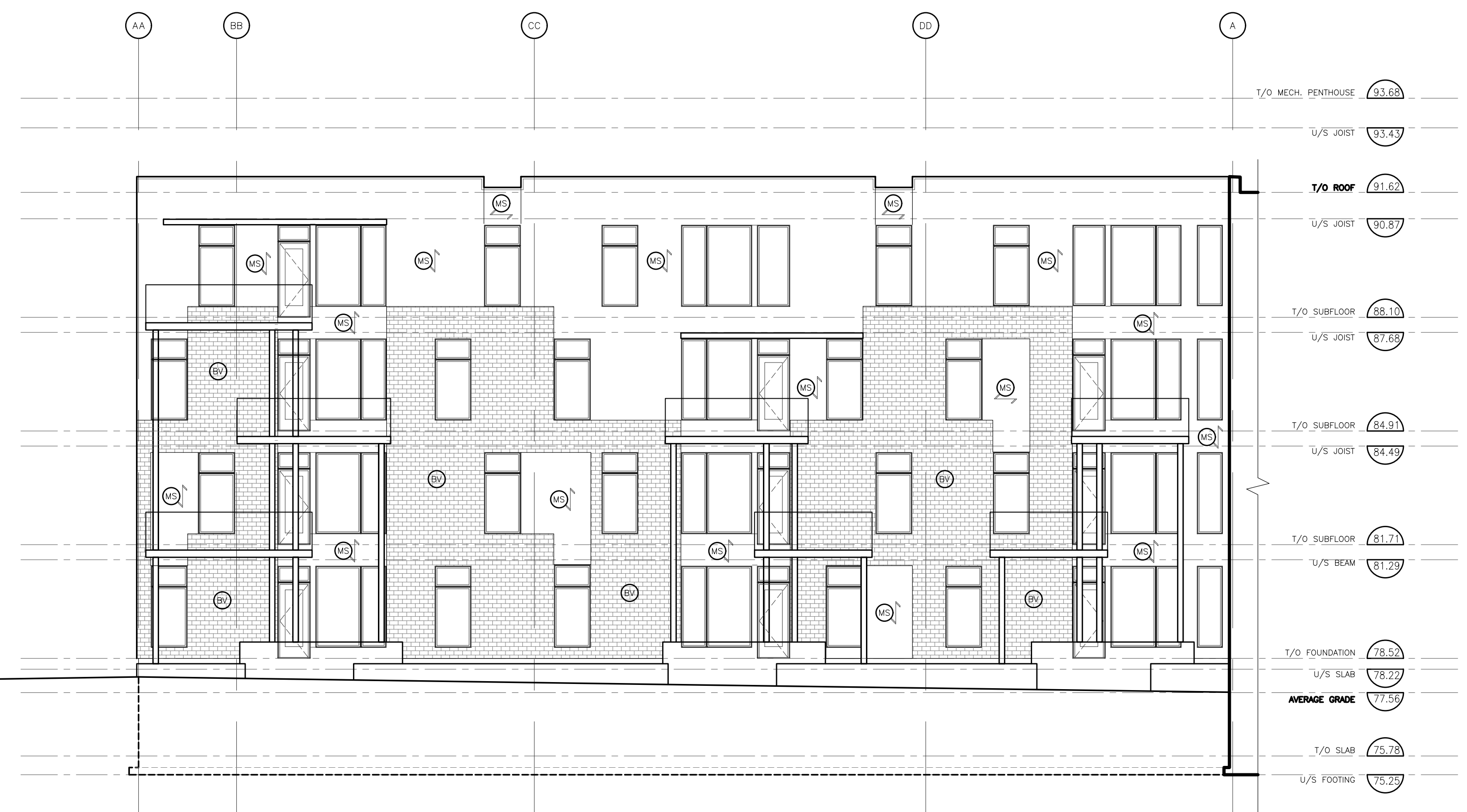
2 SOUTH ELEVATION 1 T: 100