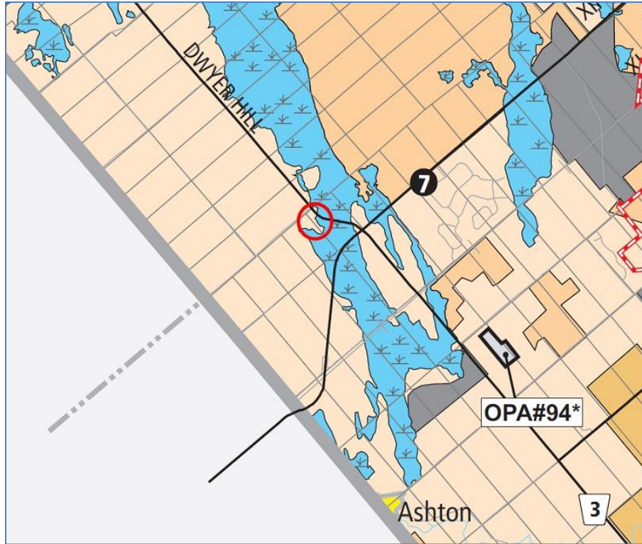
Figure 4. City of Ottawa Official Plan, Schedule A, Rural Policy Plan. Property boundary is within the red circle. Light orange represents General Rural designation, blue marks Significant Wetland.

The General Rural Area allows for a variety of development, including non-residential uses. The nature of the operation and land requirements of the Wild Bird Care Centre is most appropriate in a rural, rather than a Village or urban area.