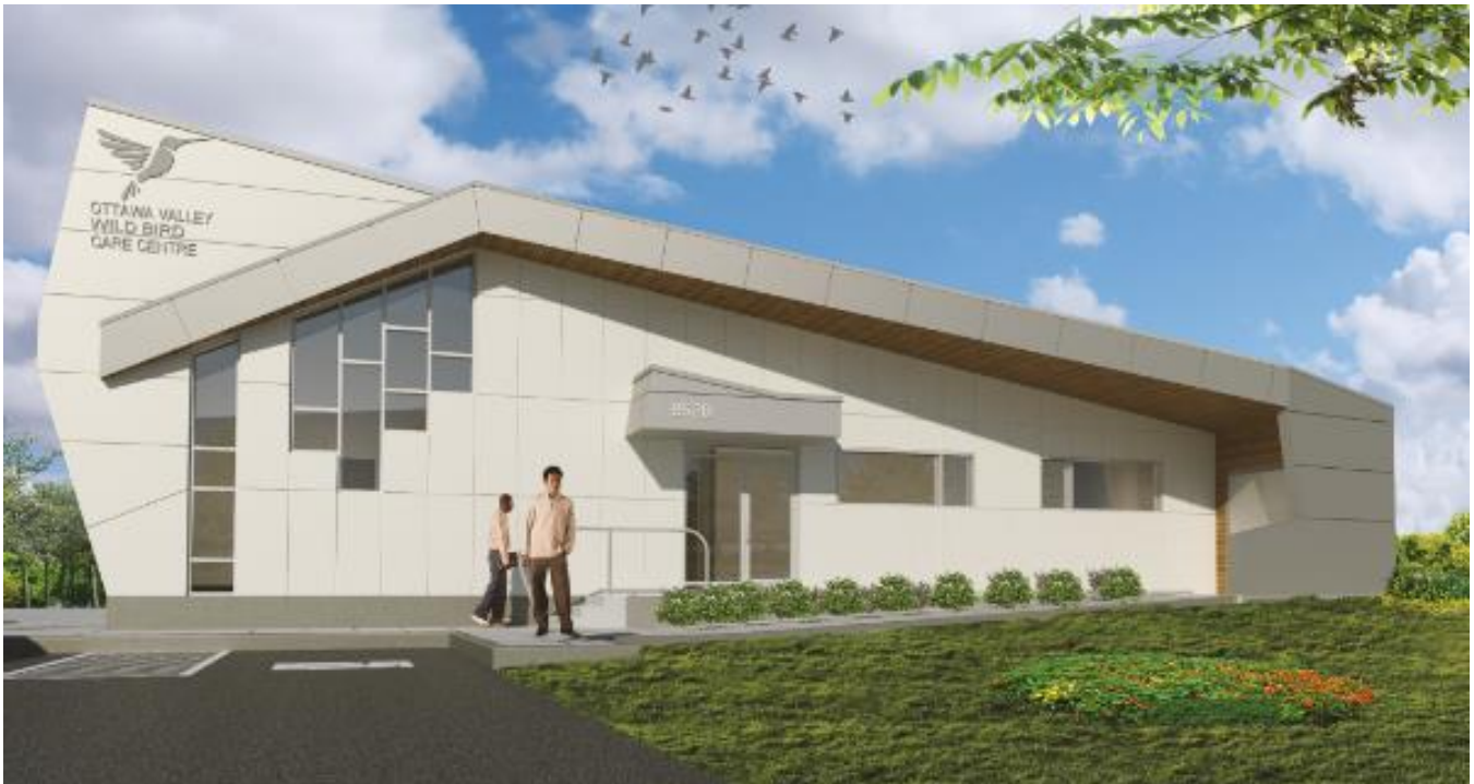
Figure 3. Proposed Wild Bird Care Centre, front view.

For planning purposes, the proposed Wild Bird Care Centre is considered to fall under the use of 'animal hospital' as defined in the City of Ottawa's Official Zoning Bylaw (Ottawa Letter 19 July 2018, Appendix 2). A 25-space parking lot is planned to the north east of the main building. A well is planned to the north west of the building, and a septic tank and leaching bed is planned to the east of the building. A waterfowl pond is planned to the west of the building and may serve as a reservoir for fire suppression purposes.