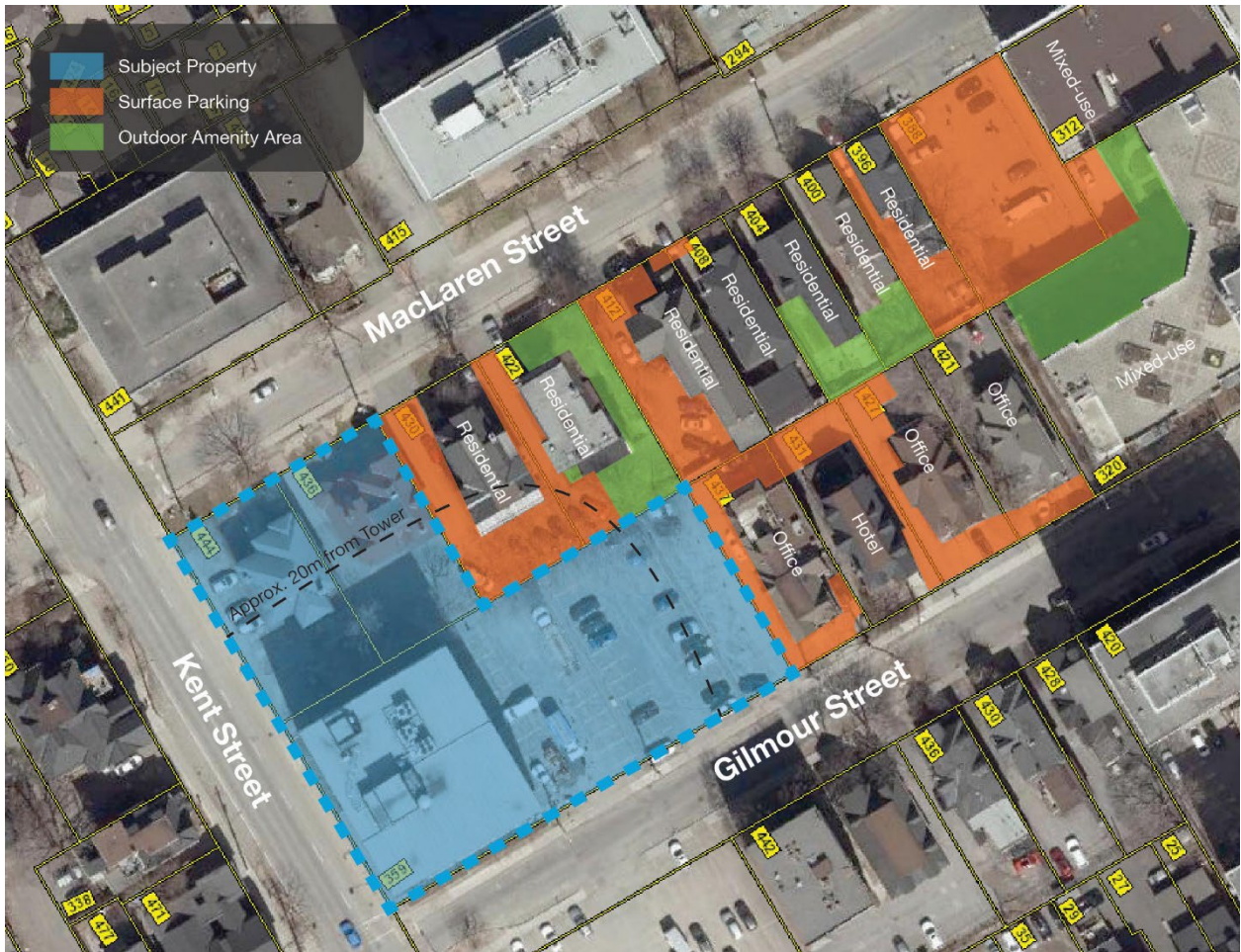
Figure 3: Surface Parking and Amenity Areas Adjacent to the Subject Property

4.6.6.2 states that transition between high-rise buildings and adjacent properties designated as Neighbourhood will be achieved by providing a gradual change in height and massing through the stepping down of buildings, setbacks from the low-rise properties, generally guided by the application of an angular plane.