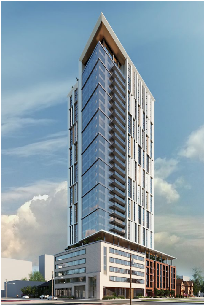
Figure 1. Previous Submission

More planting has been introduced in the POPS and along Kent, adjacent to 444 MacLaren Street.