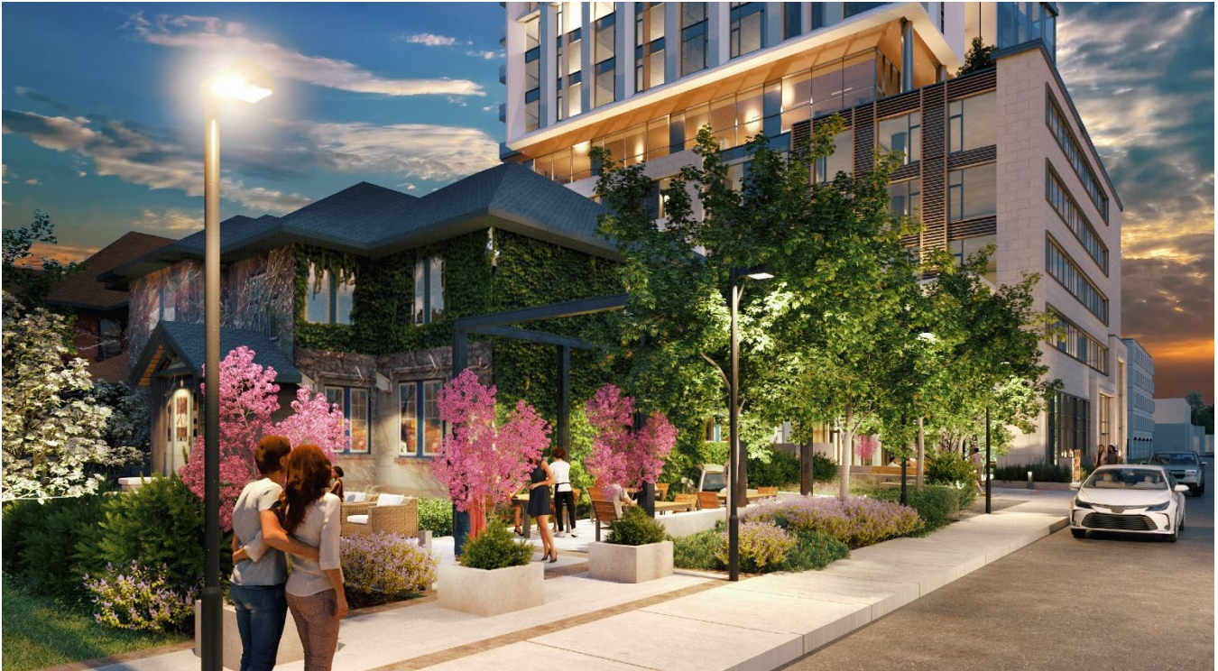
Figure 2: View of Proposed Development from Kent/MacLaren

Several comments were received regarding the desire for tree planting and greening the site. Street trees are proposed within structured soils along Gilmour adjacent to the new podium and significant tree planting and landscaping is proposed between the new tower and 444 MacLaren Street to mark the arrival space and “outdoor foyer” of the proposed building. The existing asphalt areas around 436 and 444 MacLaren Street have been reduced and removed to the extent possible to improve the public realm adjacent to the subject property.