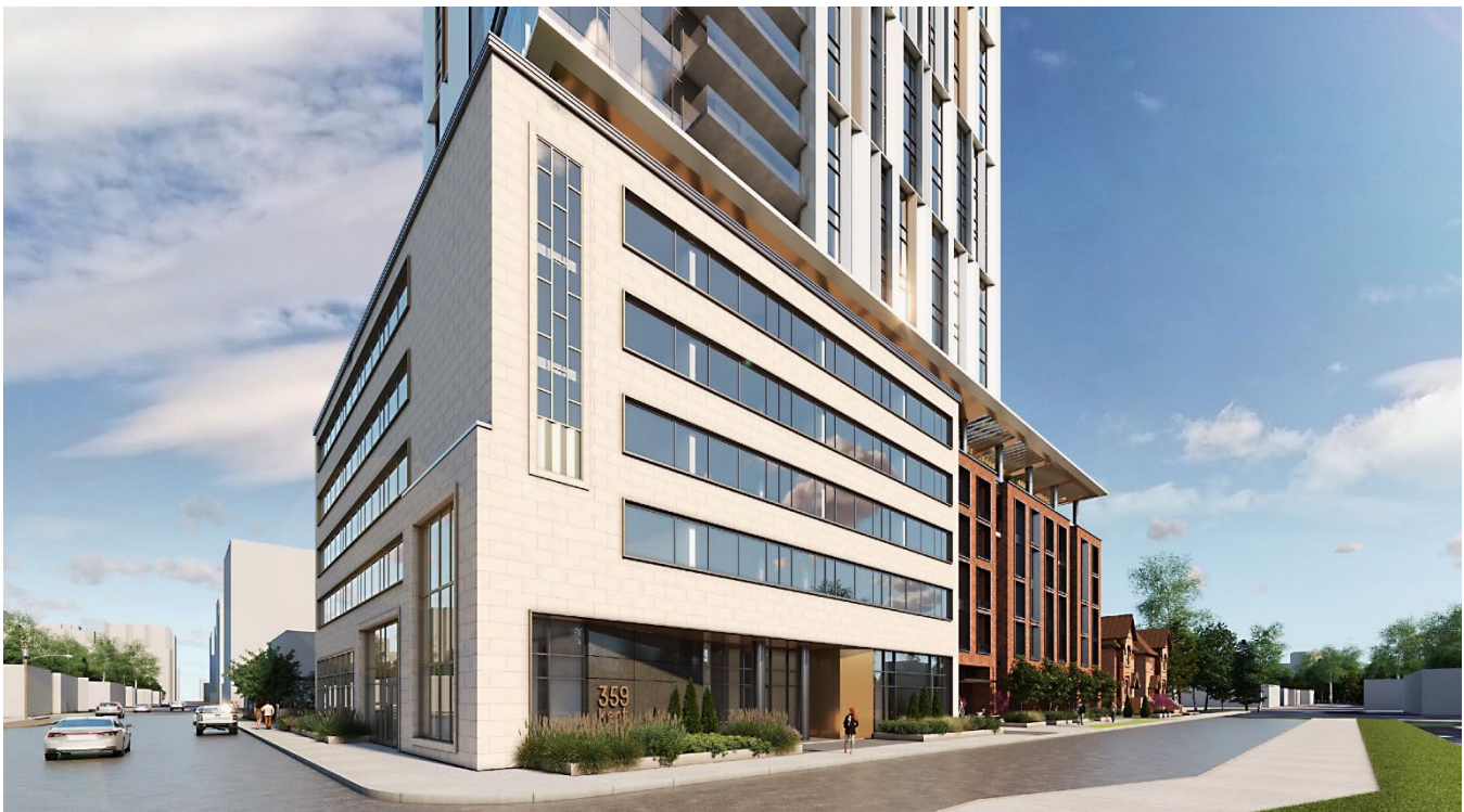
Figure 1: View of the Proposed Development and Retained Heritage Facade from Kent/Gilmour

The biggest change to the design has been the retention and integration of the Legion House facade into the revised development. The Legion House was identified by the City as an important building within the Centretown Heritage Conservation District and through investigation and research, the intention is to document and store the limestone cladding from the existing south and west facades to be used in cladding the podium of the new building. The facade will be reconstructed in the same place as it sits today, and will form the five (5) storey podium of the new building.