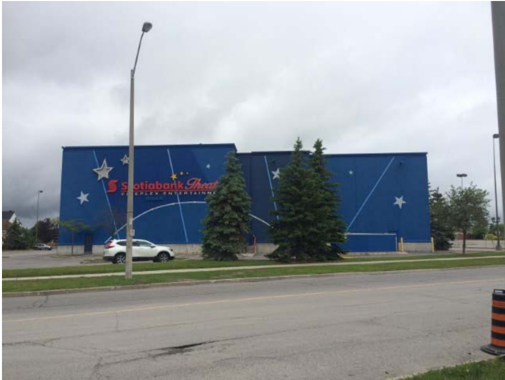
Photo 17: View of Scotiabank Silver City Theatre, north of site, facing north.