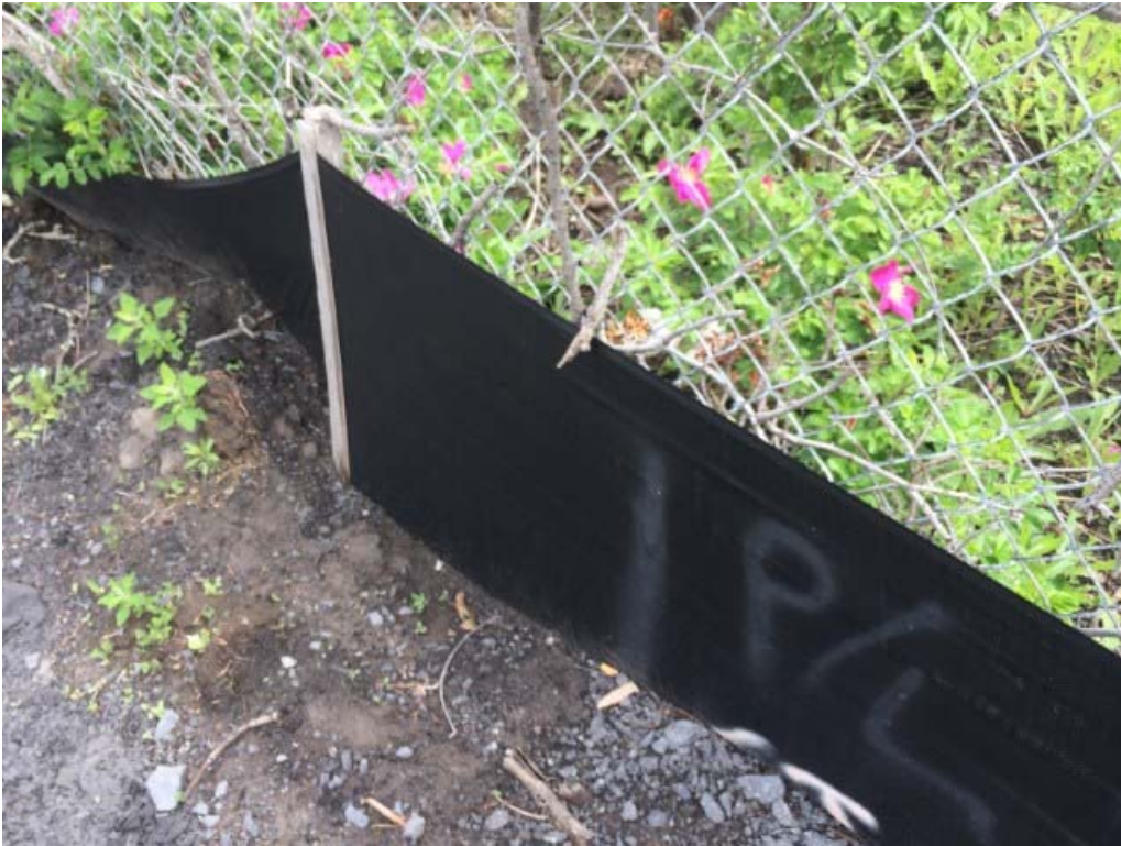
Photo 11: View of on-site silt fence, along eastern boundary of construction area.