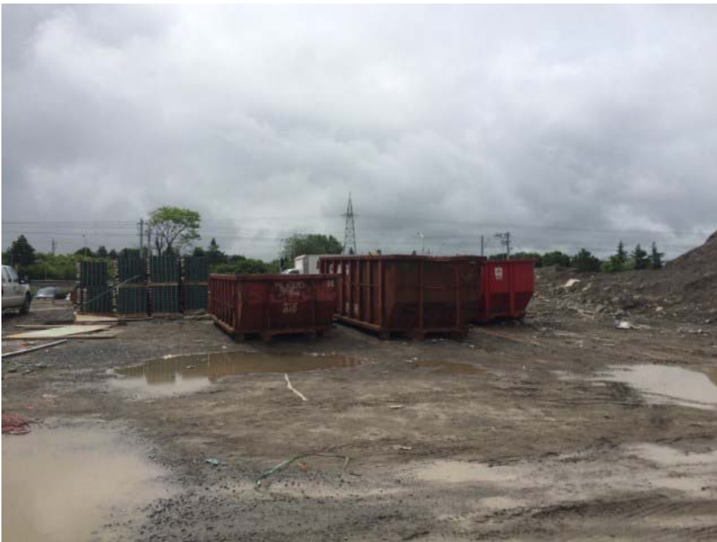
Photo 8: View of garbage receptacles, central portion of site, facing south.