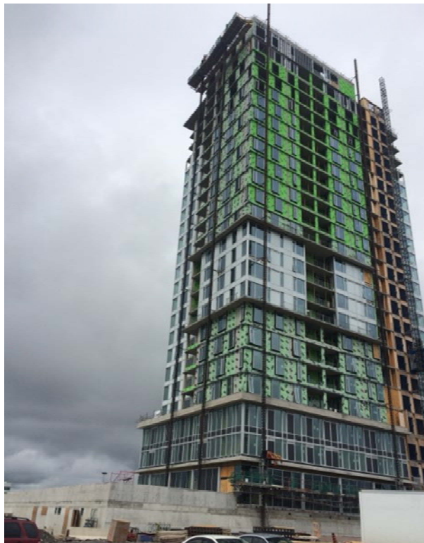
Photo 2: View of residential building under development, facing northwest.