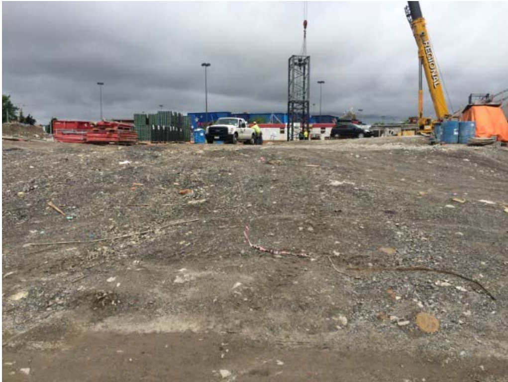
Photo 9: View of construction staging area and stockpiled excavated material (will be used as fill to level parking area around new construction building).