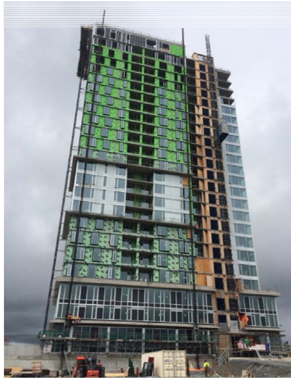
Photo 3: View of residential building under development, facing west.