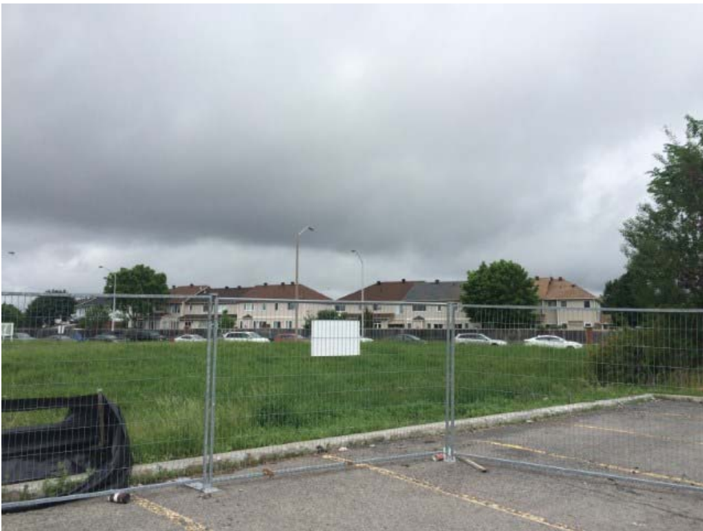
Photo 16: View of residential development northwest of site, facing northwest.