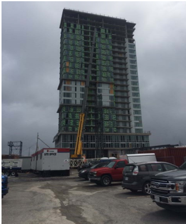
Photo 1: View of residential building under development, facing east.