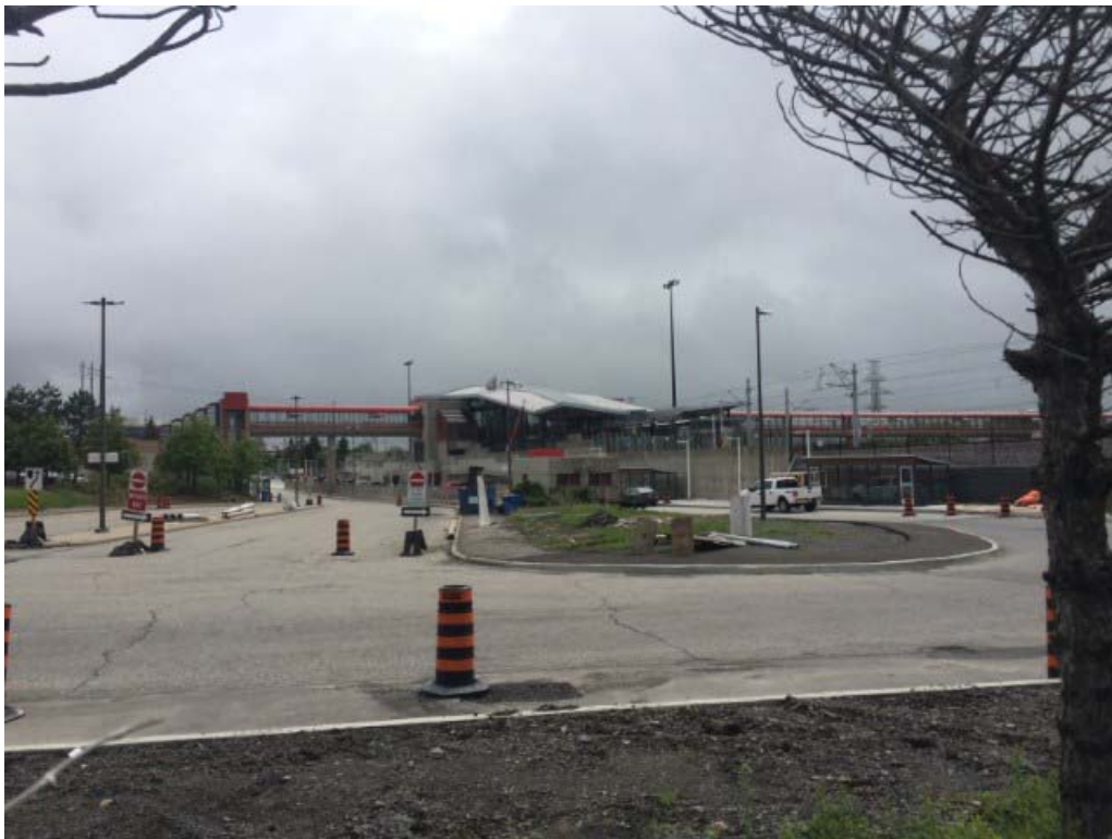
Photo 14: View of Blair LRT station under construction, facing east.