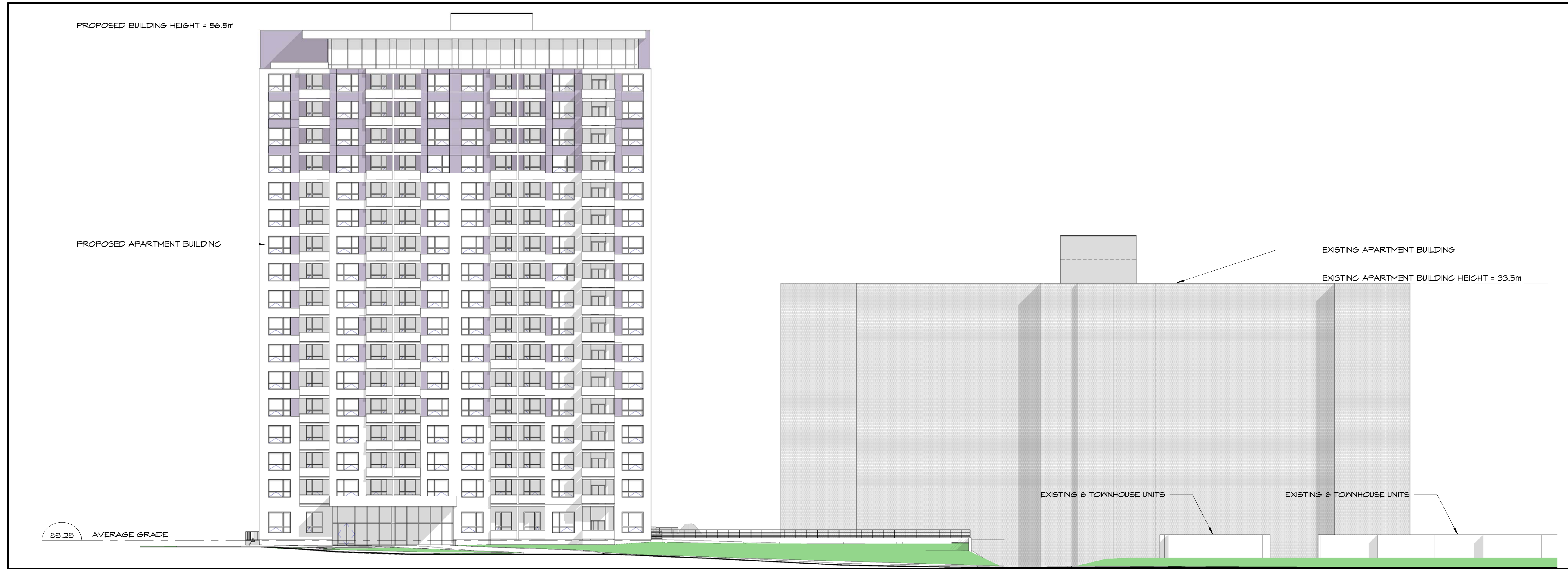
2 SITE SECTION - WEST-EAST A5 SCALE: 1:250

Client: LS GP Inc. 2193 Arch Street, Ottawa, Ontario.