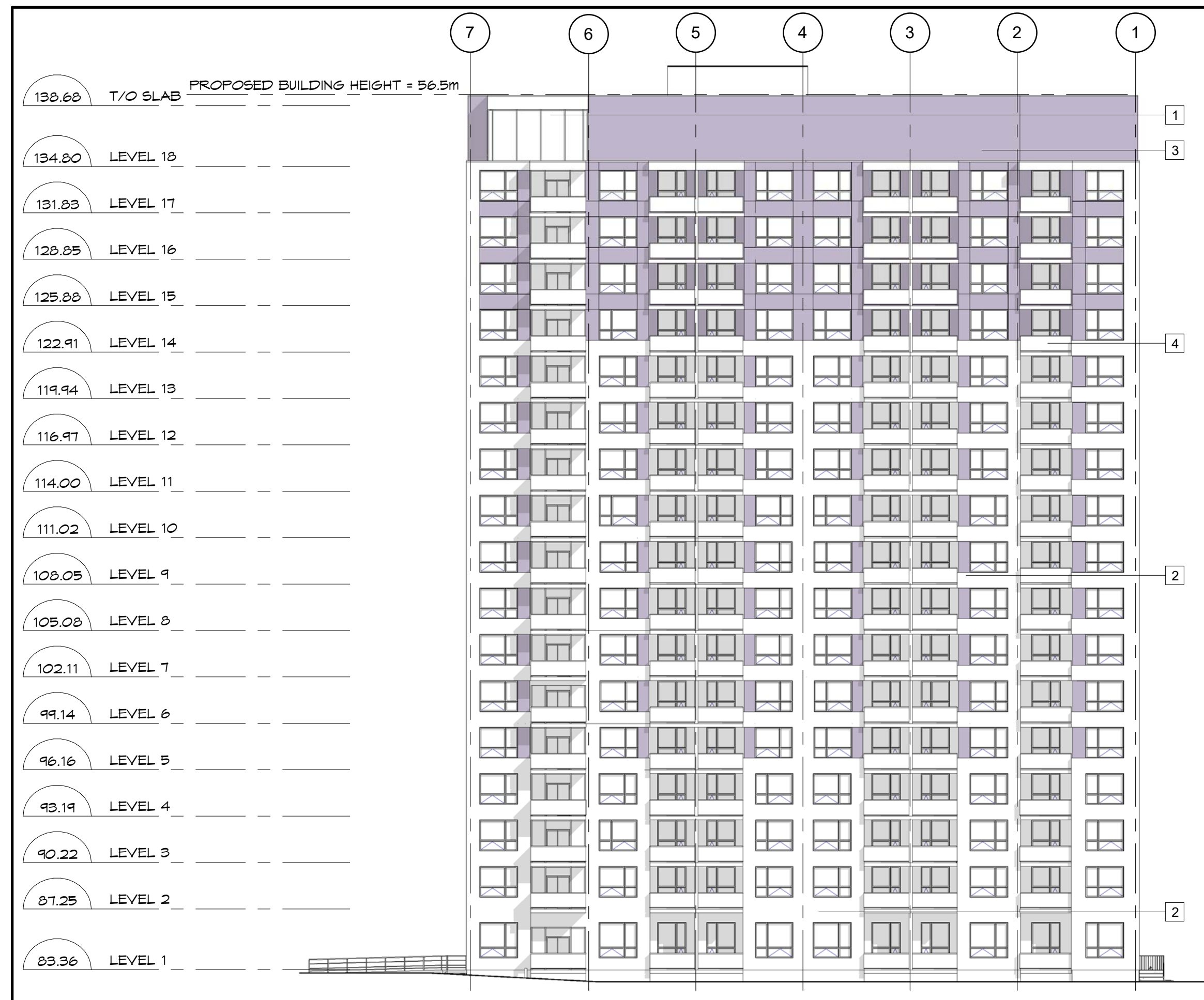
4 NORTH A4 SCALE: 1 : 250