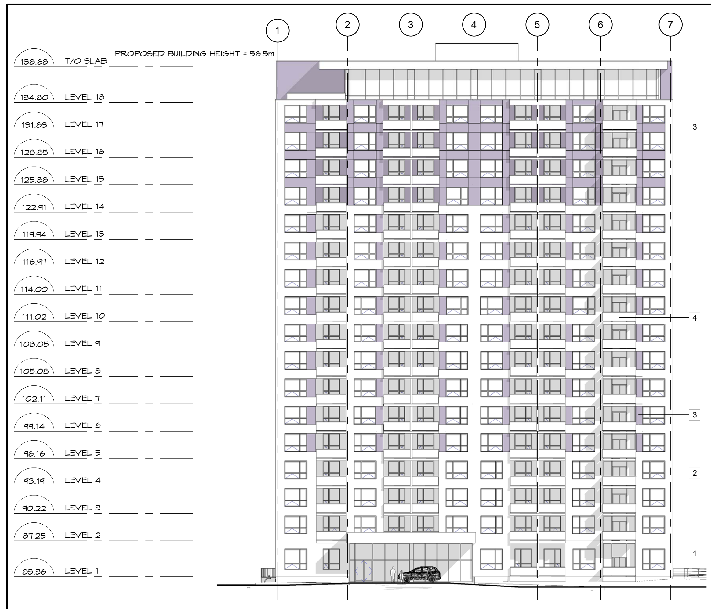
1 SOUTH A4 SCALE: 1 : 250