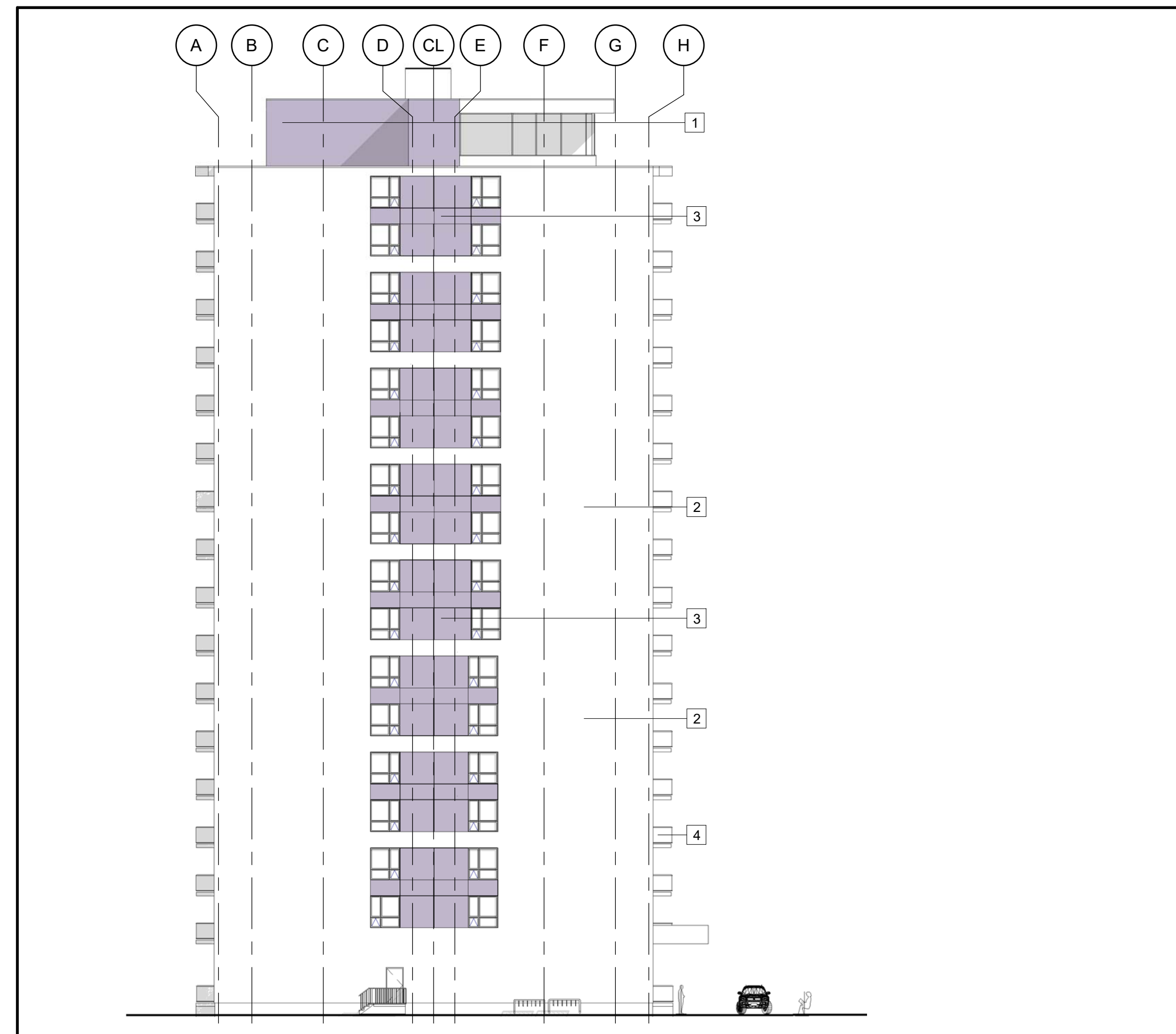
3 WEST A4 SCALE: 1 : 250