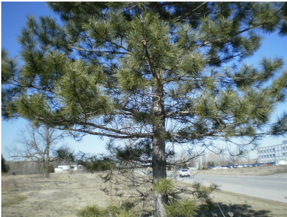
Photo 4 – Planted Austrian pine along the south side of Bill Leathem Drive. View looking west