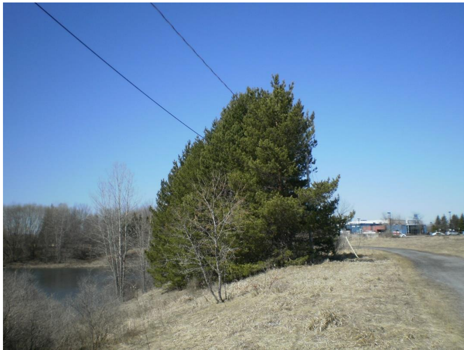
Photo 6 – White spruce along the north slope from the Clarke Bellinger Environmental Facility. View looking west, with the gravel access road on the right and the facility on the left (south)