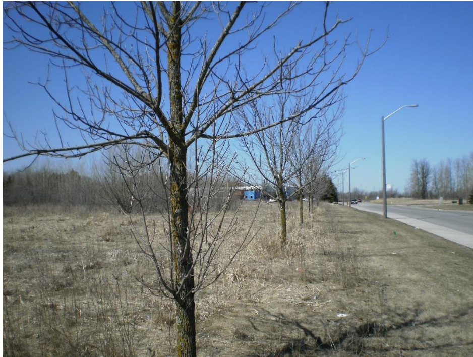
Photo 5 – Planted ash and maple along the south side of Bill Leatham Drive. View looking west