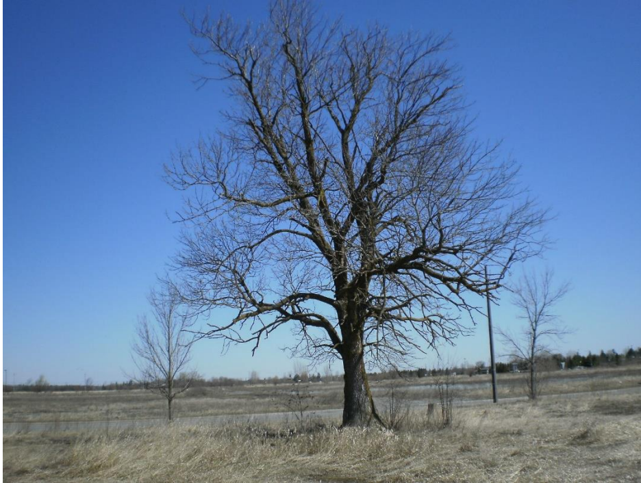
Photo 3 – Mature white ash in the he north-central portion of the site. View looking north, with Bill Leathem Drive in the background.