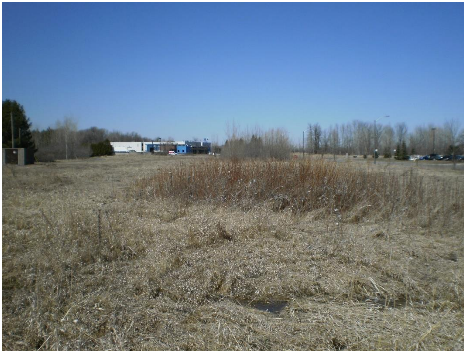
Photo 2 – Central and west portions of the overall site. View looking west from the central-east portion of the site