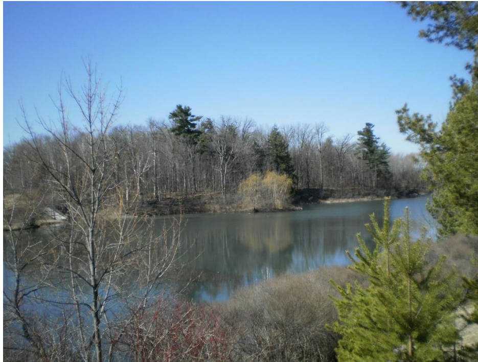
Photo 7 – The Clarke Bellinger Environmental Facility looking south from the gravel access road with the mature deciduous and coniferous trees in the Sach’s Forest Urban Natural Feature in the background on the south side of the facility