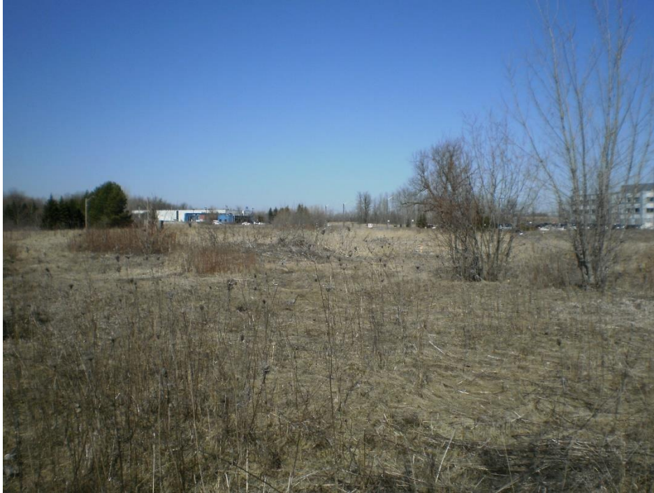
Photo 1 – East portion of the site, including the lands proposed for development. View looking west from west side of Leikin Drive