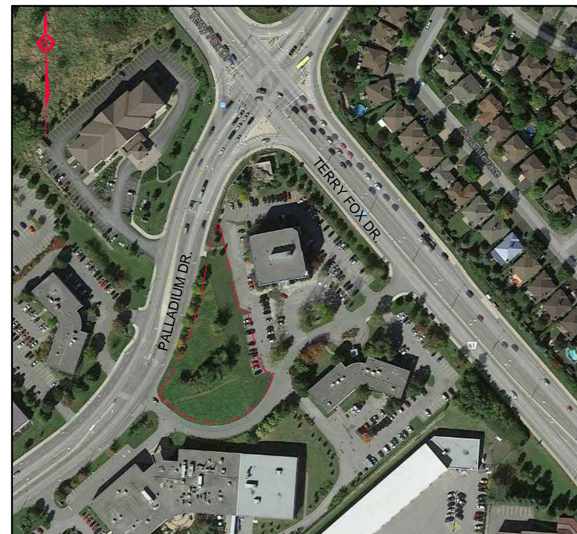
LOCATION MAP N.T.S.