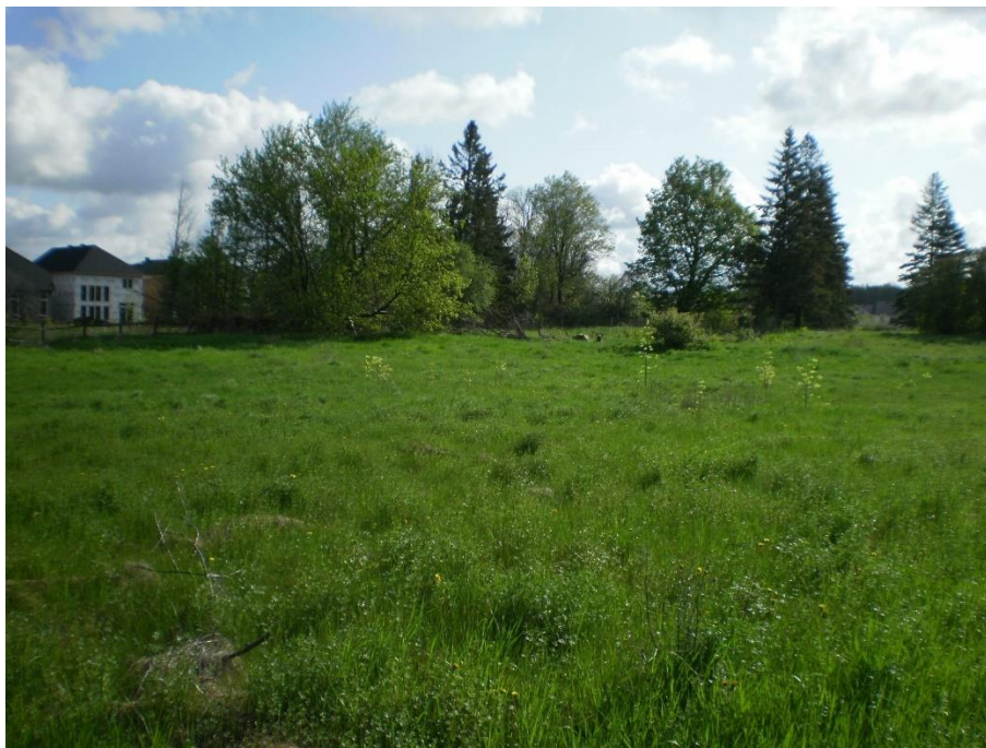
Photo 12 – Small remnant cultural meadow habitat in the southeast corner of the site. View looking northeast