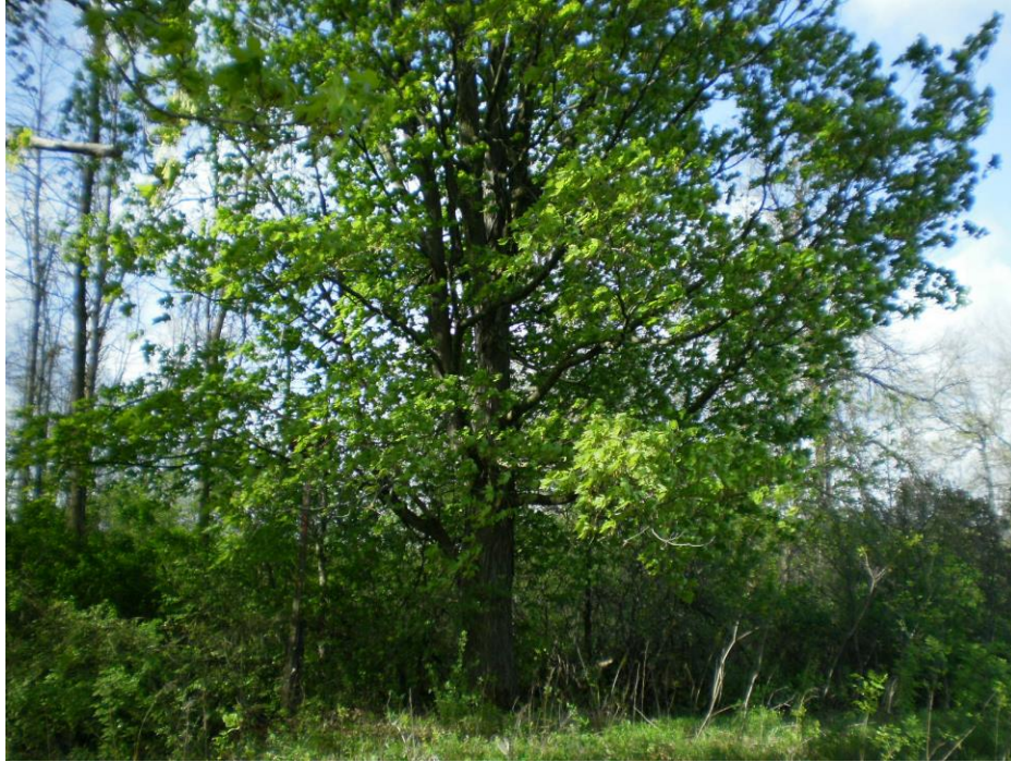
Photo 13 – Mature sugar maple in the southeast corner of the site. View looking northeast