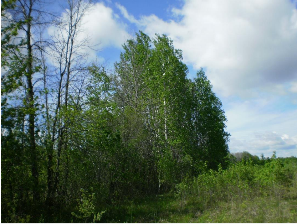
Photo 5 – East-west deciduous hedgerow in the northwest portion of the site. View looking west