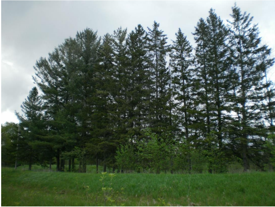
Photo 7 – East-west coniferous hedgerow in the southeast portion of the site. View looking southeast