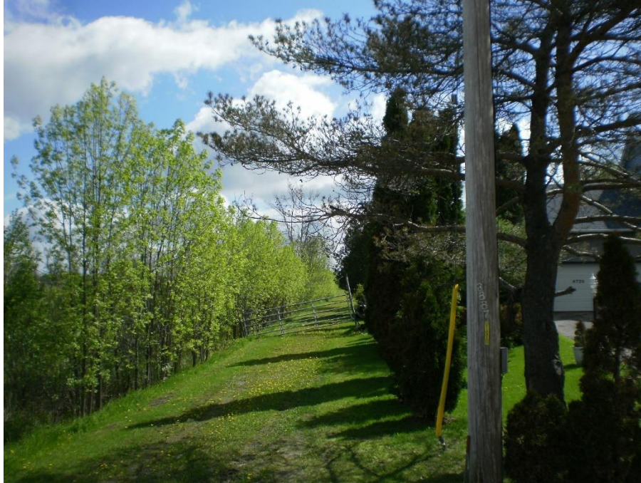
Photo 11 – Small white cedars and overhanging Scot's pine branches along the north edge of 4729 Spratt Road, east of Spratt Road. View looking east