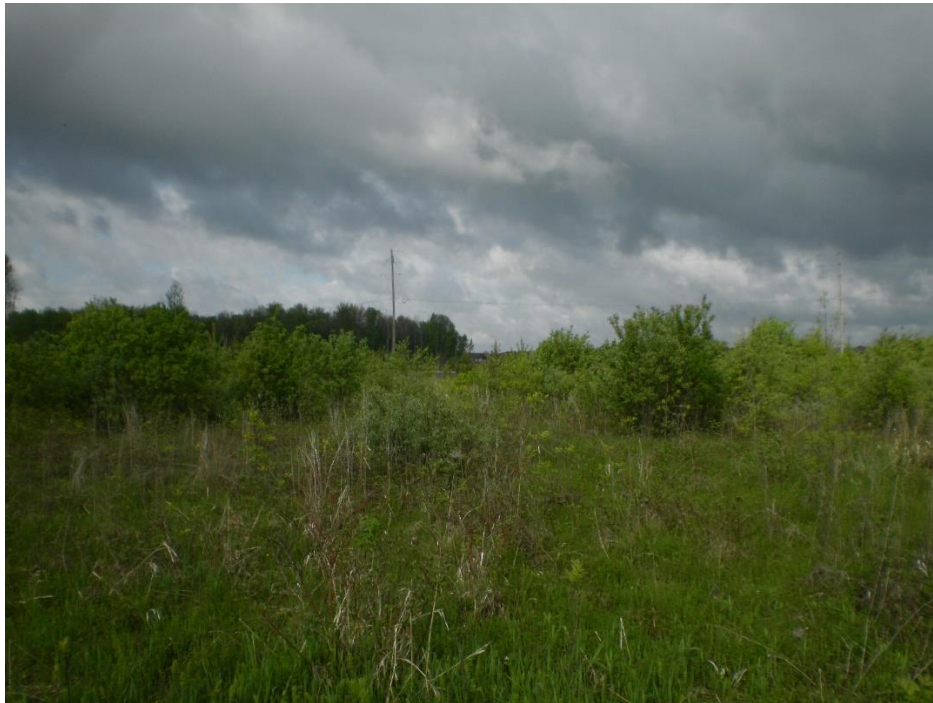
Photo 2 – Typical cultural thicket habitat which dominates the site. This example is in the southwest portion looking west to Spratt Road