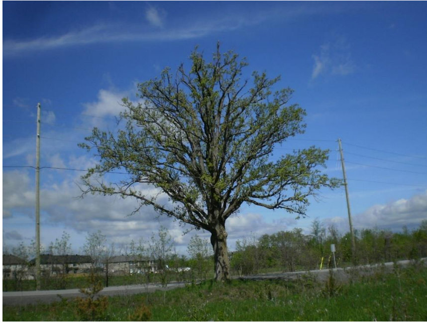
Photo 9 – Mature bur oak along the east edge of the Spratt Road allowance, immediately west of the northeast corner of the site. View looking northwest