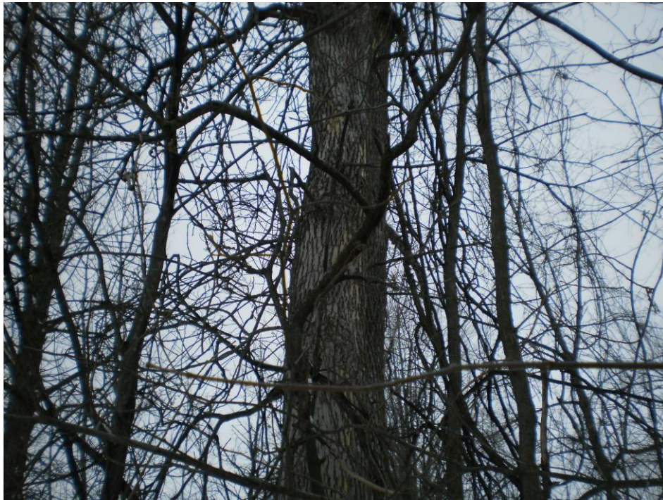
Photo 6 – One of the largest white ash deciduous trees observed on the site, in a north-south hedgerow in the northwest portion of the site. Tree contains potential wildlife cavities and shows EAB damage