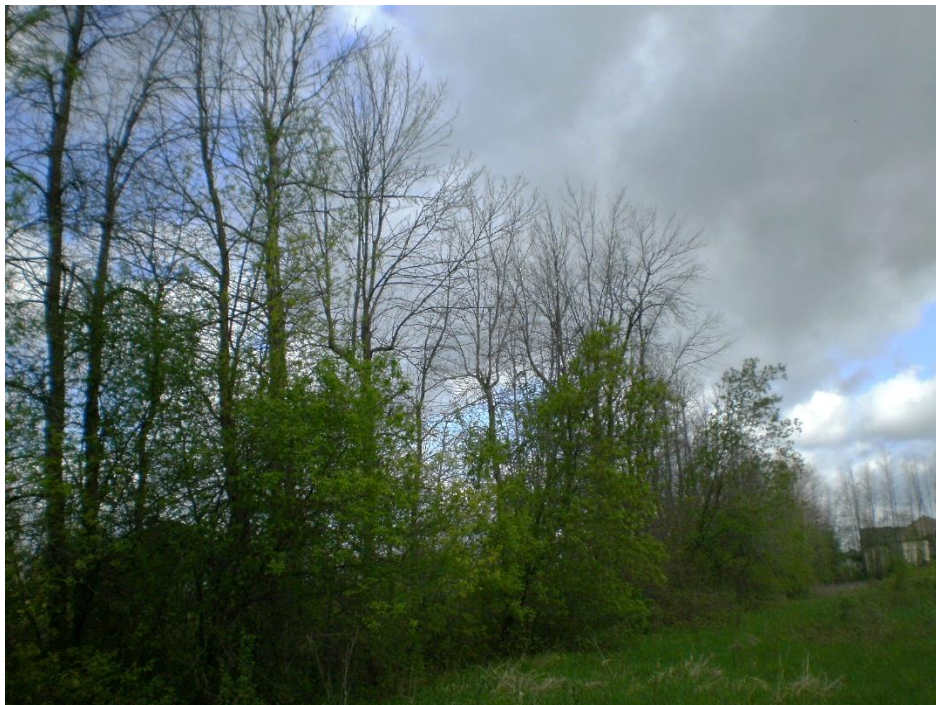
Photo 4 – Typical north-south deciduous hedgerow. This example is in the east portion of the site with view looking north from the south edge of the hedgerow