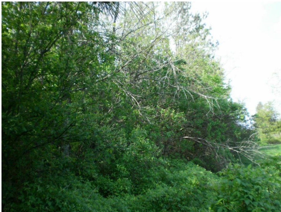
Photo 8 – Young deciduous forest immediately to the south of the southeast corner of the site. View looking west