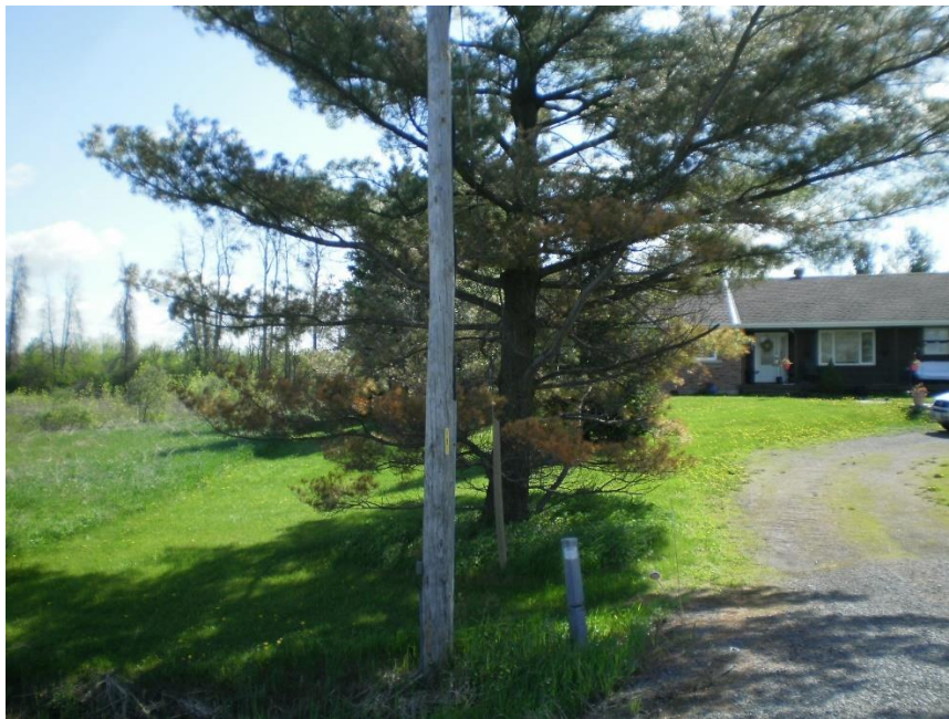
Photo 10 – White pine near the shared property line with the north edge of 4661 Spratt Road, east of Spratt Road. View looking east