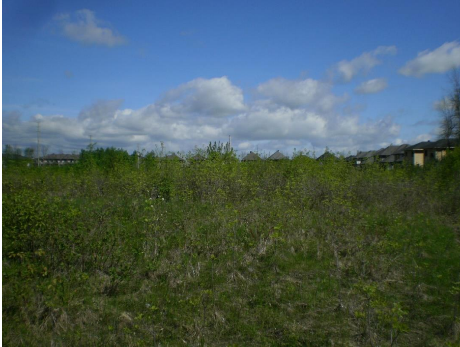
Photo 3 – Cultural thicket in the northwest portion of the site. View looking north