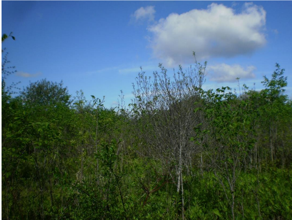
Photo 1 – Cultural thicket in the northeast portion of the site. View looking northwest