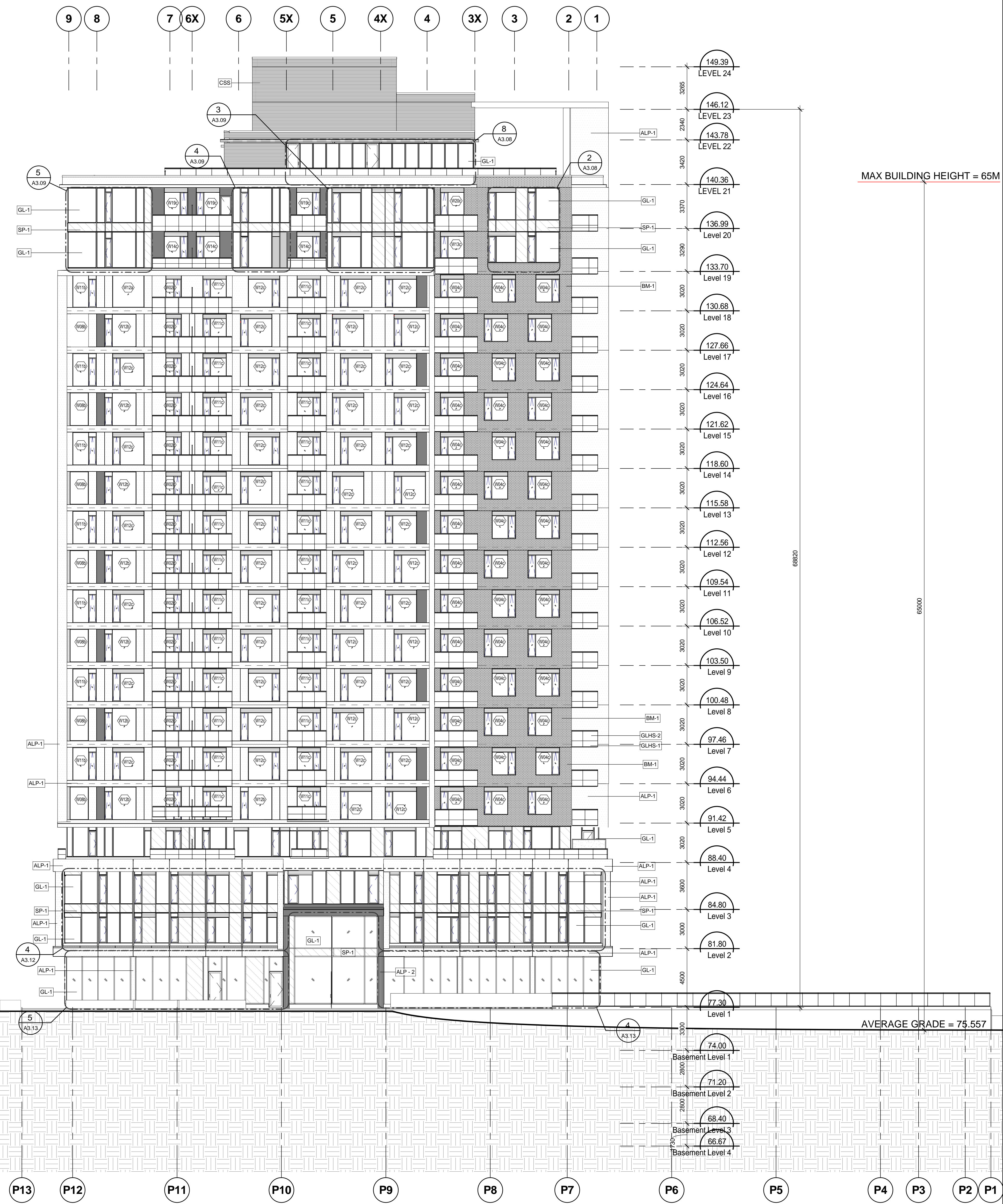
1 NORTH ELEVATION SCALE: 1 : 150