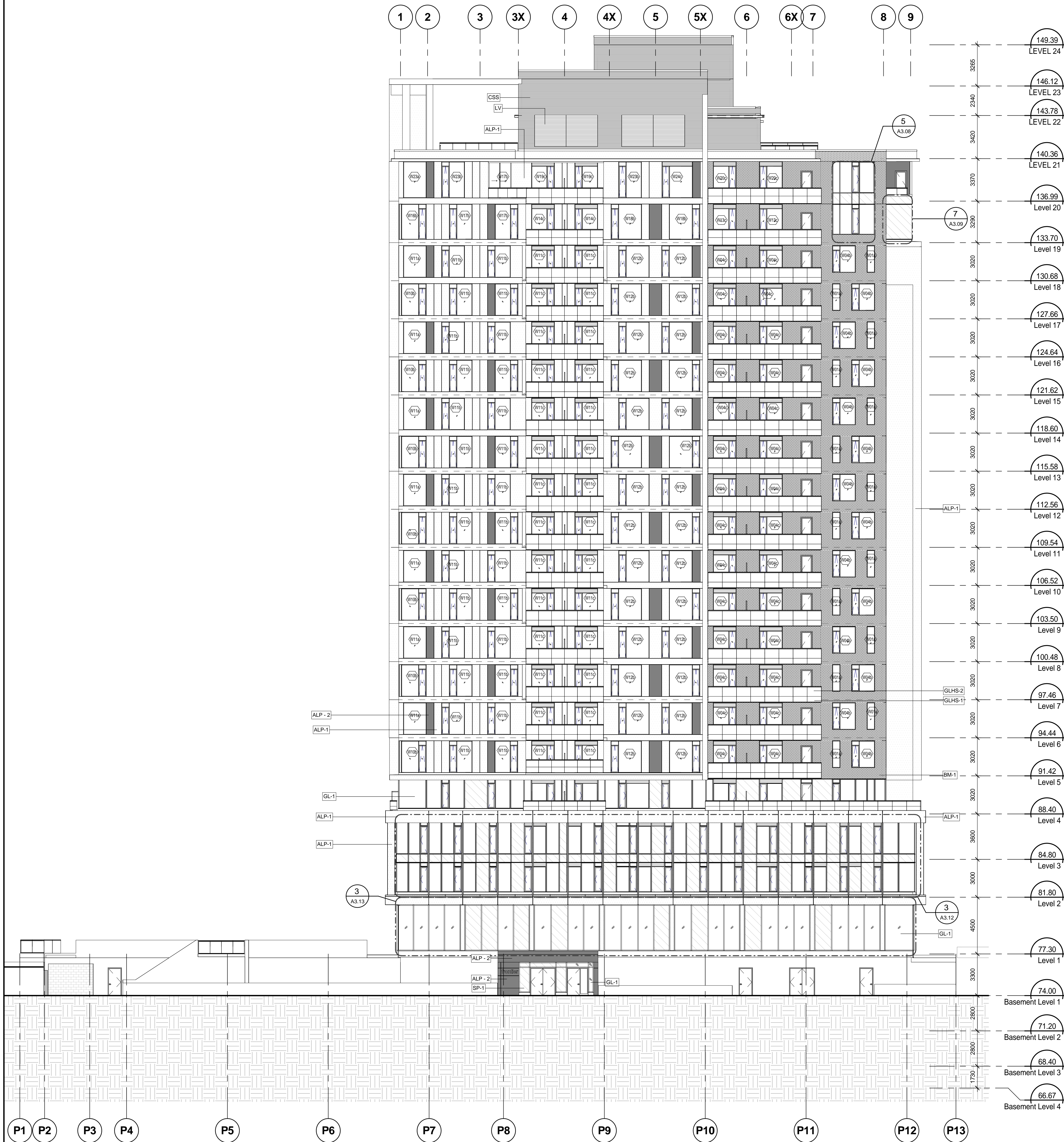
1 SOUTH ELEVATION SCALE: 1 : 150