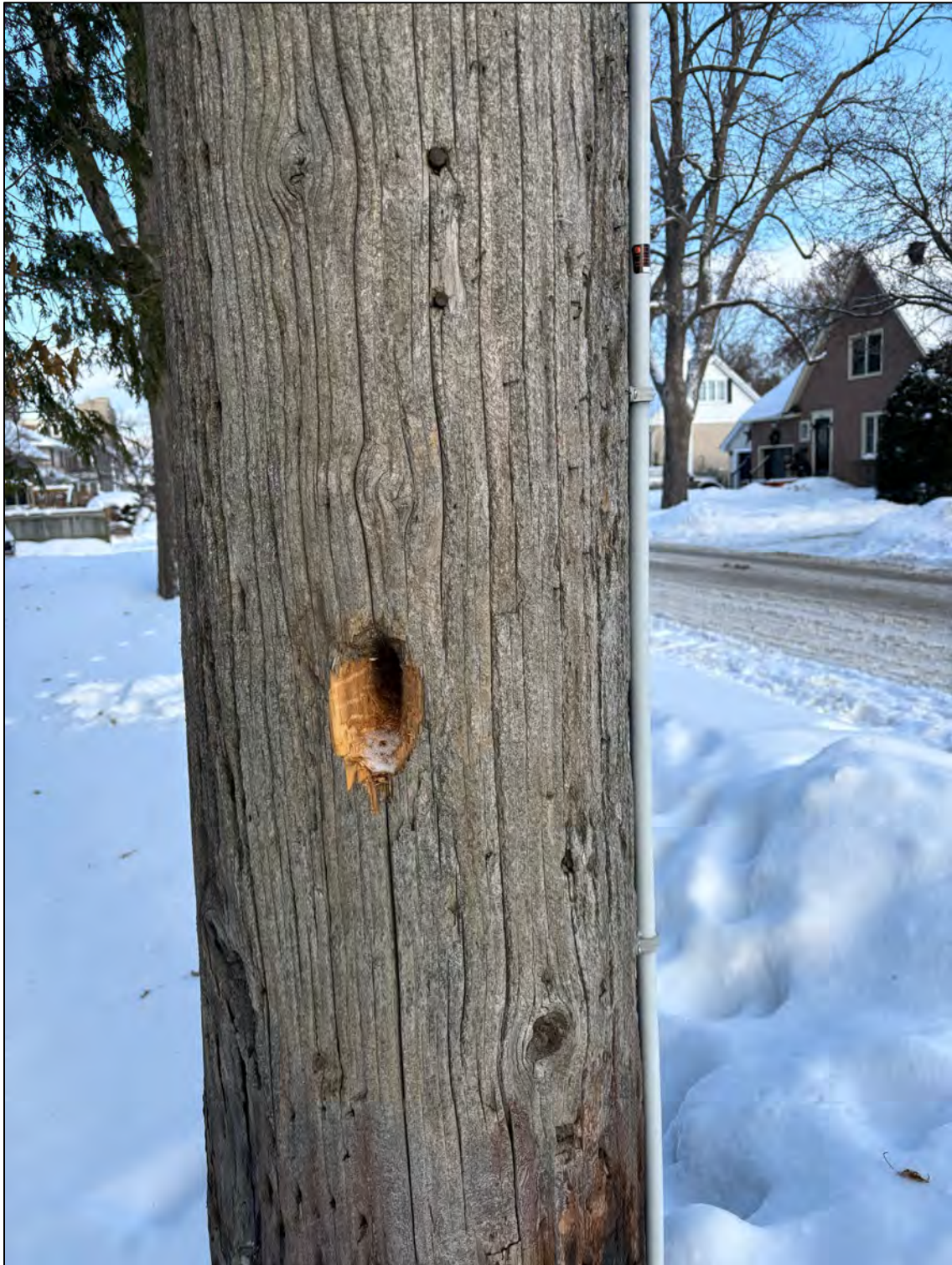
Photo 5: Hydro pole on City of Ottawa property with potential Pileated Woodpecker foraging cavity