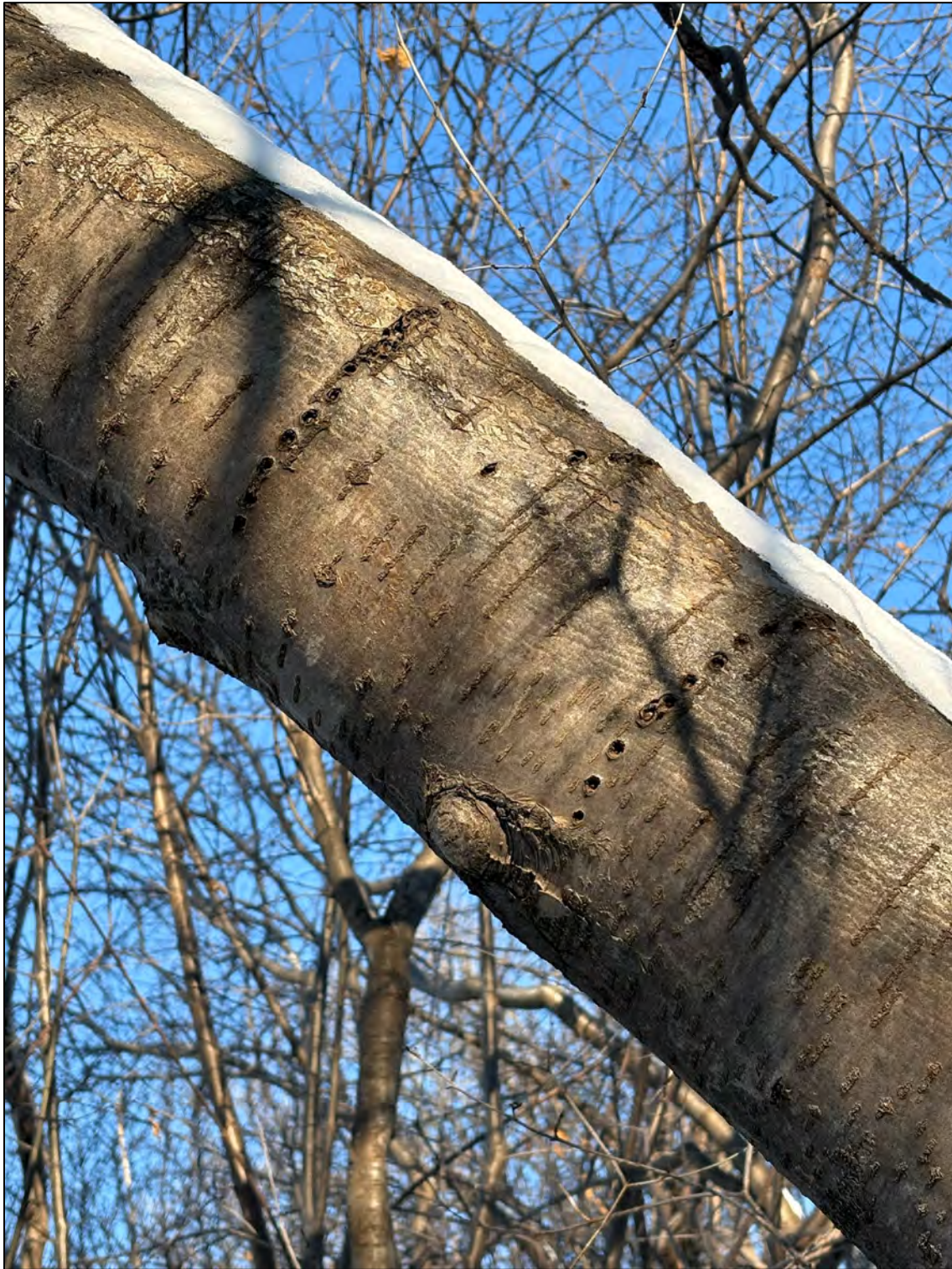
Photo 4: Tree #30 (Oakleaf Mountain Ash) on NCC property with Yellow-bellied Sapsucker foraging holes