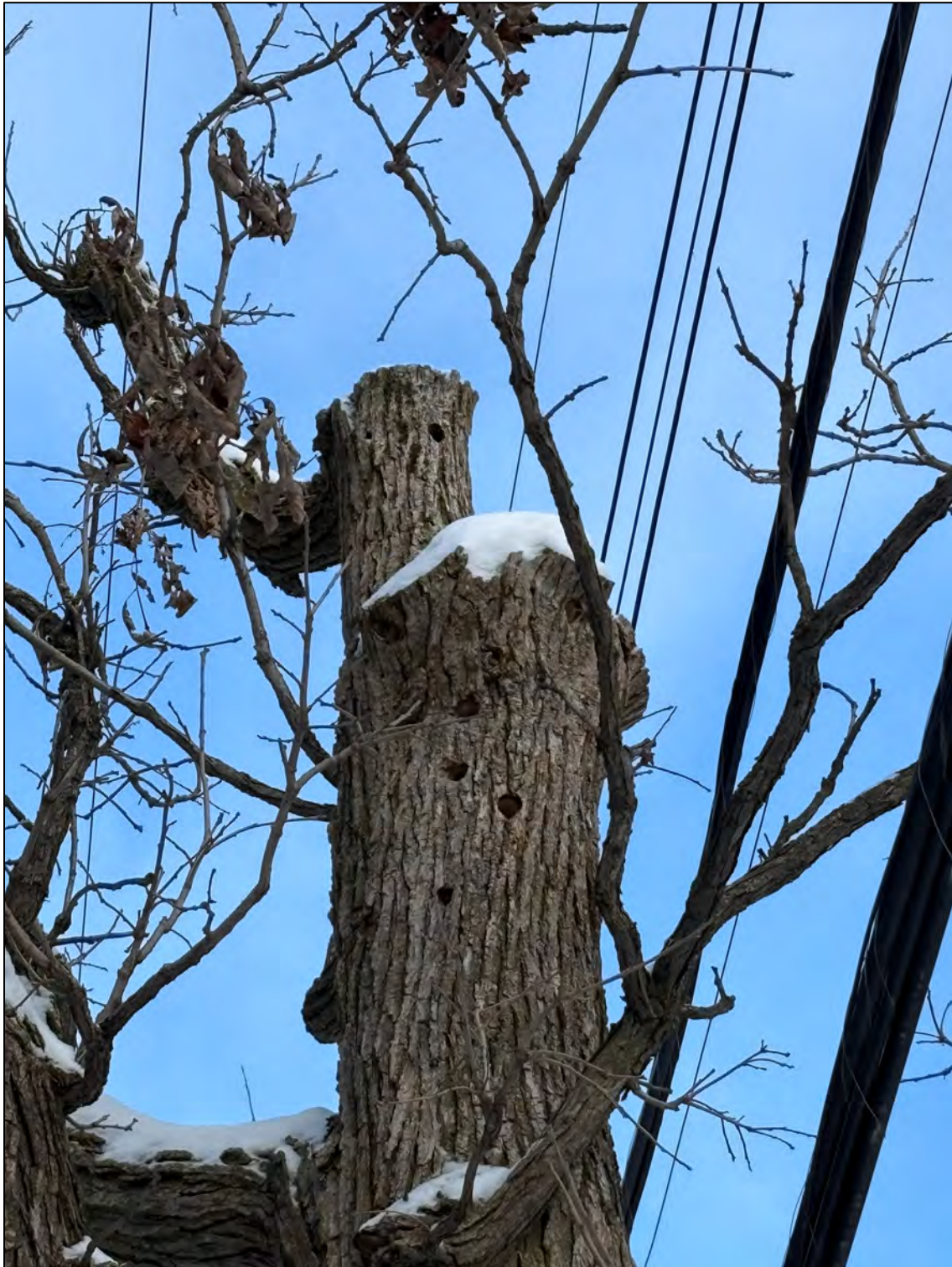
Photo 1: Tree #4 (Bur Oak) on City of Ottawa property with woodpecker foraging cavities (species unknown)