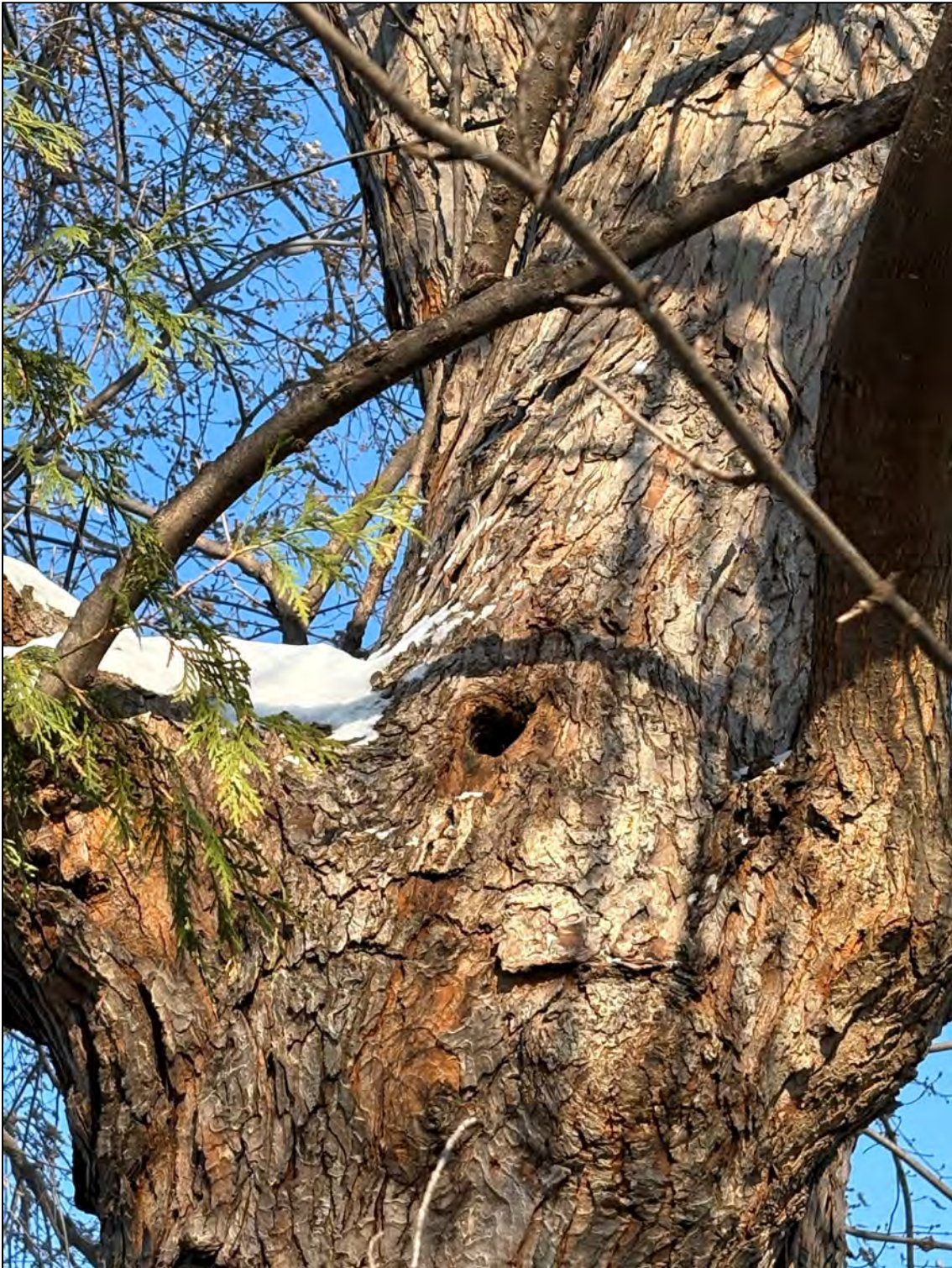
Photo 2: Tree #16 (Sugar Maple) on the Site with potential Pileated Woodpecker nest cavity