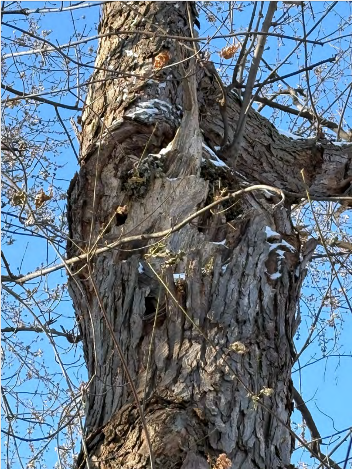
Photo 3: Tree #16 (Sugar Maple) on the Site with potential Pileated Woodpecker foraging cavities