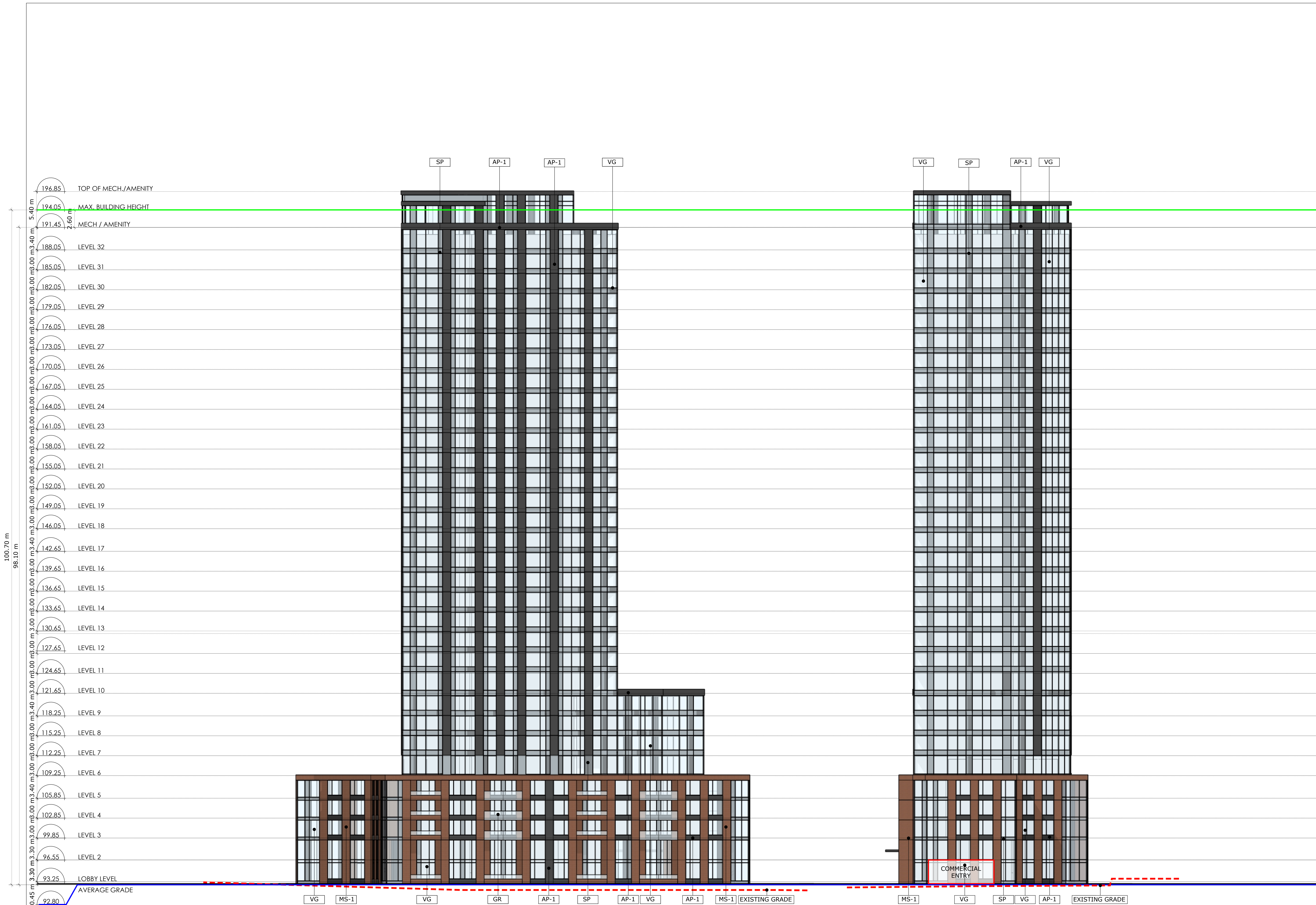
1 BUILDING 4 - NORTH ELEVATION A3.03 Scale: 1: 250