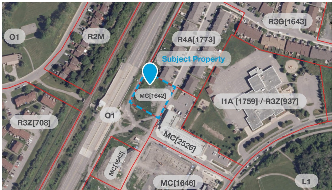
Figure 5: Zoning Map (GeoOttawa)

The subject site is zoned MC[1642] Mixed-Use Centre Zone, as shown in Figure 9 below.