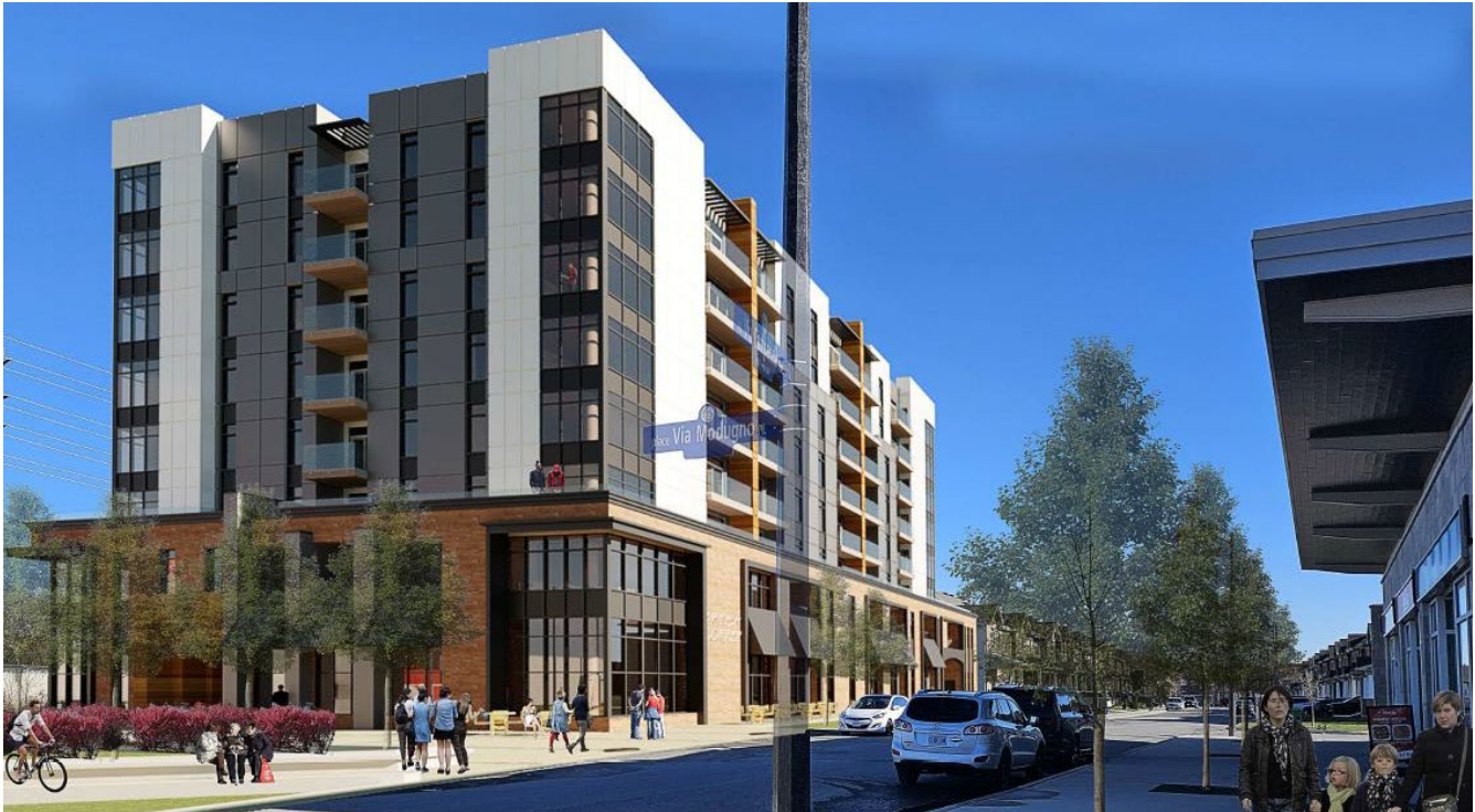
Figure 3: Rendering of the proposed development, showing the building from the street view, facing north.

The proposed nine-storey mixed use, mid-rise building will be predominantly residential in nature with commercial retail uses at grade fronting onto the public realm. The previously approved development contained 92 residential units, whereas the new proposal contains 99 dwelling units. The new unit makeup consists of 10 bachelor units, 21 one-bedroom units, 42 one-bedroom-plus-den units, and 26 two-bedroom units. Of these, 21 will be barrier-free units.