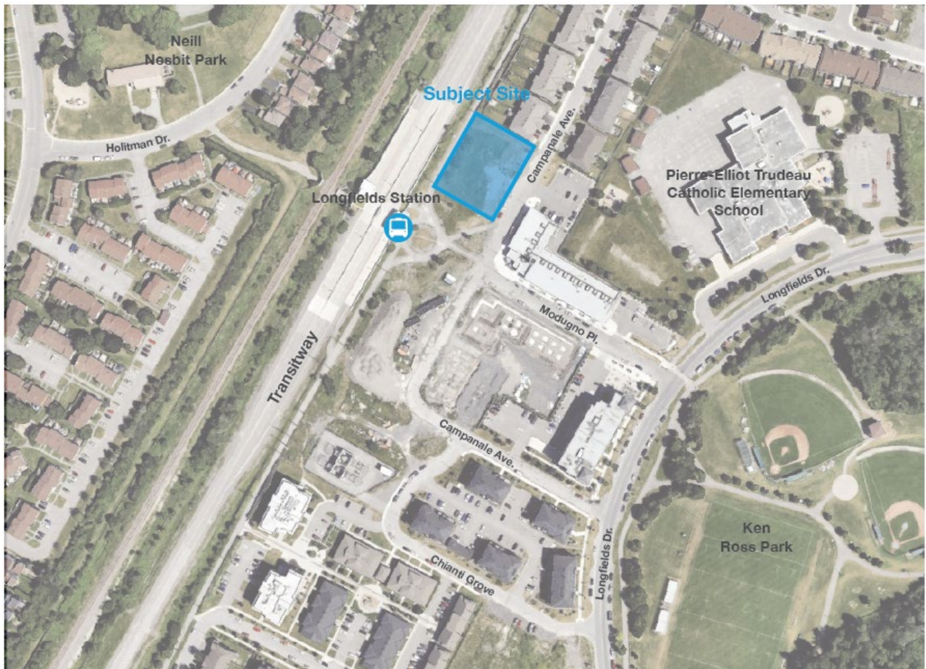
Figure 1: Aerial view of the subject site.

The subject site abuts and relates to the Longfields Station Transit plaza, which provides connections to Longfields Station from Campanale Avenue and Modugno Place.