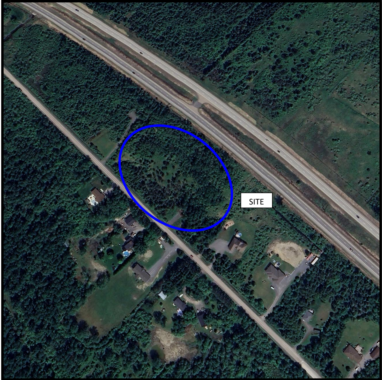
AERIAL PHOTOGRAPH 2025