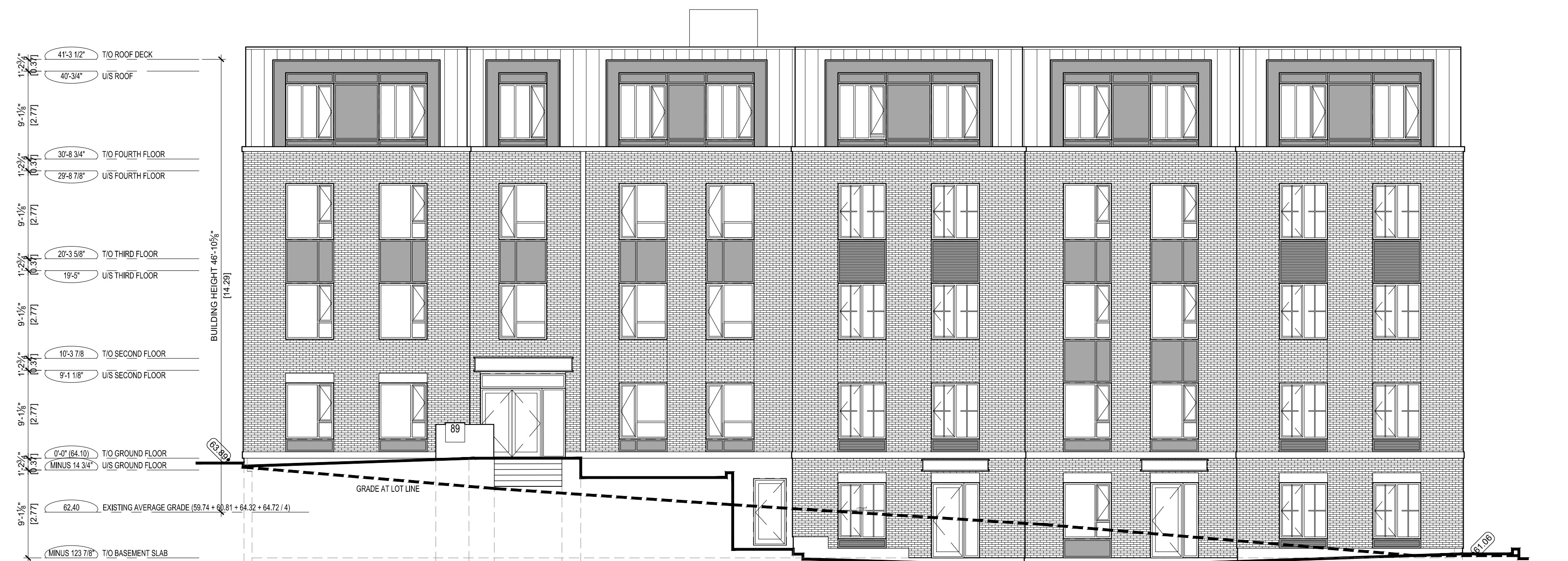
1 FRONT (WEST) ELEVATION SCALE: 1:100