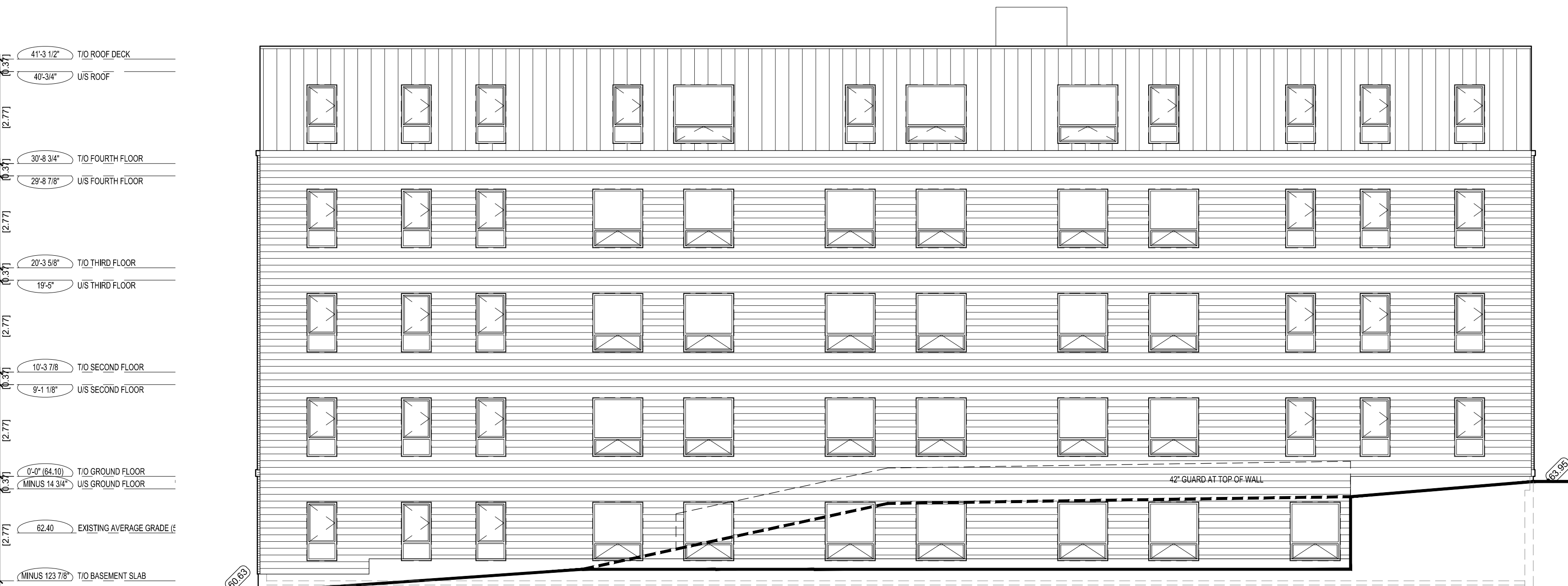
3 REAR (EAST) ELEVATION SCALE: 1:100