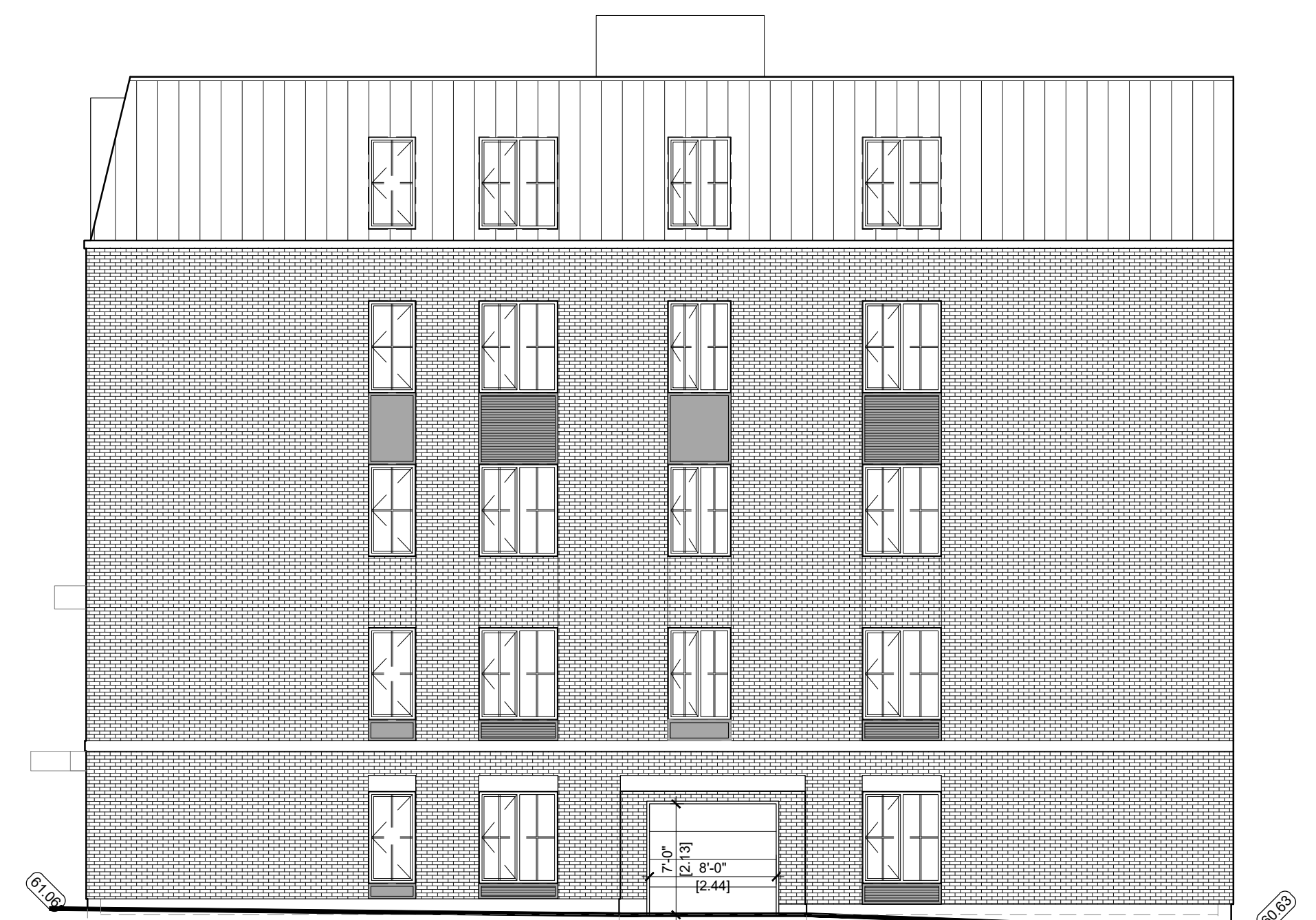
2 RIGHT (SOUTH) SIDE ELEVATION SCALE: 1:100