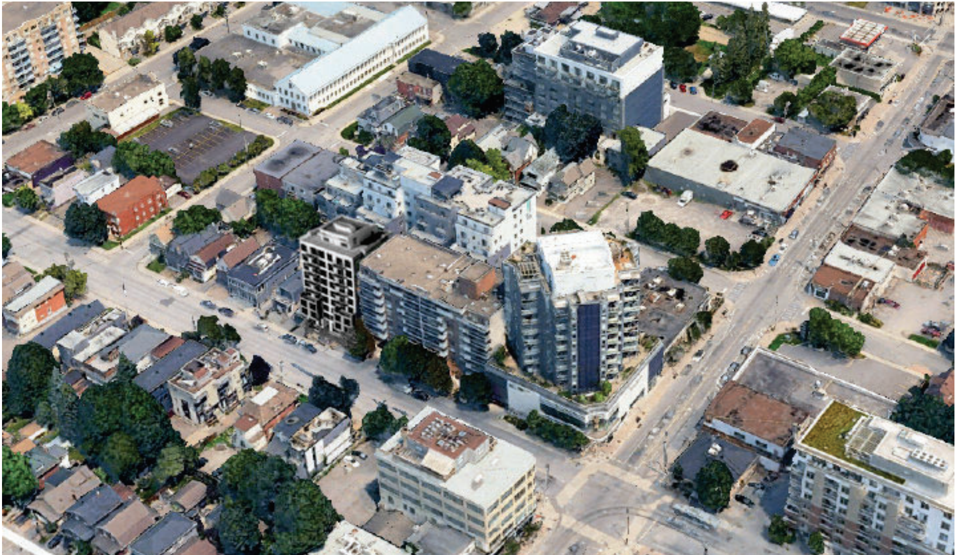
.1 BUILDING MASSING - VIEW FROM SOUTH-WEST

91-93 Holland Avenue | 03-04-2025 | City of Ottawa Design Brief