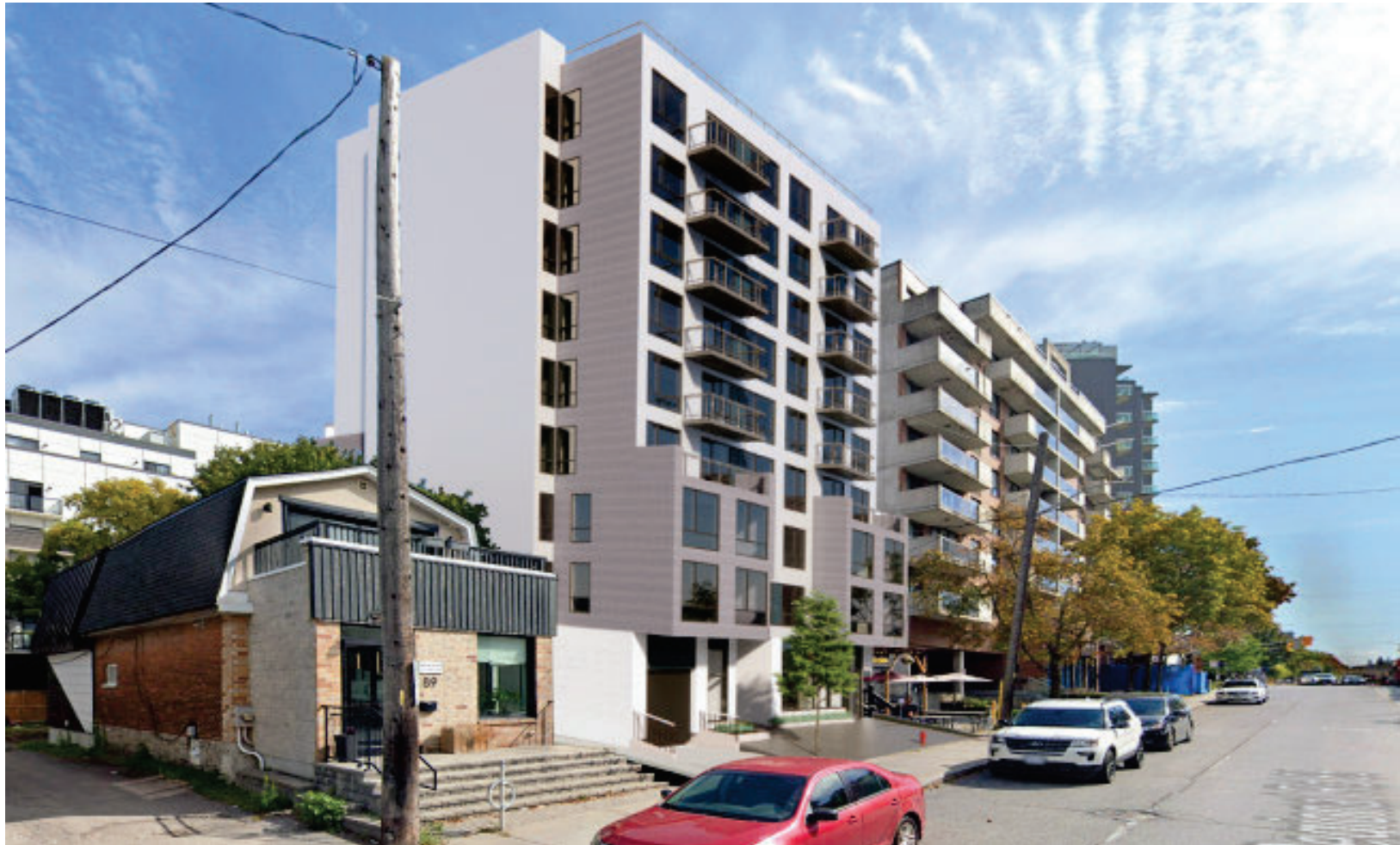
.6 BUILDING PERSPECTIVE - OBLIQUE VIEW FACING SOUTH-EAST

91-93 Holland Avenue | 03-04-2025 | City of Ottawa Design Brief