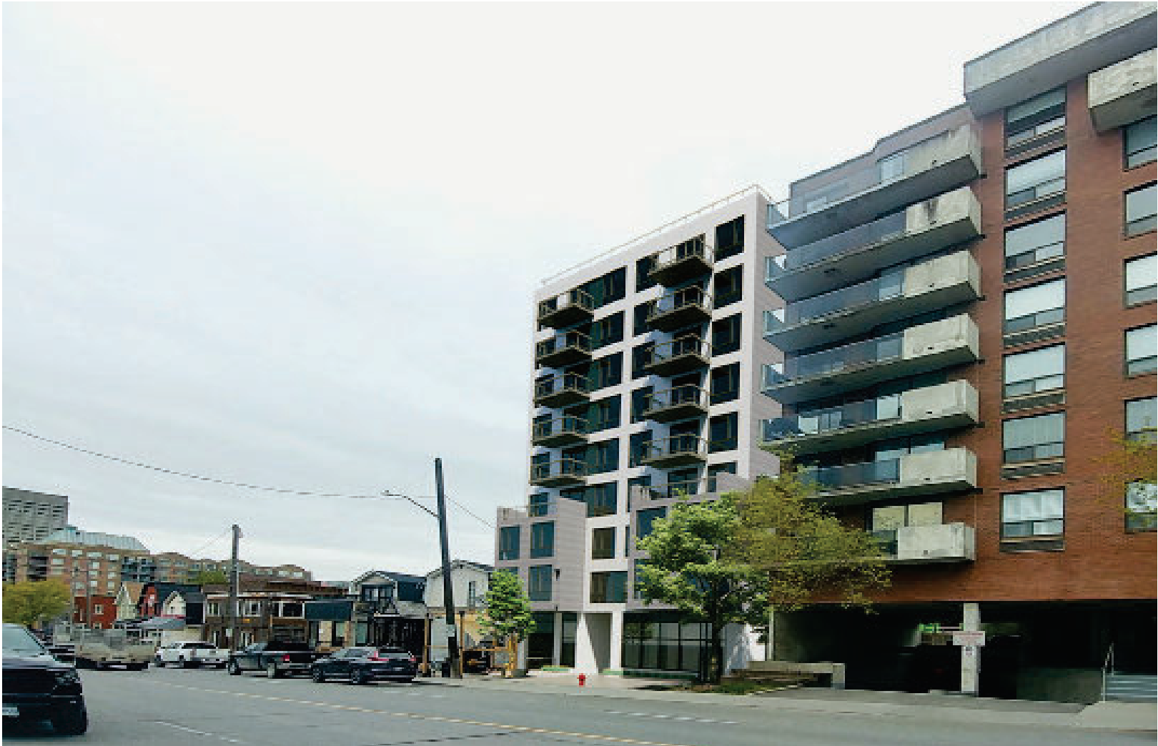
.7 BUILDING PERSPECTIVE - OBLIQUE VIEW FACING NORTH -WEST

91-93 Holland Avenue | 03-04-2025 | City of Ottawa Design Brief