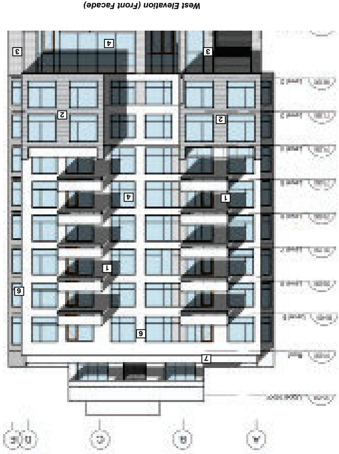
West Elevation (Front Facade)