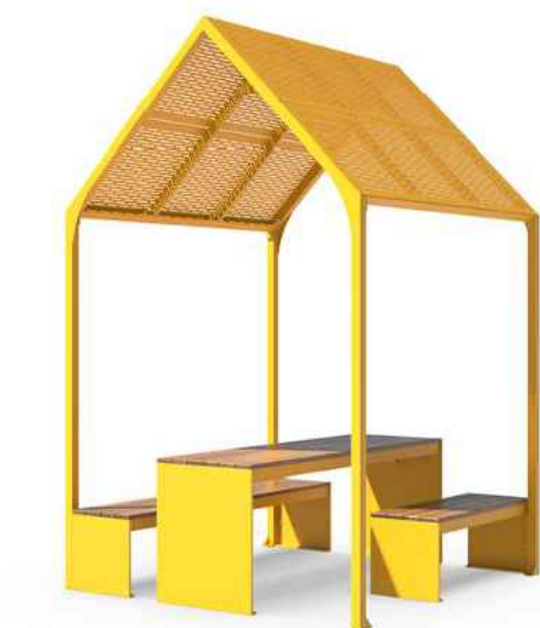
PICNIC TABLE HOUSE