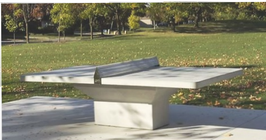
CONCRETE PING PONG TABLE