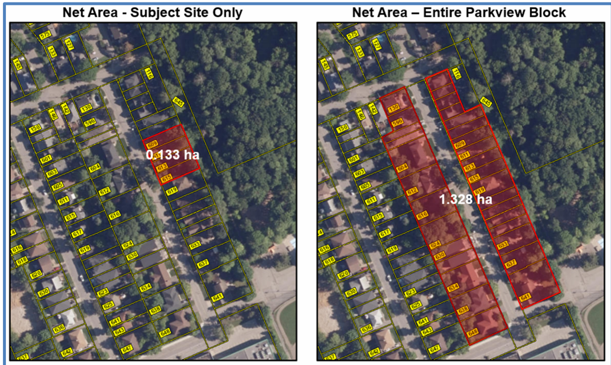
Figure 7: Net Area Calculations

The following policies apply when considering the development of urban infill housing: