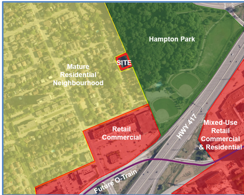
Figure 2: Site Context