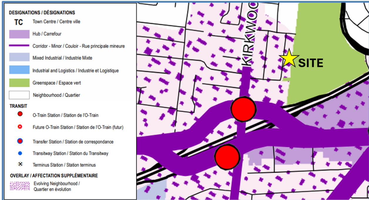
Figure 6: Site Shown on Schedule B2 (Inner Urban)

context-sensitive development, or where an overlay directs evolution, for gradual well-planned transformation.