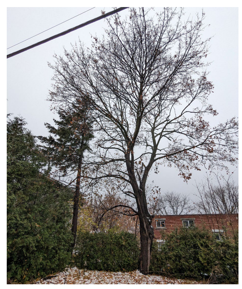
Above: Tree 1 (right) - Private maple to be removed and Tree 2 (left) - private spruce to be removed. Below: main union of Tree 1