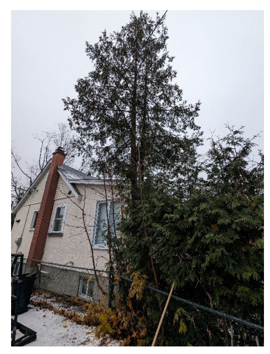
Above: Tree 6 - private cedar to be removed.

Above right: Canopies of Trees 3-5 - private maples to be removed.