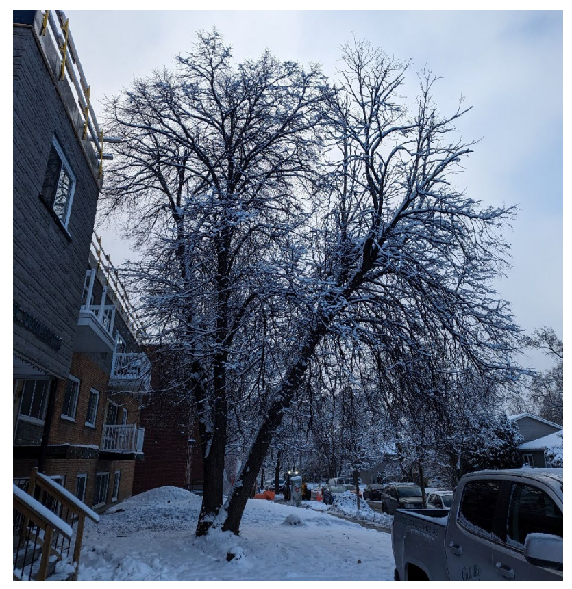
Above: Tree 20 - Private linden to be retained. Recommend removing the leaning stem.

Right: Tree 26 – group of adjacent spruce to be retained.