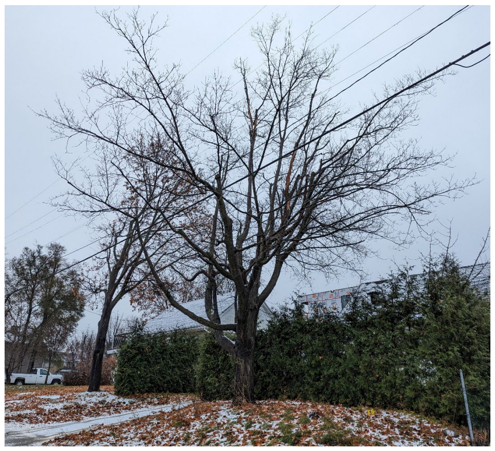
Above: Tree 9 (left) and Tree 8 (right) -City maples to be removed.