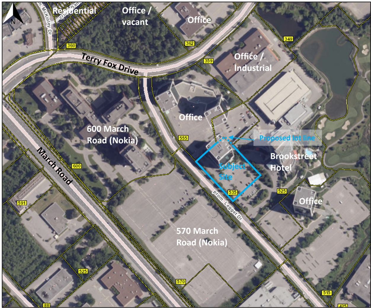
Figure 1: Subject site and surrounding area