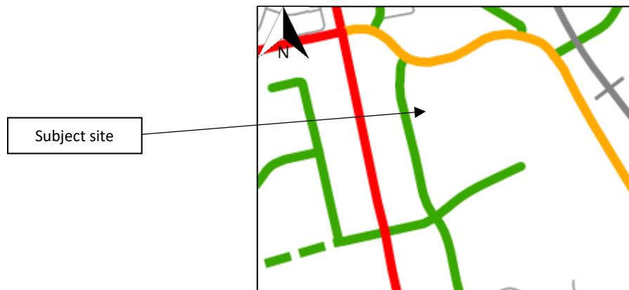
Figure 6: Schedule C4

Schedule C4 – Urban Road Network designates Legget Drive as a Minor Collector (green):