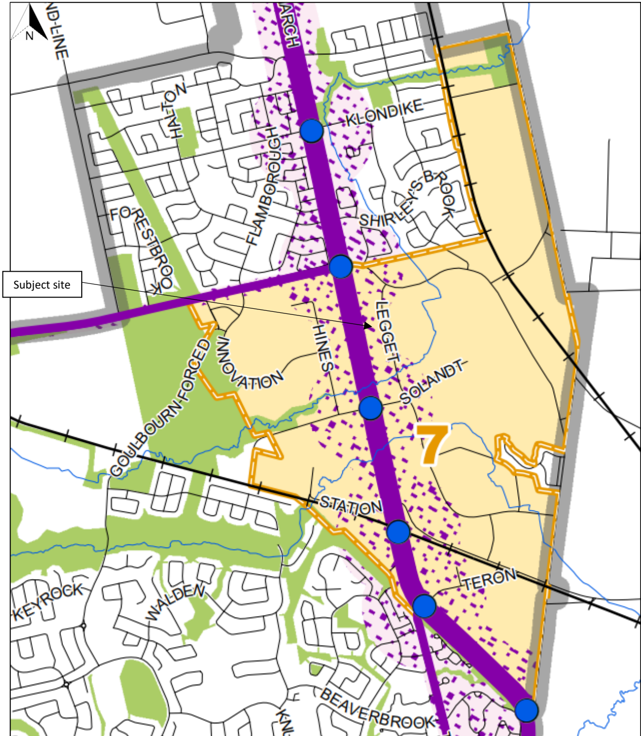
Figure 3: Schedule B5

Schedule B5 - Suburban (West) Transect designates the subject site as part of the Kanata North Economic District (yellow):