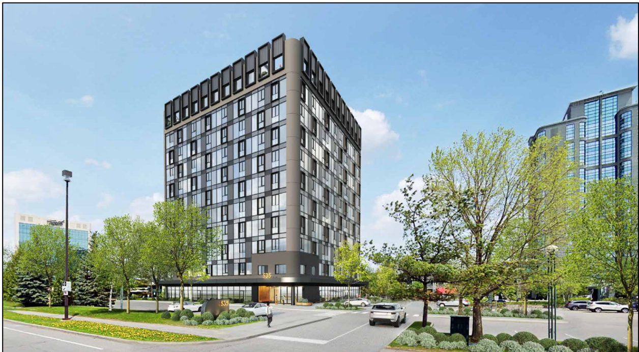
Figure 2: Proposal looking northeast

New vehicular and pedestrian accesses will be provided from Legget Drive. The office building is currently accessed via 555 Legget Drive and the intention is to visually and functionally separate the residential building from neighbouring office buildings. The access across 555 Legget will still serve as an exit from the drop-off area to Legget Drive, access to the move in/out space and for pedestrians. 108 car parking spaces will be provided. However, it is proposed to remove the requirement for resident and office parking from the zoning, in line with Official Plan policy and to just retain the visitor parking requirement. A total of 95 bicycles spaces will be provided, of which 89 will be in the basement and six near the building entry.