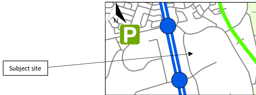
Figure 4: Schedule C2

Schedule C2 – Transit Network shows Transitway Stations (blue) at the intersections of March Road and Terry Fox Drive and Solandt Road: