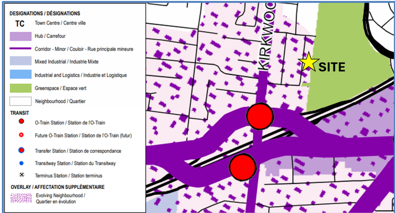
Figure 6: Site Shown on Schedule B2 (Inner Urban)

context-sensitive development, or where an overlay directs evolution, for gradual well-planned transformation.