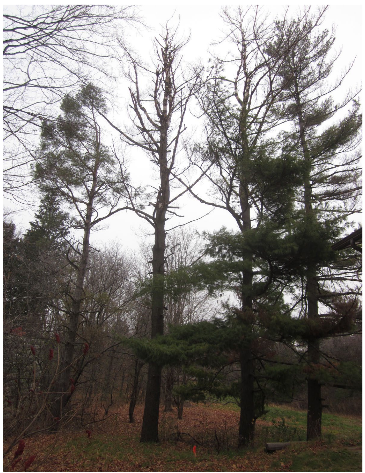
Picture 5. Trees #56 through #59 (right to left) at 1815 Montreal Road