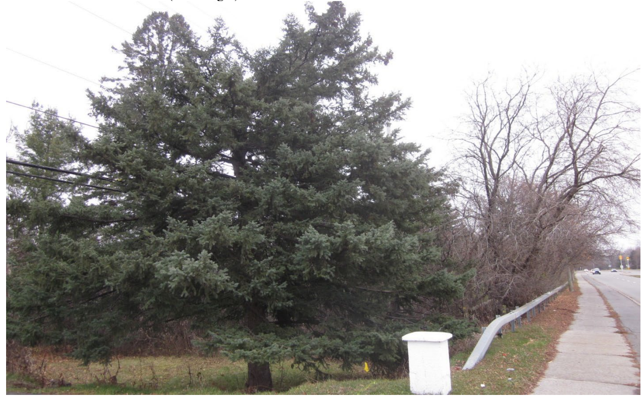
Picture 7. Trees #2 (left) and #71 and #72 (right background) at 1815 Montreal Road