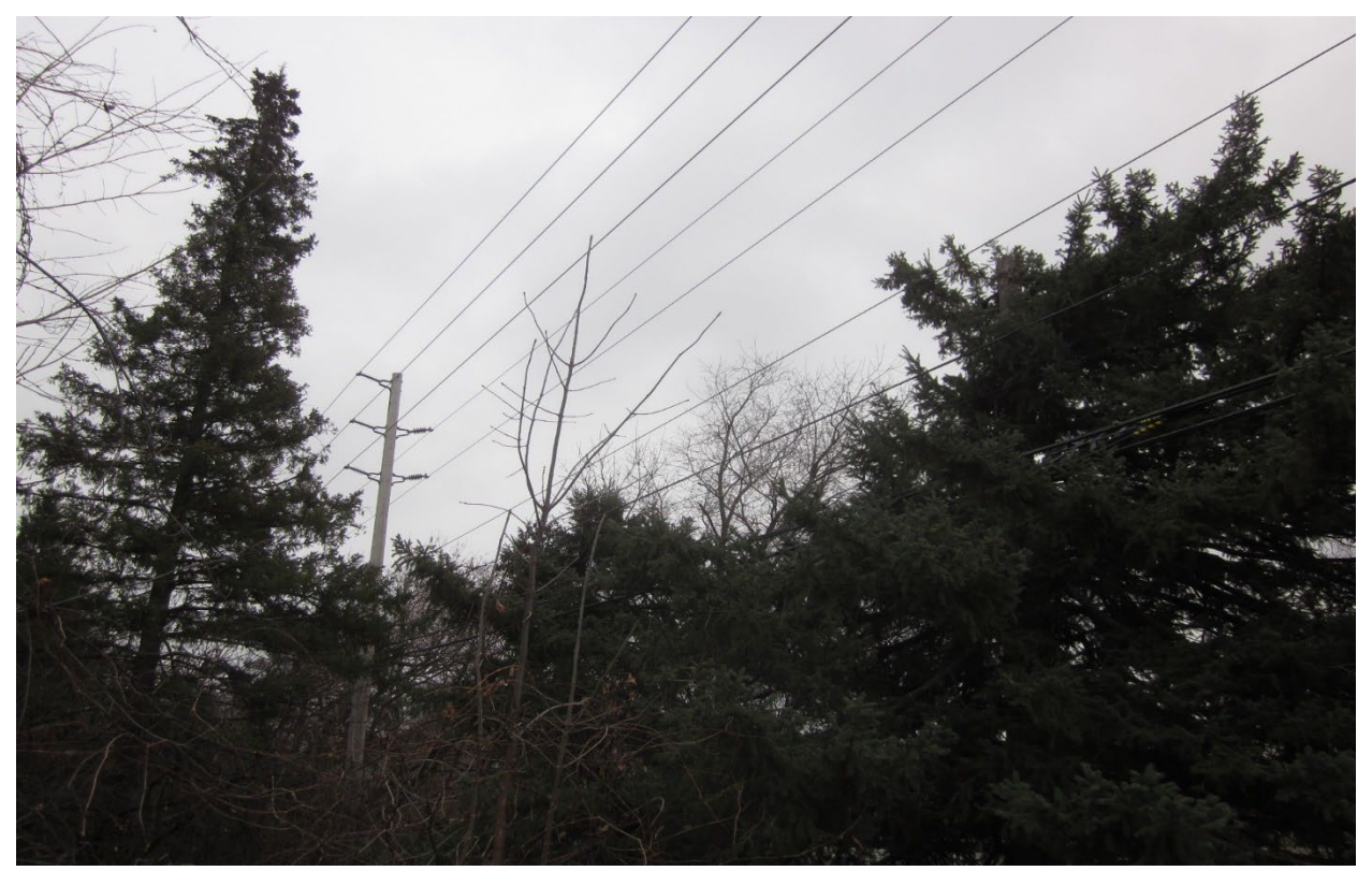
Picture 1. Trees #1 and #2 (right and centre) and #3 (left) at 1815 Montreal Road