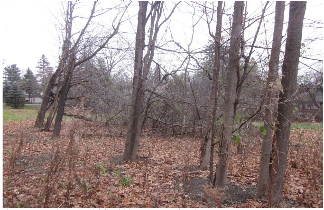
Picture 4. Trees #40 through #46 (left to right) at 1815 Montreal Road

Picture 3. Trees #30 through #39 (left to right) at 1815 Montreal Road