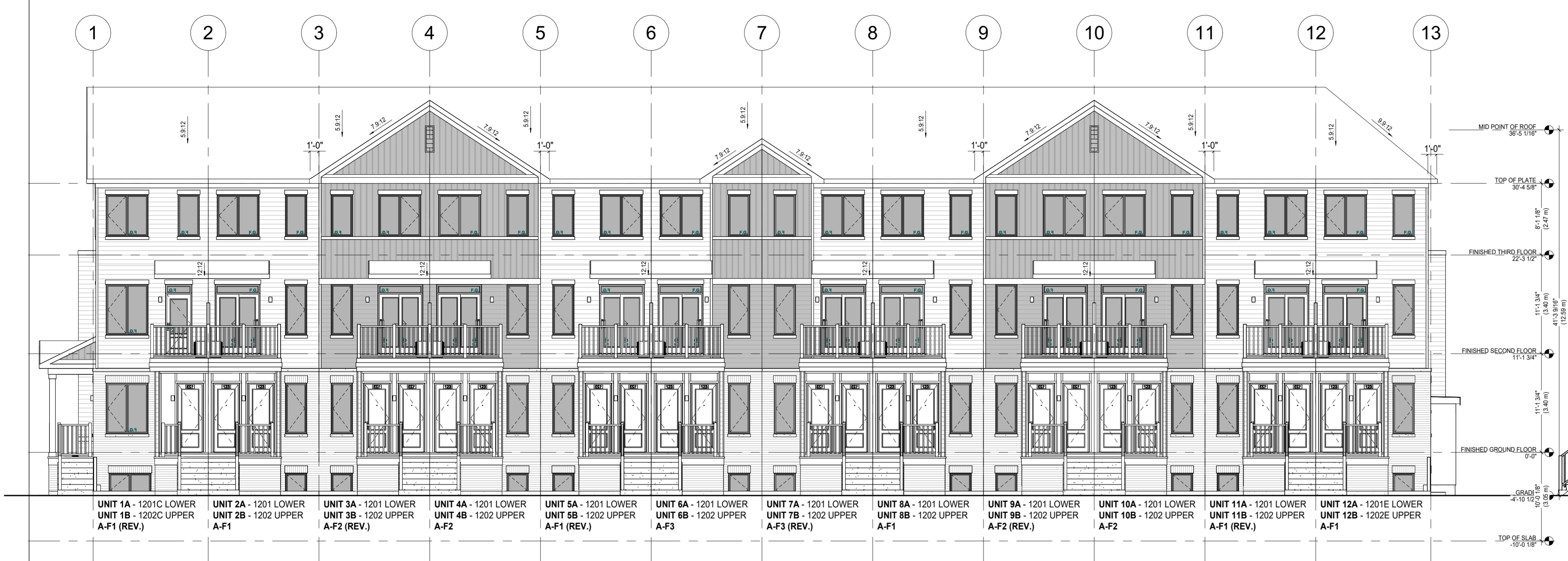
1 24 UNIT BLOCK - FRONT ELEVATION A 1/8" = 1'-0"

Block elevations are to vary between blocks with the provided two options Option 1 and Option 2.