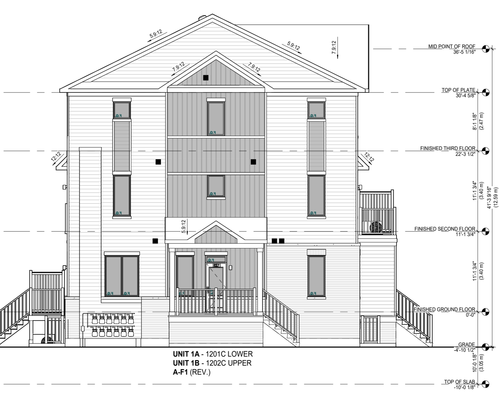
4 24 UNIT BLOCK - LEFT ELEVATION A 1/8" = 1'-0"