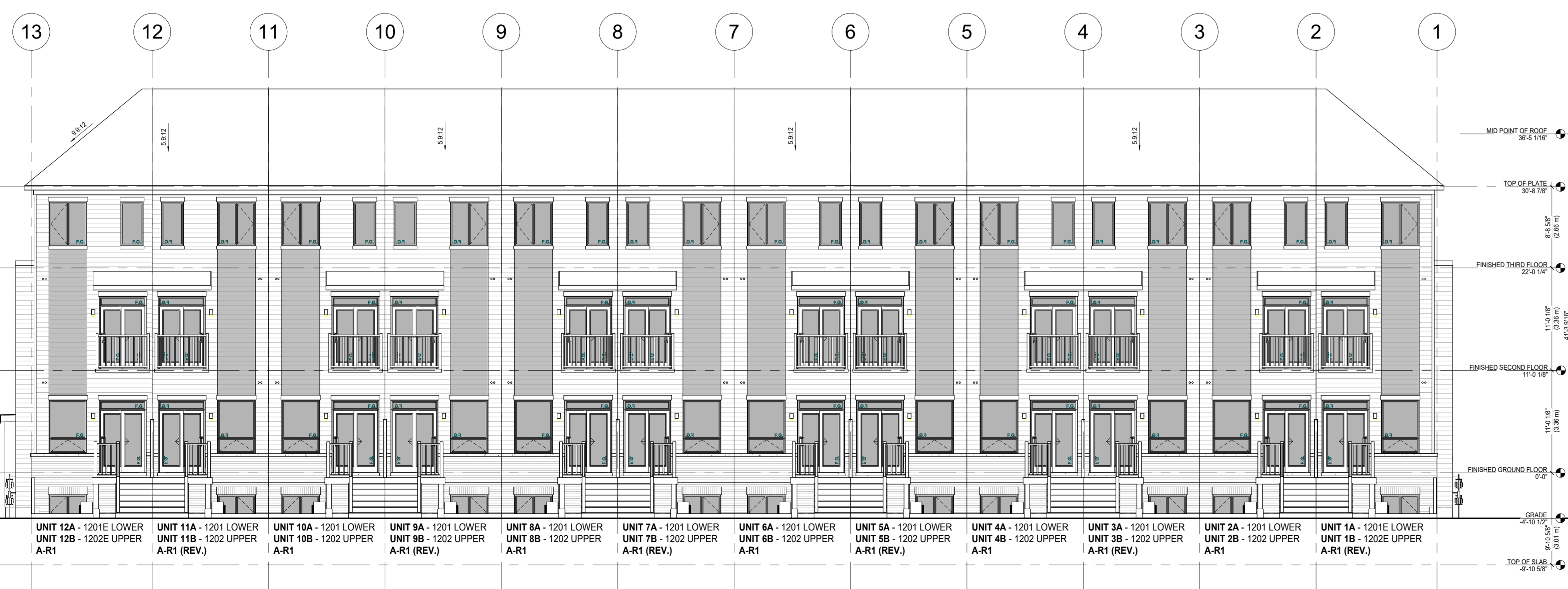
3 24 UNIT BLOCK - REAR ELEVATION A 1/8" = 1'-0"