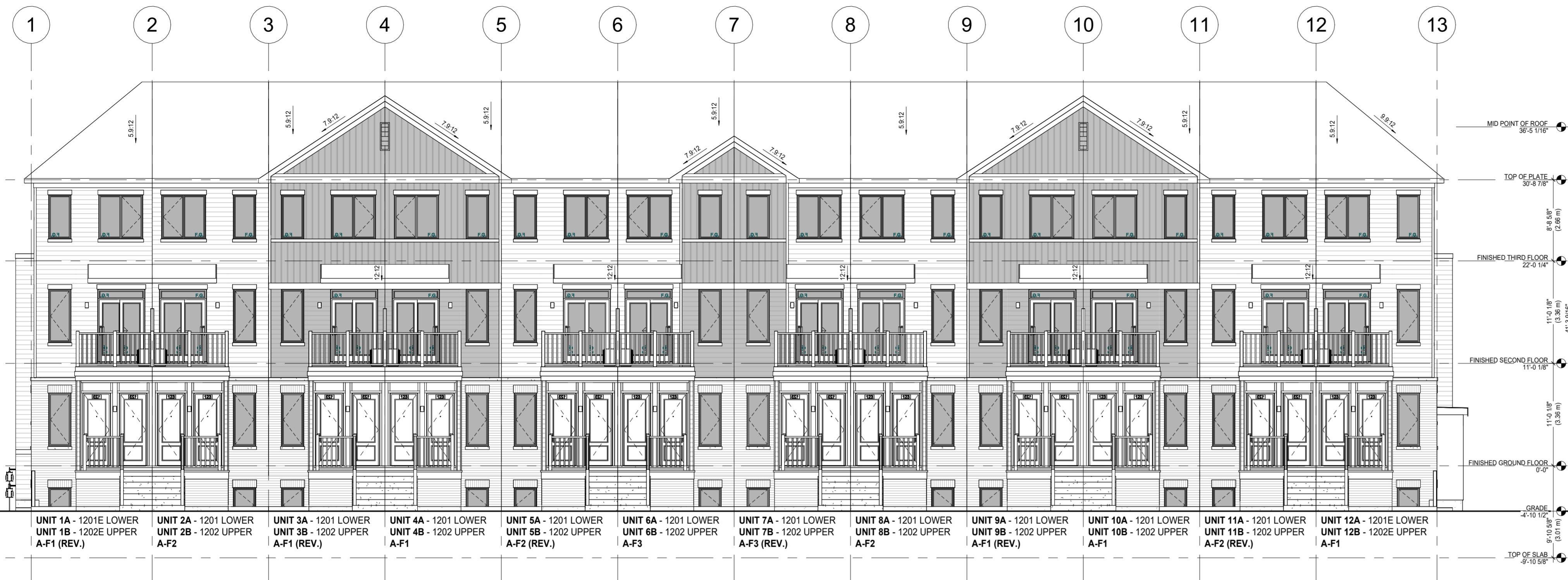
1 24 UNIT BLOCK - FRONT ELEVATION A 1/8" = 1'-0"

Block elevations are to vary between blocks with the provided two options Option 1 and Option 2.